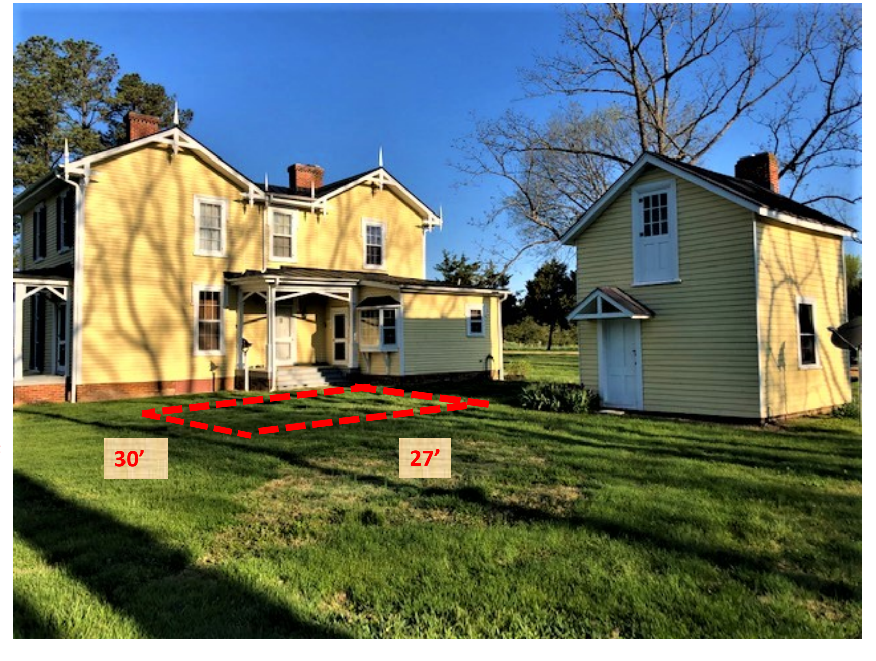
Proposed Patio (Red) in Rear (East) Yard of Main House (Left), Kitchen Dependency at Right. Looking Northwest.