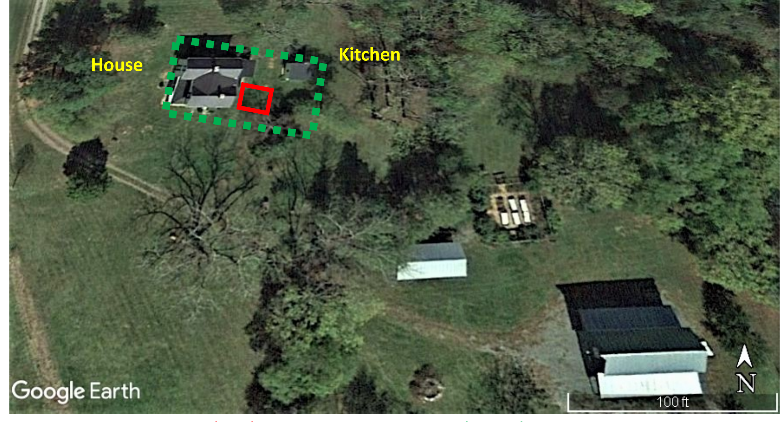
Proposed Patio: Footprint (Red), Area of Potential Effect (Green). Direction, Scale Lower Right.