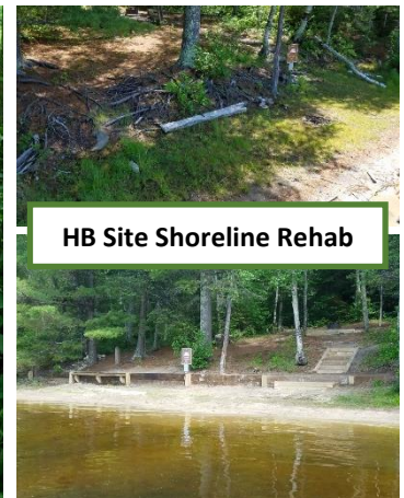
HB Site Shoreline Rehab