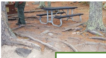
Pine Point Campsite Rehab

By law and National Park Service (NPS) policy, recreation fee revenue must be spent on projects that improve the visitor experience. Ninety-seven percent of the fee revenue collected stays at VOYA. These funds are allocated for seasonal staff to clean and maintain sites, purchase amenities like bear lockers and picnic tables, to fund youth crew projects that address deferred maintenance, to complete a variety of campsite and trail rehab projects, and to fund staff that manage the recreation fee program and assist visitors with trip planning.