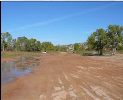
Blue Creek ORV Area