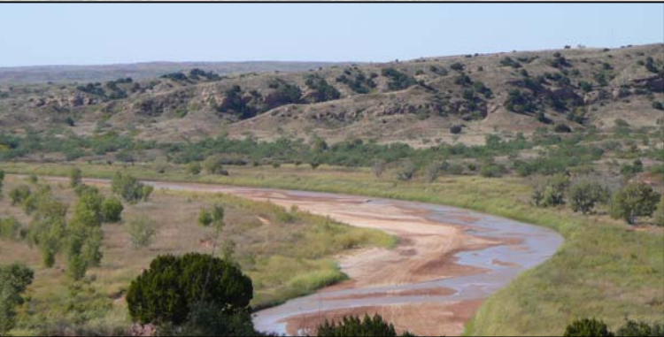
Rosita ORV Area

In 2005, Lake Meredith NRA and other park units were sued for allowing ORV use in areas without a special regulation and for failing to monitor ORV use. In response to the lawsuit, the Recreation Area initiated this planning effort in October of 2007 with internal scoping. The plan, and regulation if needed, will address ORV use at both Rosita and Blue Creek.