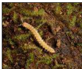
Cave Adapted Millipede

You can send us your comments by completing the enclosed comment form and mailing it back to us, by submitting your comments electronically through the web site http://parkplanning.nps.gov/labe , or in person at our public meetings. Thank you for your interest in Lava Beds National Monument and your participation in the revision of the Cave Management Plan.