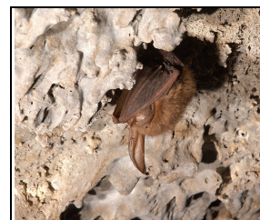
Townsend's Big-Eared Bat