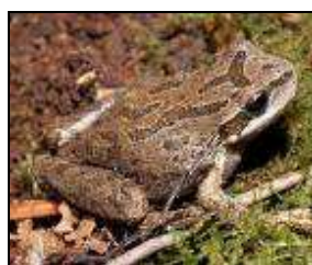
Pacific Tree Frog