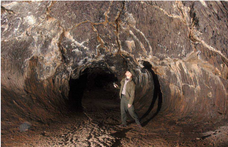
A Lava Beds National Monument park ranger examining the passage ceiling in Catacombs Cave.