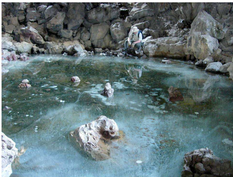
The ice floors of several caves, like this one at Heppe Ice Cave, represent a unique resource and management concern at Lava Beds.