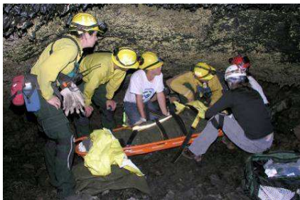
A simulated cave rescue in Catacombs Cave.

Your input and concerns regarding these topics or other topics is an important part of this process. Please refer to the Public Participation and Comment section to learn how to contribute to the planning process.