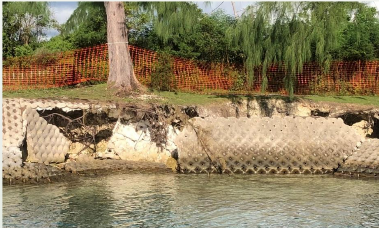
West Causeway Existing Condition