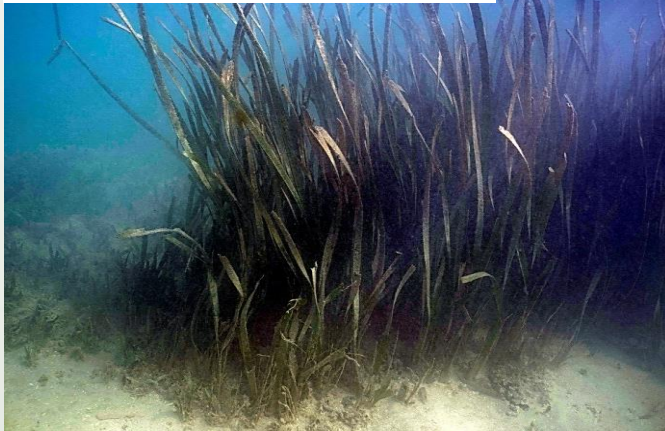
Seagrass Near Project Area