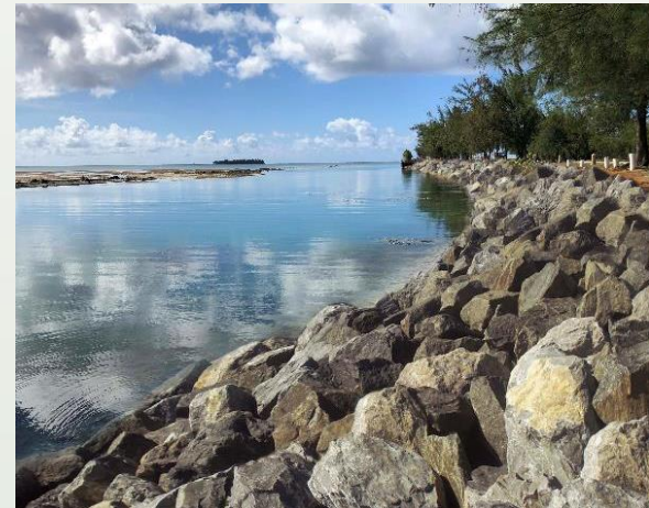
Proposed Rock Revetement