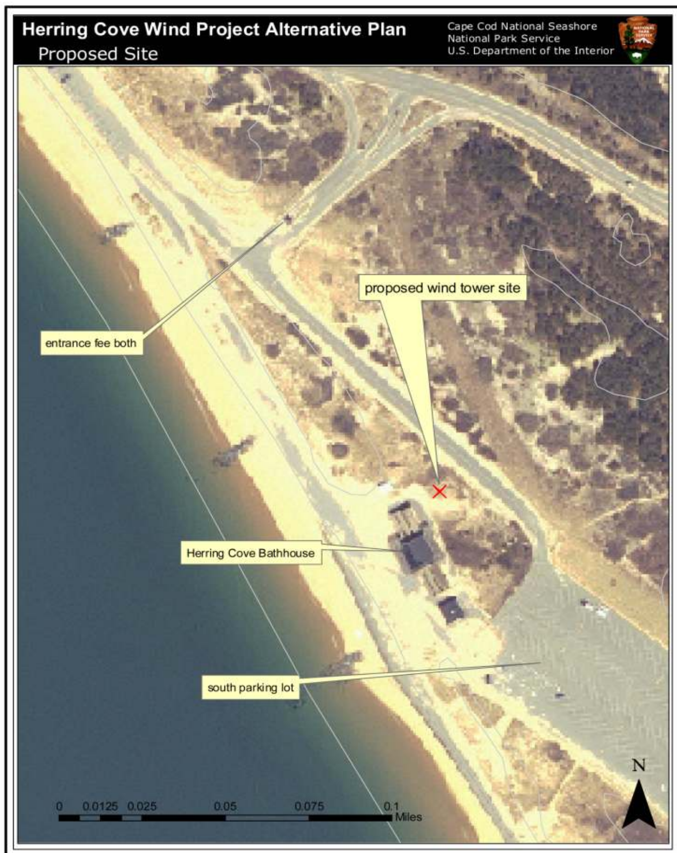
FIGURE 3-1 Herring Cove Beach Facilities and Proposed Project Sites- Herring Cove Bathhouse, parking lot, entrance fee booth, and proposed wind tower site