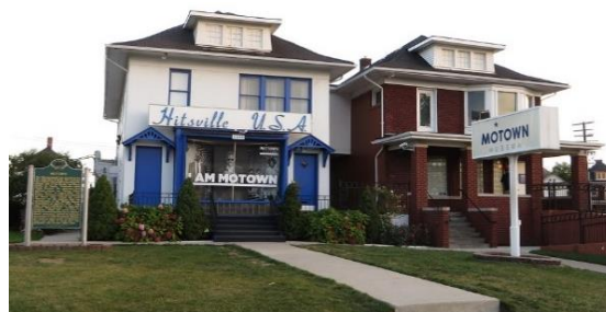
Berry Gordy's "Hitsville USA" Recording Studios building

inclusion in the National Register or nominated as a National Historic Landmark.