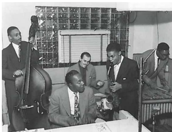
Jazz band performing at the Blue Bird Inn in 1948

While the Blue Bird Inn featured jazz acts throughout the 1940s, in 1948 the club's management decided to specialize in the presentation of bebop jazz. Charlie Parker, the originator of bebop, played at the Blue Bird Inn within a year of its transition. ix Miles Davis, another popular jazz musician, performed there in the 1950s. x