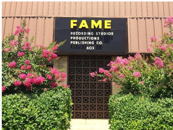
Fame Recording Studios

The Muscle Shoals Sound Studio building on Jackson Highway was listed in the National Register of Historic Places in 2006 at the national level for its contributions to American music history. FAME Studio was also listed in the National Register in 2016 at the national level for its contributions to music history and for its associations with important figures in our nation's past. xxviii Both Muscle Shoals Sound Studio and FAME Studio are privately owned and open to the public for tours.