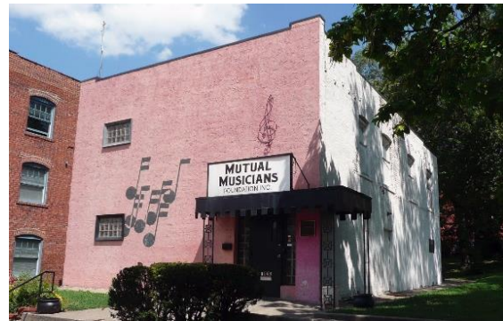
Mutual Musicians Foundation Building

The building was listed on the National Register of Historic Places in 1979 for its association with significant events in American black, social, and performing arts history. xxv The Mutual Musicians' Foundation Building was designated a National Historic Landmark in 1981. It is privately owned and is open to the public for jazz late Friday and Saturday nights.