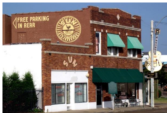
Sun Record Company Studio building

The Sun Record Company Studio was designated a National Historic Landmark in 2003. The building was found to be significant for its association with people and events that contributed to our national history. xxvii It is privately owned and is open to the public for tours.