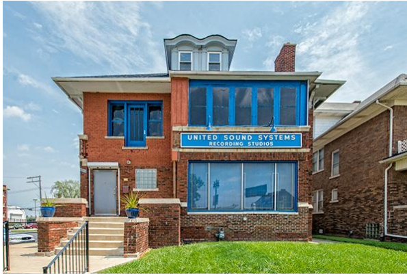
Exterior of United Sound Systems Recording Studios

Tommy Potter, and Max Roach recorded several songs at United Sound for Savoy Records. xvii The following year, John Lee Hooker recorded his hit record, “Boogie Chillen,” at United Sound’s studios. xviii