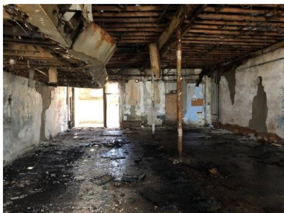
Interior of the Blue Bird Inn

While the national significance of the Blue Bird Inn has yet to be determined, it is evident that the structure's integrity has been compromised. The exterior of the building remains fairly intact: windows and doors have been modified, but the façade retains most of its historic character. Conversely, the interior of the building has fallen into a state of disrepair. The historic stage was recently removed and restored by the Detroit Sound Conservancy and has been featured at several exhibits outside of its original setting.