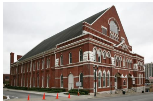
Ryman Auditorium