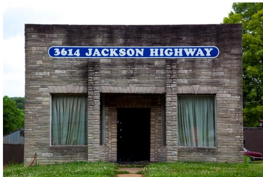
Muscle Shoals Sound Studio building

space in Sheffield, Alabama at 3614 Jackson Highway. The new studio, Muscle Shoals Sound Studio, attracted artists like the Rolling Stones, Aretha Franklin, and Paul Simon. The recording studio was moved to a larger facility in 1979, and the Jackson Highway building has been restored.