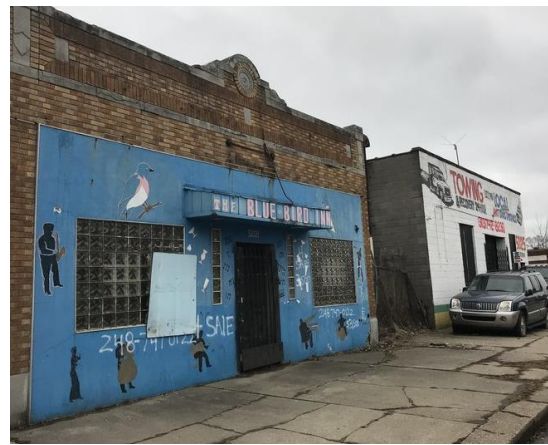
Exterior of the Blue Bird Inn in 2019

Jazz has a multitude of influences from African American folk styles such as blues and ragtime, to European ensemble bands. iv Big band jazz, a style dating to the 1920s and 1930s which combined blues and ensemble traditions into a lively, danceable music form, was one of the first styles of jazz to thrive in Detroit. v The unparalleled success of the automobile industry in the 1920s boosted the city’s economy and increased the demand for recreational facilities such as ballrooms. As a result, big band jazz groups gained popularity and became a vital part of Detroit’s musical scene.