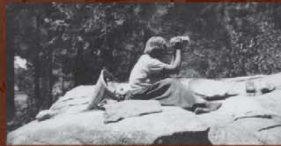
Bedrock mortars, or pounding rocks, are found near here and were used to pound acorns into flour.

Explore this area and follow the footprints of those who came before you. Indian people resided in Big Meadow for thousands of years. The meadow and surrounding forest provided a supermarket of goods integral to survival. Women gathered acorns from oak trees and pounded them into flour for food. Milkweed, deergrass, bracken fern, and other plants abundant in these meadows were used for baskets, medicine, and string.