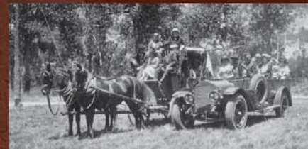
Wagons, stagecoaches, and eventually automobiles transported supplies, mail, and tourists into Yosemite Valley via the Coulterville Road—the unpaved road you now stand upon.

The way of life began to change dramatically in the mid-1800s. By 1874, the Coulterville and Yosemite Turnpike Company completed the first wagon road over rugged terrain into Yosemite Valley. The Coulterville Road provided an important route for commerce and tourism. You now stand on the old roadbed. A stage stop welcomed weary travelers at the Meyer property in front of you.