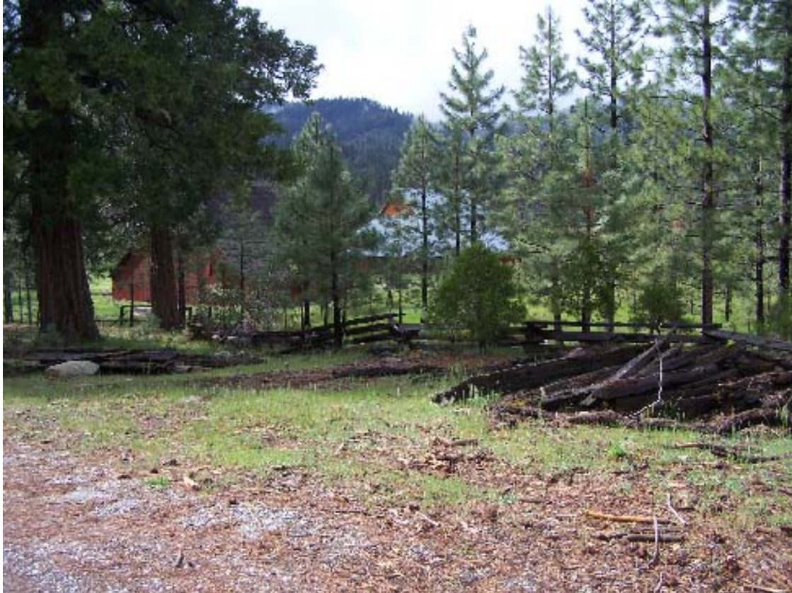
Foresta – Proposed Exhibit Site