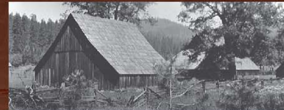
German immigrant George Meyer built these two barns by the early 1880s. In 1996, the National Park Service restored them both.

The oldest historic structures here are the two barns on the edge of Big Meadow. Built largely of native materials in a local style, they feature hand-hewn timbers, peeled logs, fieldstone foundations, and hand-split sugar pine shakes for roofs. You are welcome to walk down the Coulterville Road for a closer exploration of these buildings.