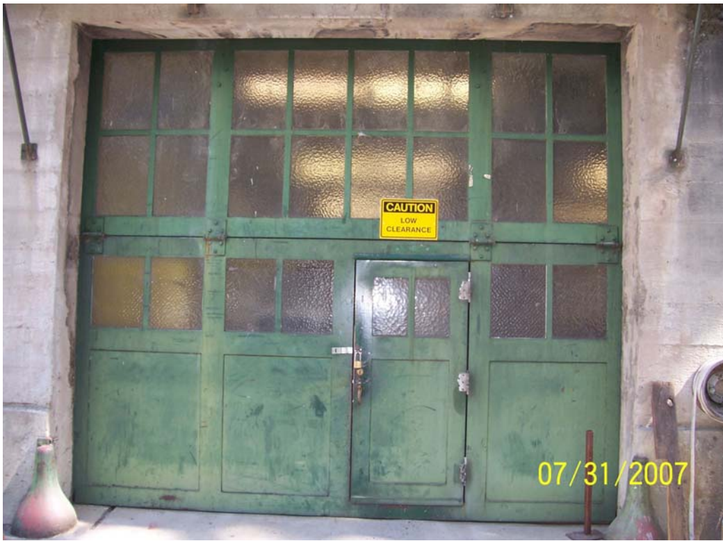
Valley Maintenance Building – Buildings and Grounds