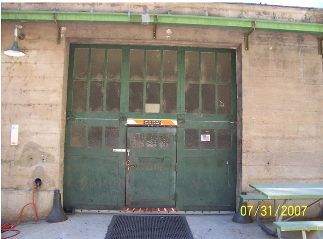
Valley Maintenance Building - Utilities