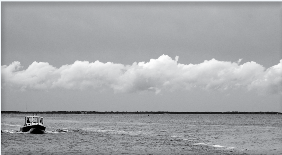
Storm over Fire Island