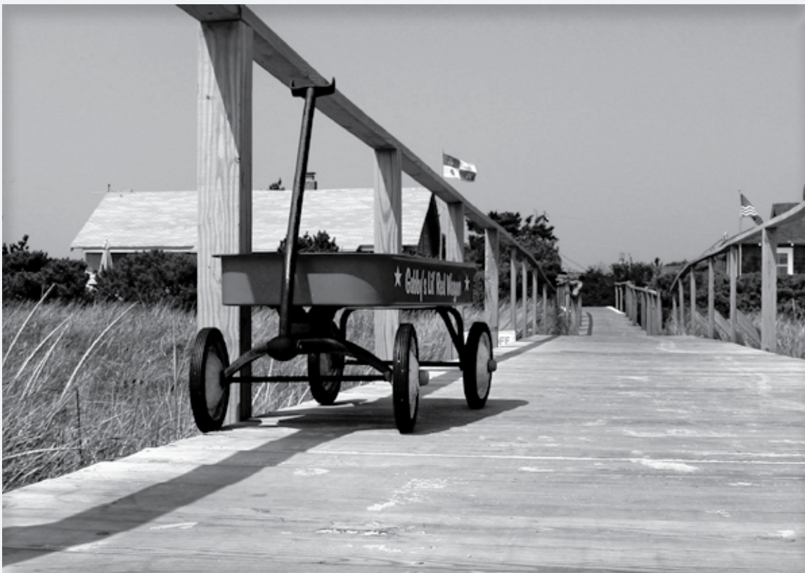
Boardwalk to the beach, Cherry Grove