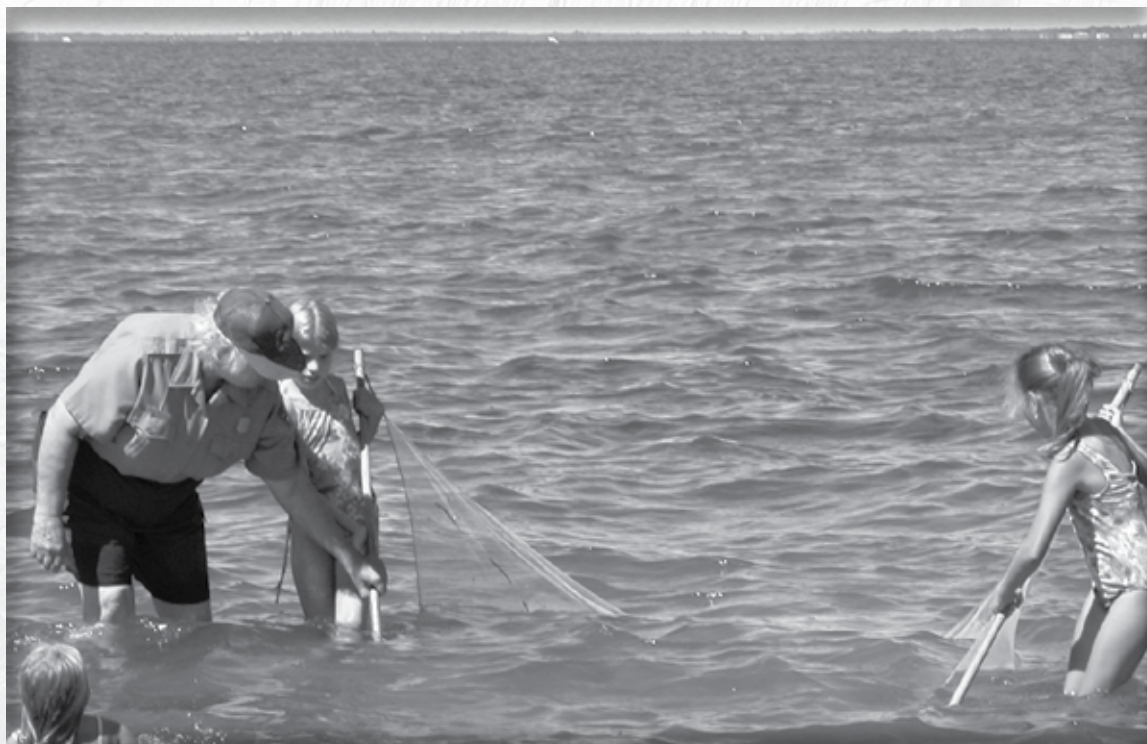
Children seining with a ranger at Watch Hill

Collectively, the island communities, local and county parks, and the national seashore offer a broad range of experiences and services for a diversity of visitors.