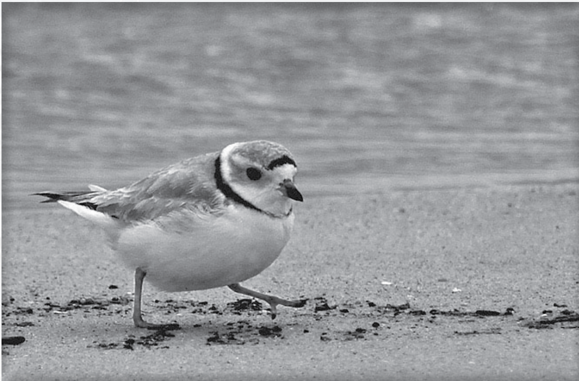
Piping Plover on the beach

Fire Island Light was constructed in 1858 and has served as a critical navigation aid for the port of New York for more than 150 years. An active light has been at this location since 1826.