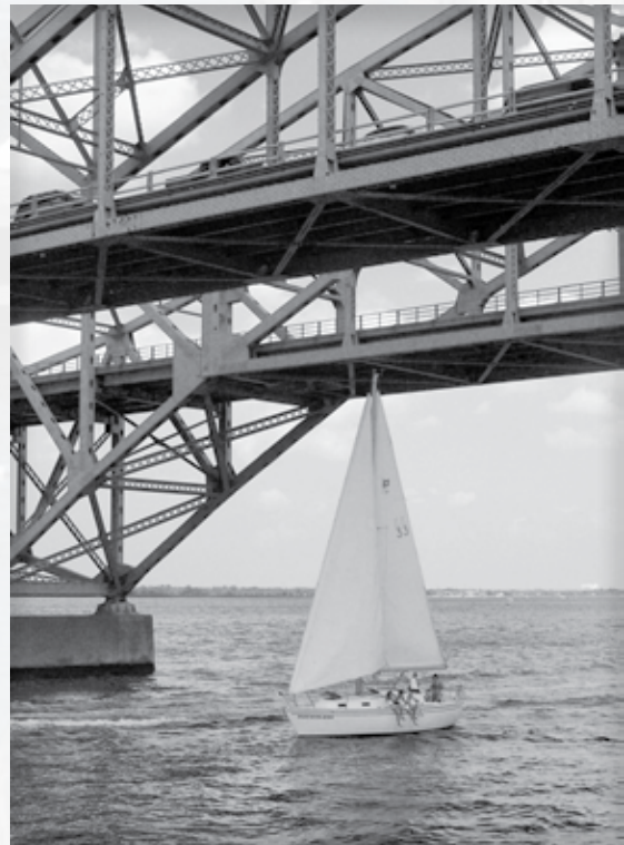
Sailboat passing under Robert Moses Causeway

Fire Island National Seashore preserves the primitive and natural character of the Otis Pike Fire Island High Dune Wilderness and protects its wilderness values of solitude and isolation.