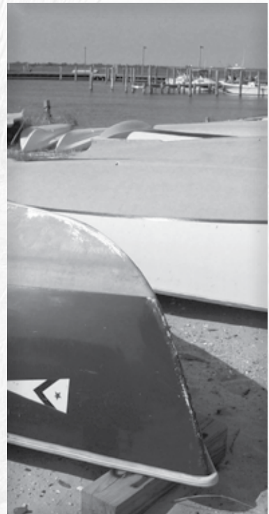
Left: Fire Island preserves miles of undeveloped beach; Center: Old Mastic House at William Floyd Estate; Right: Small boats in Saltaire, one of seventeen pre-existing communities on Fire Island