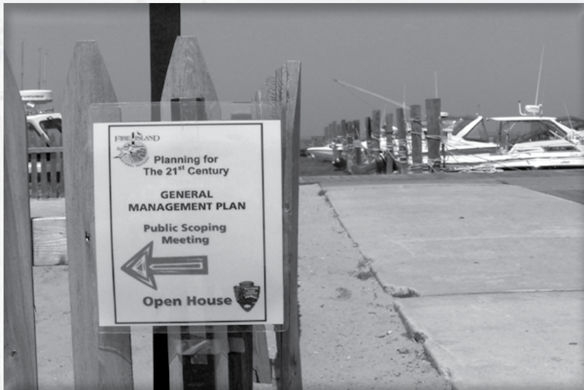
Sign advertising a public scoping meeting at Ocean Beach

The comments that we received relative to resource management were dominated by concerns about coastal erosion, deer, mosquitoes, and invasive species. We also received numerous comments focusing on vehicular access – both for and against – and representing many varying interests including contractors, year round and part-time residents, and recreational drivers. Access to beaches for disabled visitors was also highlighted as a concern. Another issue noted was the scale and quality of development within the communities. Numerous comments were also received related to planning for the Wilderness Area. Proponents of the Wilderness Area supported the concept of updating the Wilderness Plan but raised concerns that it might not be treated holistically.