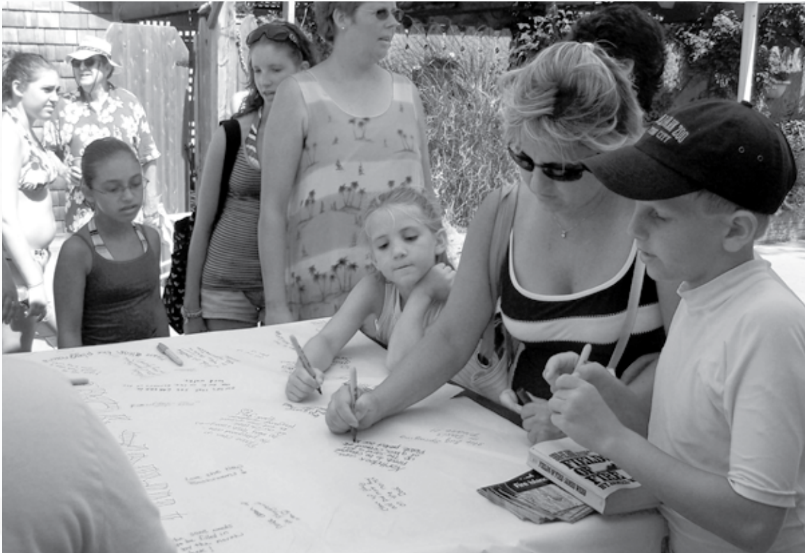
Visitors to Fire Island provide input at a scoping meeting in Davis Park

Not surprisingly, certain topics took considerable precedent over others, depending on the location of the meeting. For instance, at Sailors Haven and Watch Hill, the vast majority of comments focused on the operation and condition of the marinas and associated facilities (e.g. showers). At Lighthouse Beach, a substantial number of people turned out in support of continued clothing optional use of the beach in that area.