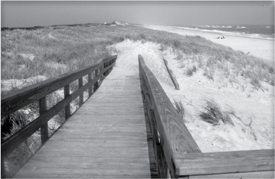
Dune growing at Sailors Haven