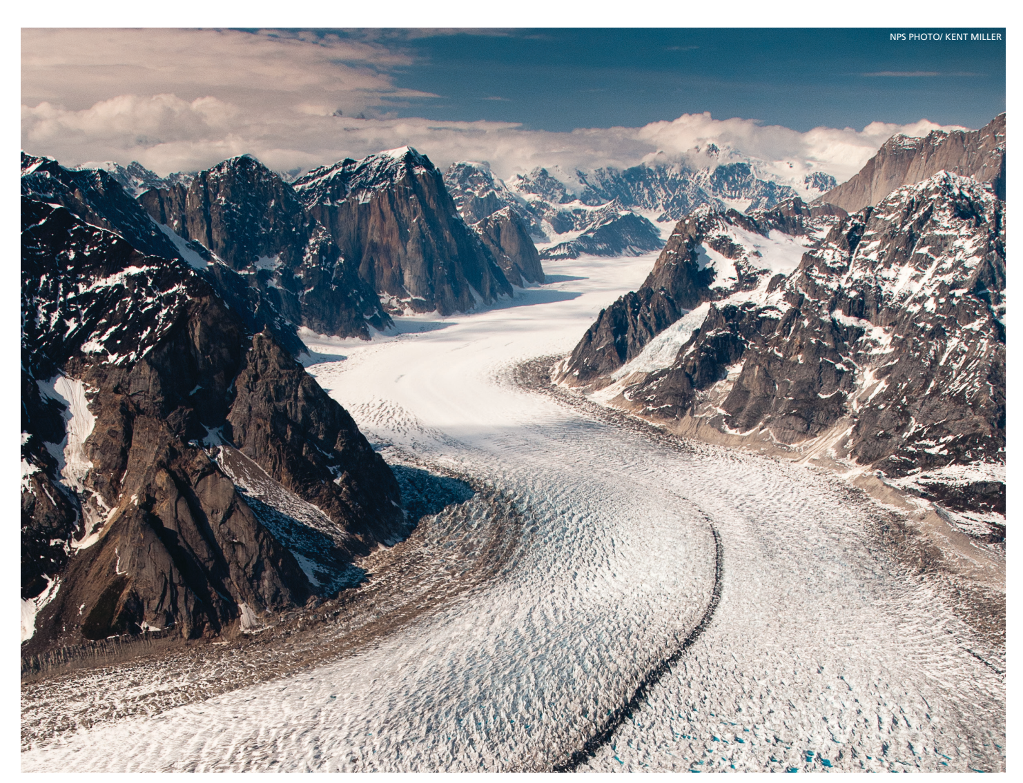
Caption: The Denali Wilderness provides some of the best habitat for glaciers because its high mountains are a cold and snowy refuge.

Installations such as telecommunications equipment, weather stations, research stations and radio collars exist on Denali's landscape with increased frequency. Managers are faced with the challenge of balancing their desire to answer scientific questions about the Denali Wilderness with their mandate of preserving its wilderness character and its wildness. Increasing technological dependence and growing visitation could drive requests for more development and infrastructure within the Denali Wilderness.