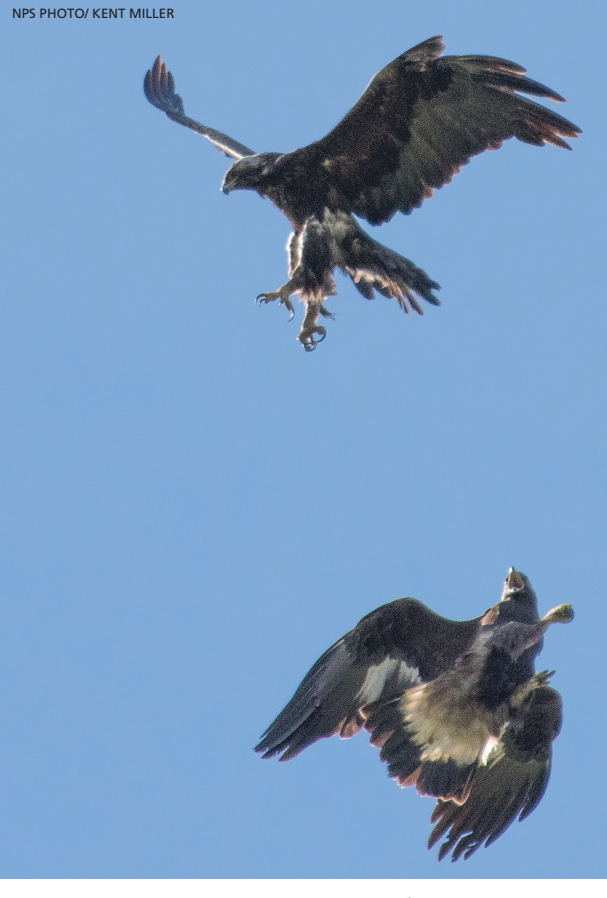
Caption: Denali provides habitat for a long-distance migrant population of golden eagles.

habitat in high, rocky cliffs and will often take each other's nests. Far below, in the vast boreal wetlands of the western portion of Denali, multitudes of waterfowl congregate and nest. Thousands of Sand hill cranes squawk and forage. Trumpeter swans – the heaviest North American bird – float and roost. And tundra swans were recently documented nesting in Denali for the first time. This wild array of avifauna has garnered Denali recognition as a globally significant Important Bird Area by Birdlife International and Audubon.