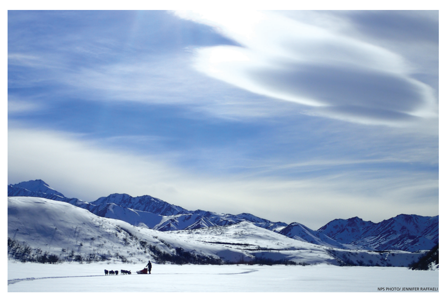
Caption: Denali's historical connections continue on into the present with the use of dogteams for winter travel.

place names such as the Kichatna (K'its'atnu), Yentna (Yentnu), Kahiltna (Kagheltnu), Kanikula (K'enik'ela) and Tokositna (Tuqashitnu).