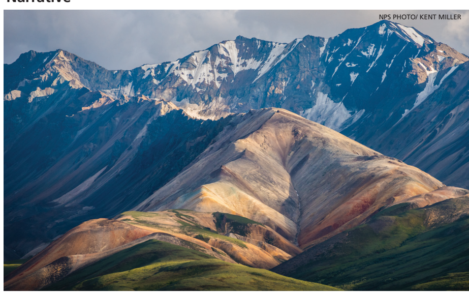
Caption: Denali's geography encompasses a diversity of terrains and microclimates described by physiography, soils and vegetation.