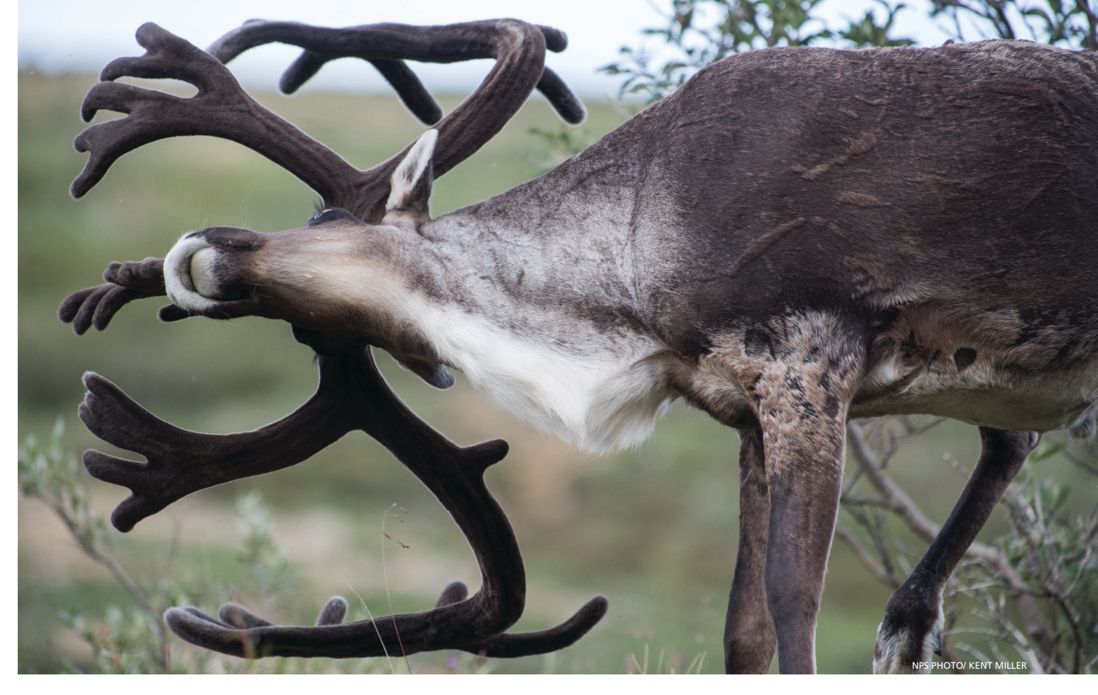
Caption: The Denali Caribou Herd inhabits most of the park east of the Foraker River and north of the Alaska Range throughout most of the year. Currently, there are approximately 1,760 caribou in Denali.

between. Coats of mammals, growth of antlers and flows of hormones all respond to day length or the cycles of cold and warmth.