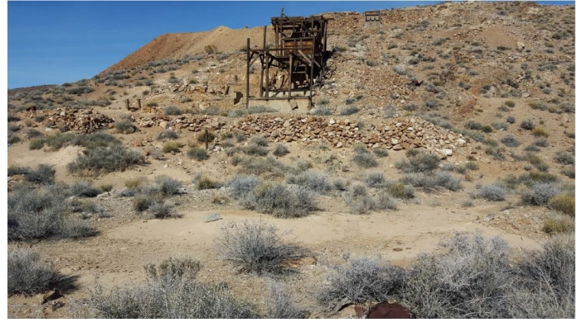
Figure 1 - View of the Cashier Mill looking northeast.

The National Park Service (NPS) is investigating the abandoned Cashier Mill Site (Site) in Death Valley National Park to evaluate cleanup options. The Site consists of the remains of former gold processing mill operations (Figure 1). Gold ore supplying the mill was taken from the nearby Cashier and Eureka Mines. Pink sandsize tailings are present in the vicinity of the mill foundation where cyanide and mercury processing took place. A separate tailing deposit is present upslope of the mill site. Access to the Site is via Emigrant Canyon Road (Figure 2).