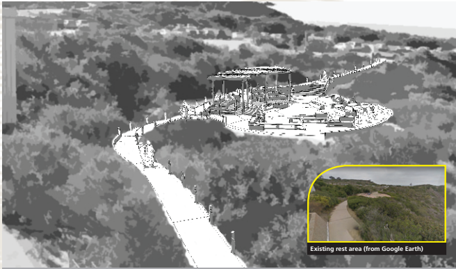
Proposed improvements. View is from the visitor center towards the parking lot (south).