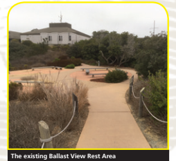
The existing Ballast View Rest Area

The National Park Service is consulting with partners and regulatory agencies to ensure compliance with Section 106 of the National Historic Preservation Act and the Endangered Species Act.