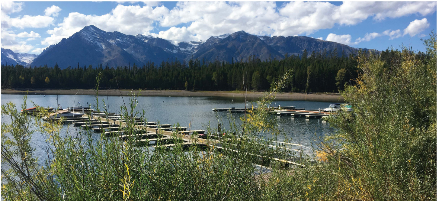
Accessibility improvements for persons with disabilities would be installed for the parking area, access routes, gangways to the dock and tour boats, and restroom at Colter Bay Marina

conduct business with the NPS through a concessions contract. Under the existing contract, Grand Teton Lodge Company provides a wide range of visitor services such as lodging, food and beverage services, retail, marina operations, campgrounds, guided horseback rides, guided fishing trips, and guided float trips at several locations in the park. The operating season is generally May 15 through October 15. The concession contract will expire on December 31, 2021.