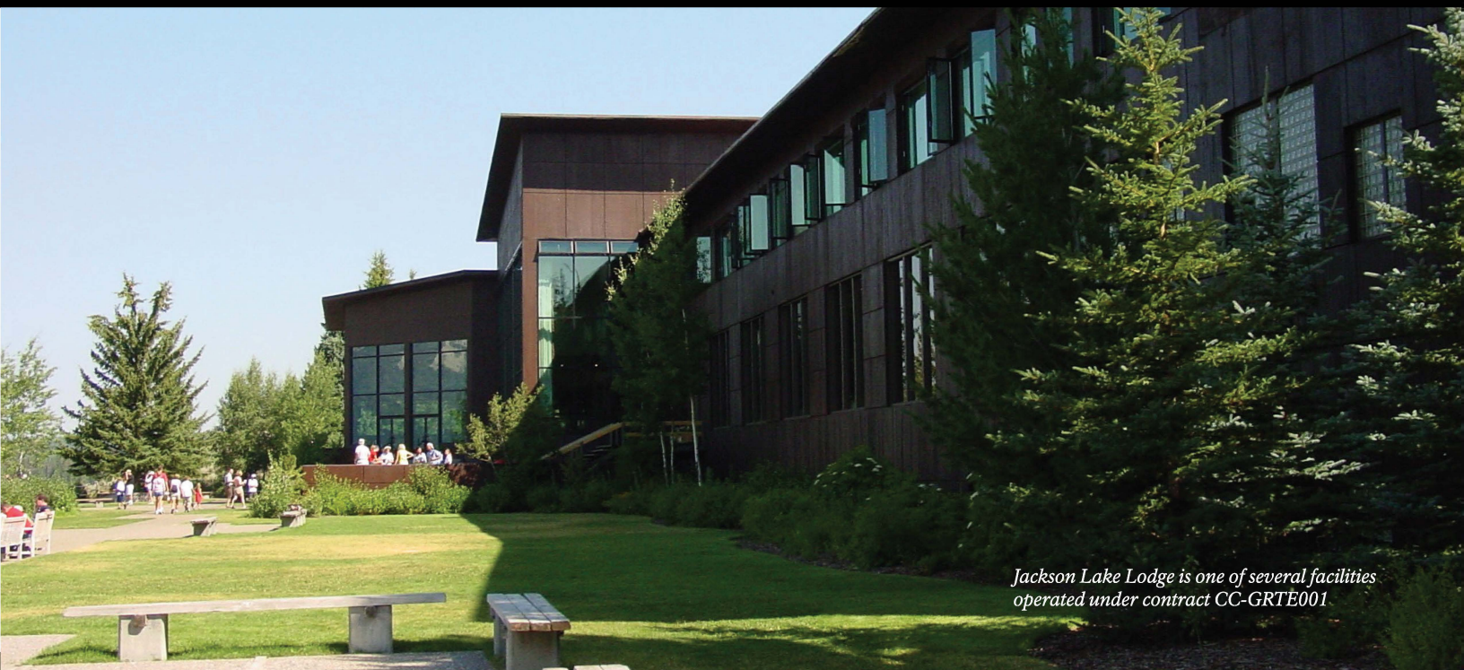
Jackson Lake Lodge is one of several facilities operated under contract CC-GRTE001