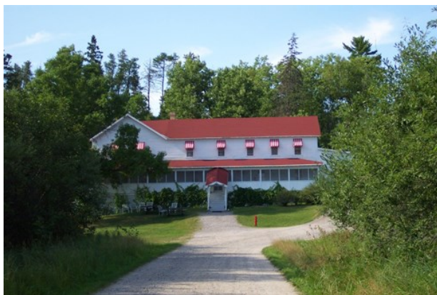
The Kettle Falls Hotel.

Kettle Falls is located at the end of the Kabetogama Peninsula. The area has been used by various peoples throughout history. Native Americans once gathered and hunted at the falls, voyageurs paddled and portaged through the area with their goods and furs, and prospectors stopped at the falls on their way to gold mines at Rainy Lake.