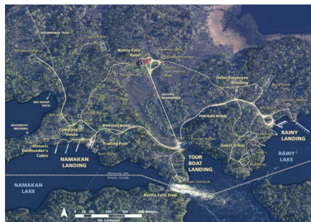
Map of Kettle Falls area.

Today, Kettle Falls is a popular destination for tourists in Voyageurs National Park and has several docks, scenic trails, and lodging options. The Kettle Falls Hotel and adjacent villas operate from late May through mid-September, and are the only lodging available in Voyageurs National Park. Most of the Kettle Falls area does not meet universal accessibility standards and some structures in the area are in need of improvements.