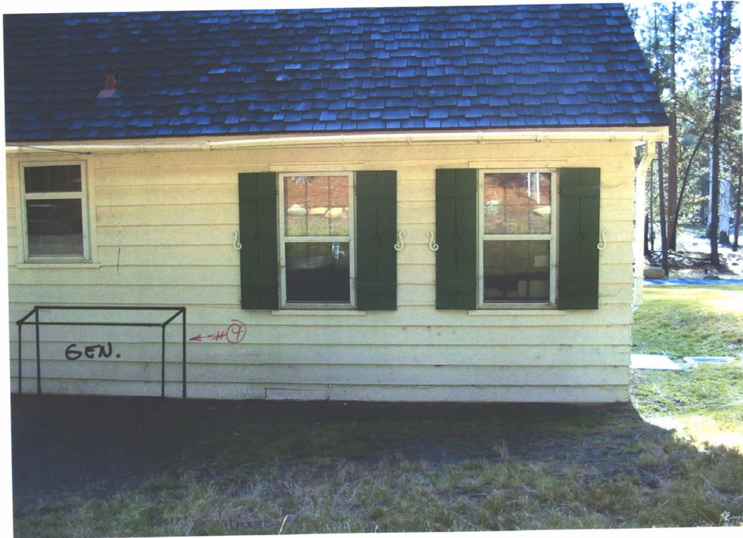
Proposed Generator Location