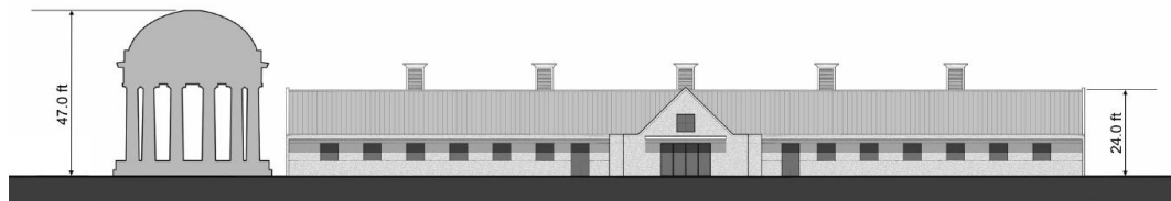
DC WAR MEMORIAL