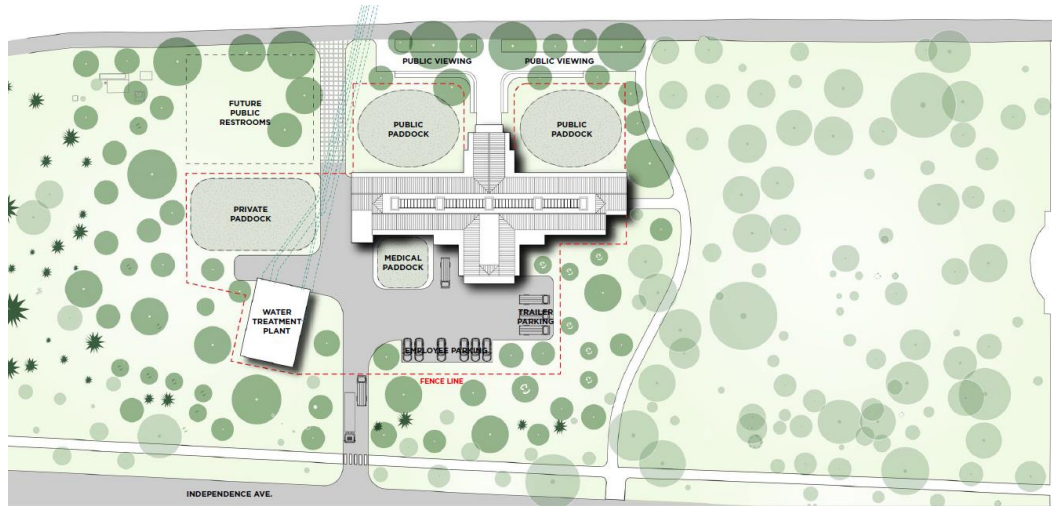
OPTION 1 - SYMMETRICAL BUILDING