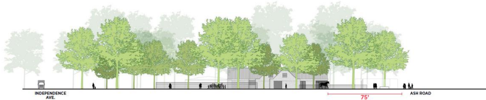
OPTION 1 - SYMMETRICAL BUILDING - ELEVATION FROM DC WAR MEMORIAL