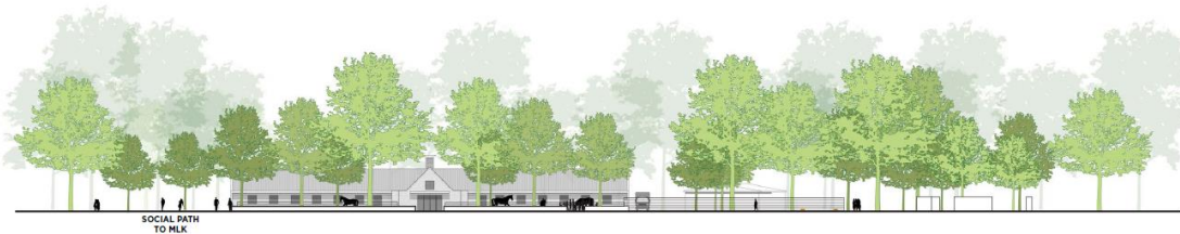
OPTION 1 - SYMMETRICAL BUILDING - ELEVATION FROM ASH ROAD