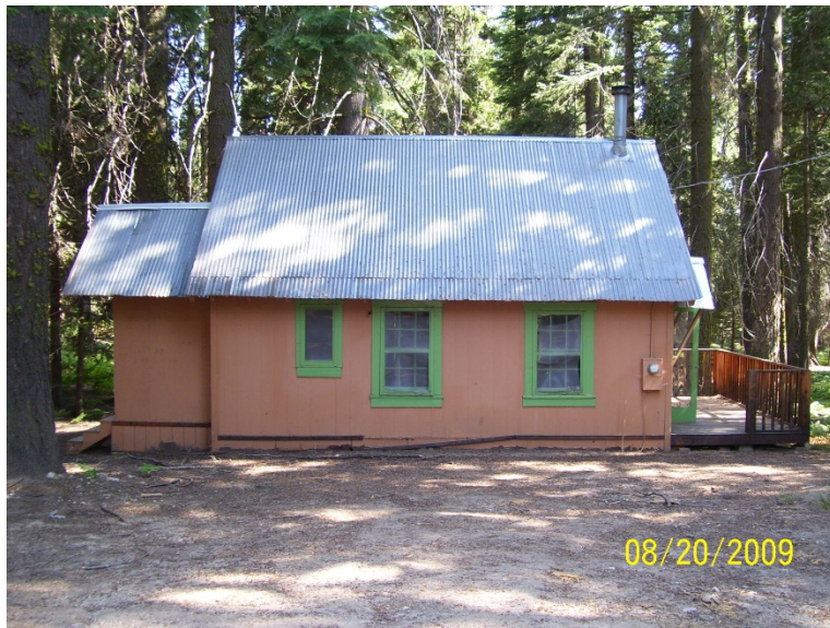
83692 Fir (Postmasters House) and House next door