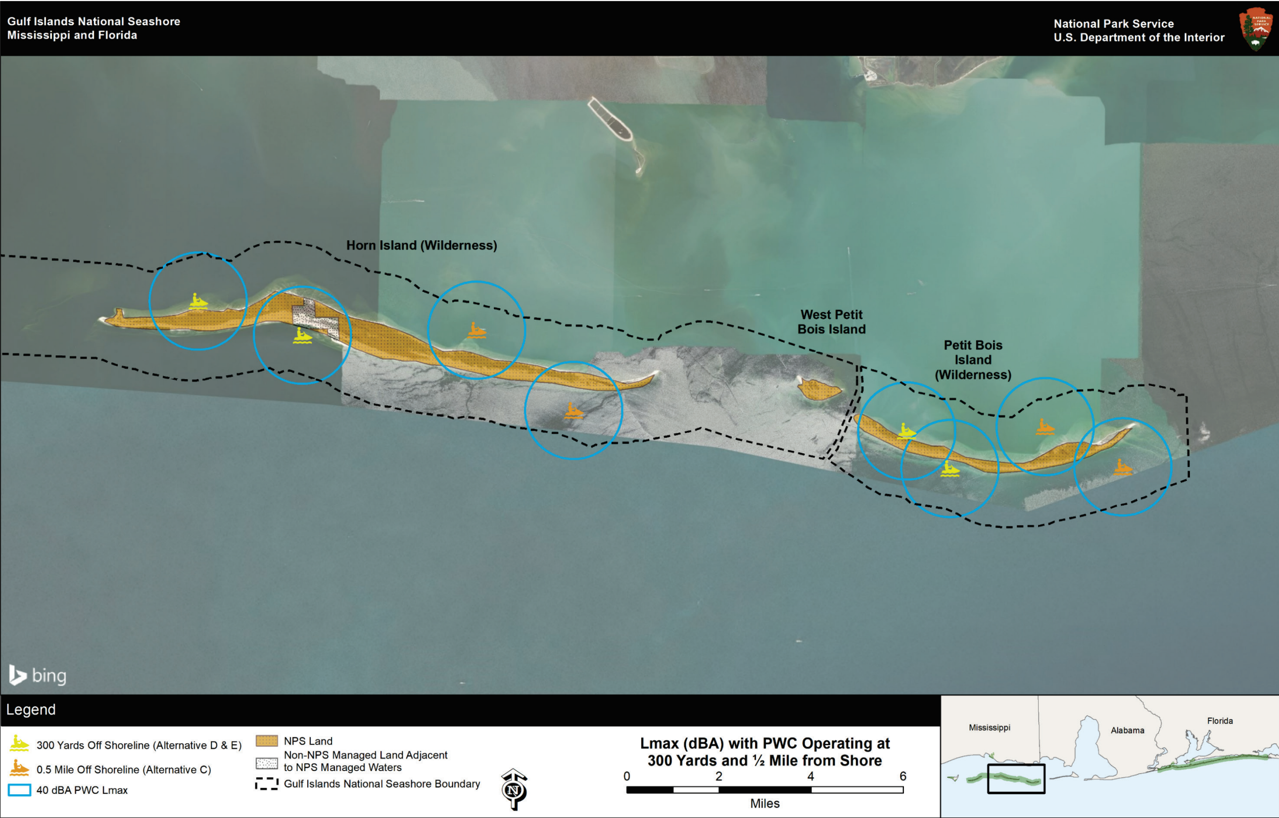
FIGURE D-40. L MAX (dBA) WITH PERSONAL WATERCRAFT OPERATING AT 300 YARDS AND 0.5 MILE FROM HORN AND PETIT BOIS ISLANDS