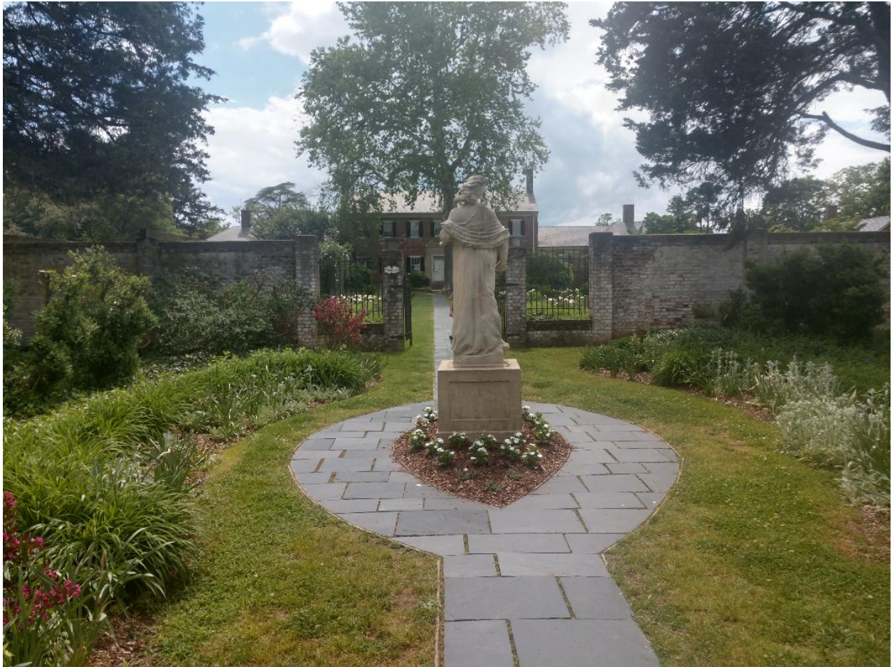
Ceres statue, facing West. - 2019