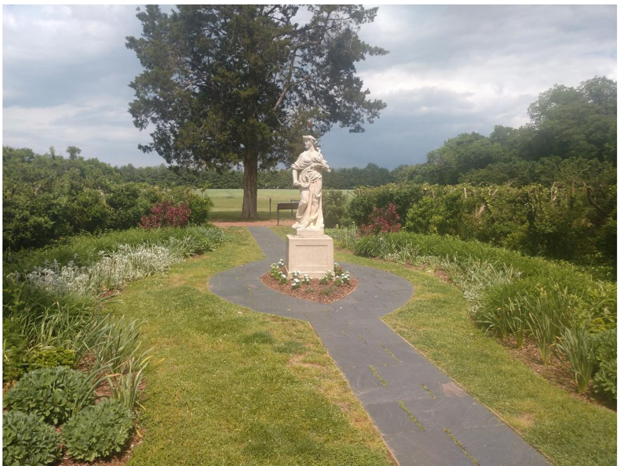
Ceres Statue occupying the location where Diana will be installed. The reinstalled statue will be very close to the public walkway. The proposal calls for widening the circle around the plinth to an 11 foot diameter. Facing East - 2019