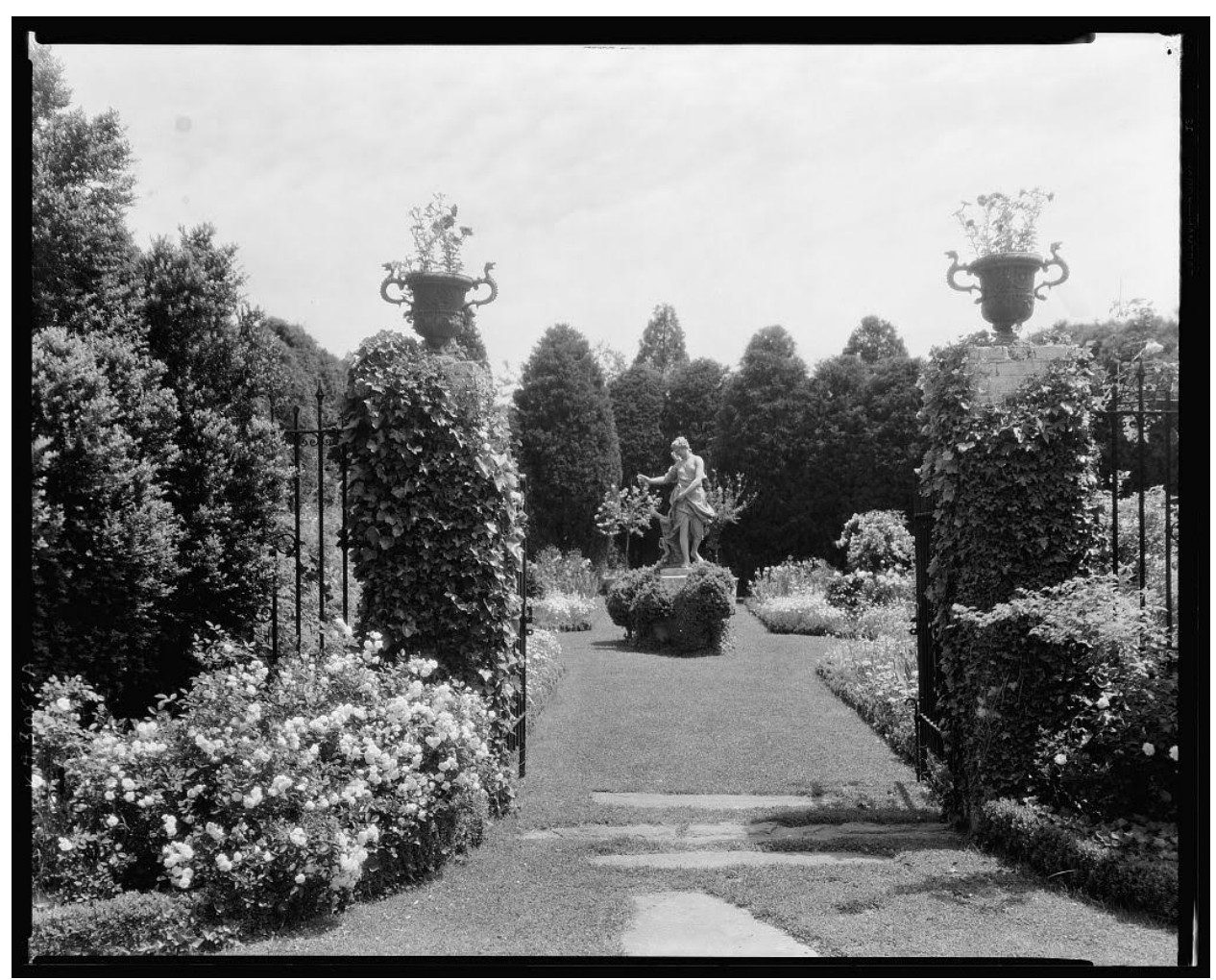
1920s view looking east, showing Diana's original location with vegetation around the plinth and a circular space surrounding it - 1927