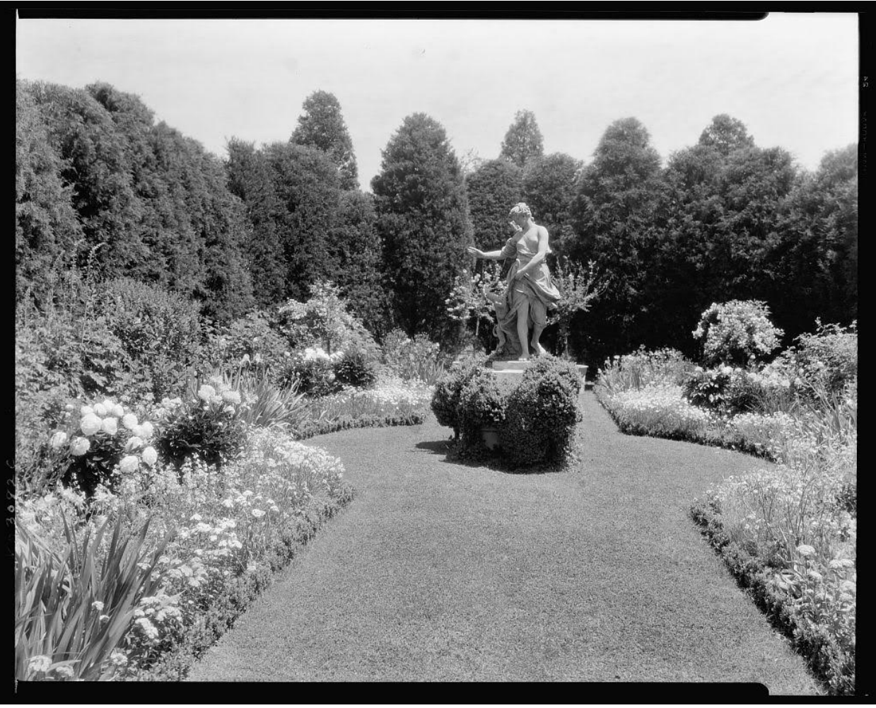
Diana statue looking east, with circular walkway defined by plantings - 1927