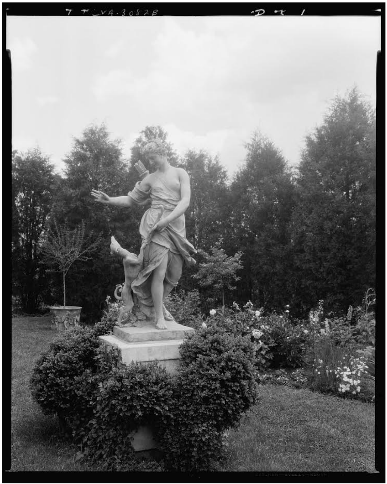
Closeup view of Diana with vegetation around the plinth - 1927