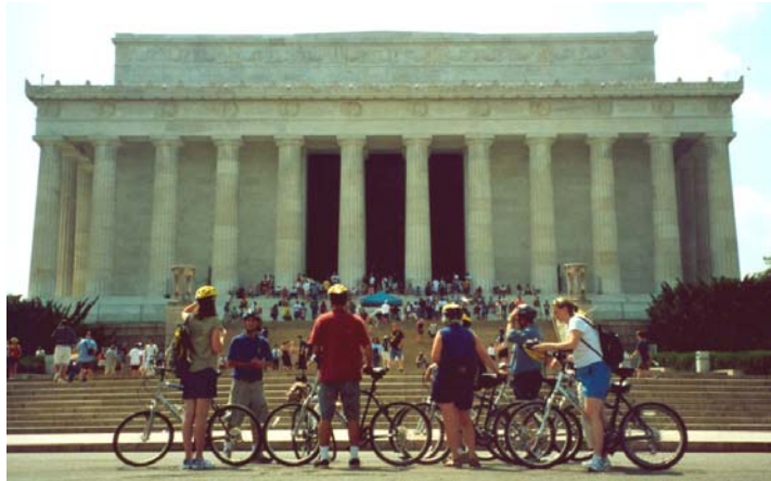
Bike the Sites stopped at the Lincoln Memorial.

Estimated Ridership: 140 visitors/month peak season