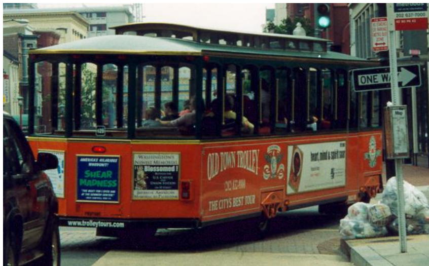
Old Town Trolley touring near the Convention Center.

Vehicle Characteristics: Trolley cars with one entrance point at front of the car. Most trolley cars equipped with wheelchair lifts, including all new trolleys. Handicapped riders suggested to make reservations in advance for best service. Seats are wooden benches. Vehicle is open to the air in summer season, but can be enclosed and heated. Nearly all of the trolley vehicles run on propane, and Historic Tours of America maintains its own fueling station. Trolley fleet does not include low-floor or kneeling vehicles.