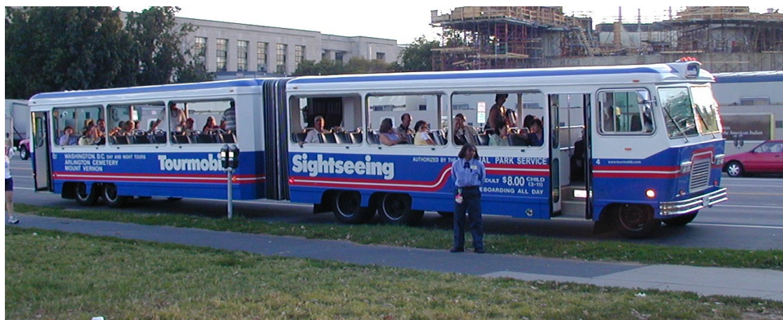
Tourmobile articulated tram stopped along the National Mall.

Note: sensitive operating data has been removed from this report, specifically ridership and cost related operating figures.