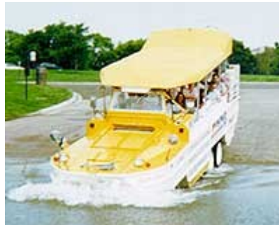
DC Duck entering the water at Gravelly Point.

Description: Seasonal tour only, running from mid-March to November. Union Station is the departure and return point for the tour. Gravelly Point, adjacent to Reagan National Airport, is the entrance/exit point for the tour into the Potomac River. Approximately 20 - 25 minutes of the tour is in the Potomac River, including only a short circle around the river adjacent to the airport. Presence of full truck, including wheels, contributes to low vehicle speed in the water, and resulting in a short water tour only.