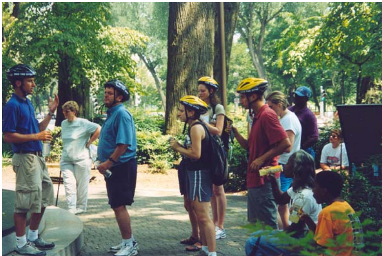
Bike the Sites tour stopped at the Albert Einstein Memorial.

Tour also includes complimentary snack and bottle of water along with bicycle and helmet rental. Energy bar snack is distributed by guide mid-way through the tour, and the bottle of water also includes a coupon to area partner restaurants and vendors.