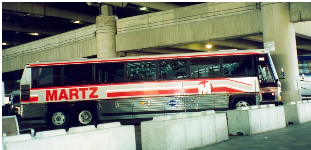
Gray Line / Martz motorcoach parked at the Union Station terminal.

Description: This tour makes limited stops at Christ Church and Mount Vernon Estate and Gardens; all other sites are viewed from the motorcoach.