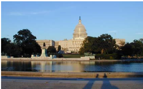
Area Destinations: U.S. Capitol Building and the USMC War Memorial (Iwo Jima)

This data base includes all major Washington, DC area destinations, as well as many more specialized destinations such as, religious institutions and national associations. Included for each destination is address, owner/operator, general proximity to Metrorail transit, service by regularly scheduled tour, and web address where available. This data base is provided for project planning and market overview purposes. The data base includes 170 different visitor destinations in the Washington, DC area.