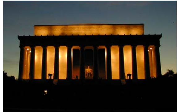
Lincoln Memorial as seen on the Tourmobile Washington By Night tour

Guide/Interpretation Type: Dedicated guide. Tourmobile provides interpretive presentations on area memorials and sites, including design significance of memorials, statues and architecture, institutional histories and interpretation of historical sites.