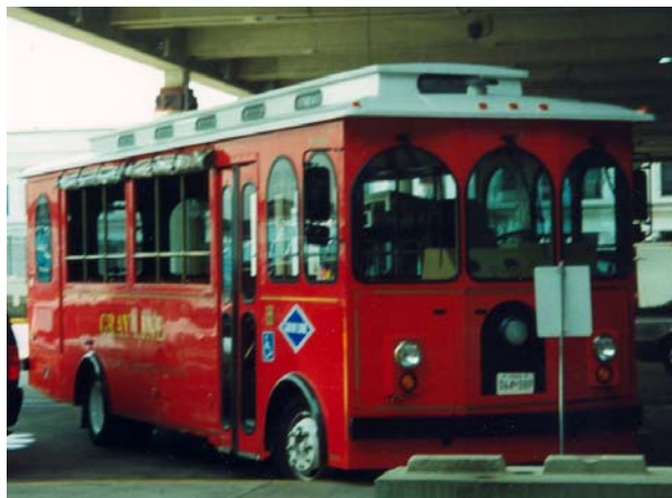
L'il Red Trolley parked at the Gray Line Terminal at Union Station.

Vehicle Characteristics: Trolley vehicles with accommodation for handicapped patrons in rear of vehicle. Driver's seat obscures views on left-hand side of vehicle somewhat. Trolley vehicles are not low-floor or kneeling vehicles. Open to the air, except during inclement weather. Vehicles have wooden benches.