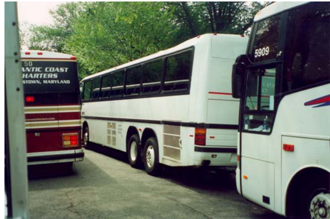
Motorcoaches Stacked-up at the Lincoln Memorial

As previously noted there is no documented count of the number of motorcoach tours operating in the Washington, DC area; however, industry data indicates a possible national market of more than 2,300 operators who may be serving the Washington, DC area for a variety of regularly scheduled and charter tours. Given the Washington, DC area's popularity as a destination, it is likely that the region captures a large portion of this possible market. The dominant presence of motorcoaches providing service to the Washington, DC area is clearly visible in the Memorial Core, at Arlington Cemetery and other area destinations. This tour market is also discussed in Appendix A of this report.