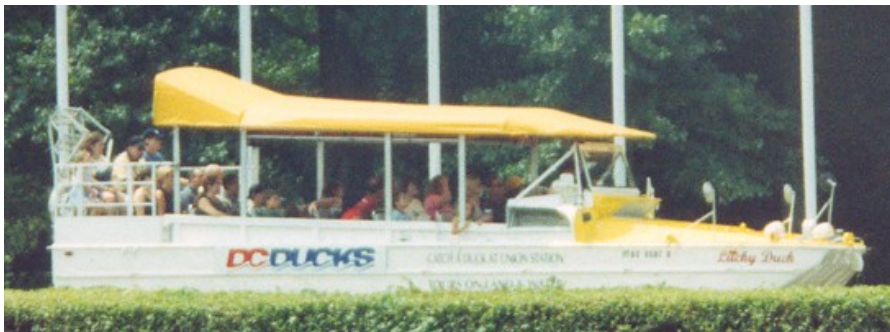
DC Duck tour leaving Union Station.

Vehicle Characteristics: Original World War II amphibious land vehicle/water craft, called DUKWs. Vehicles not handicapped accessible. Vehicles are open air and not enclosable. Top nautical speed is estimated 5 knots/hour. Vehicles are valued at roughly $160, 000, and gasoline fueled.