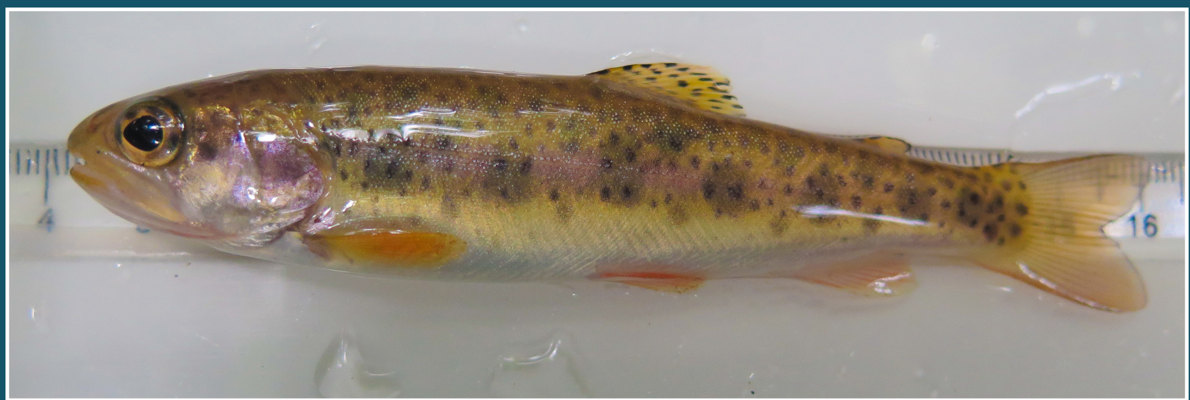
May Creek Juvenile Coastal Cutthroat Trout