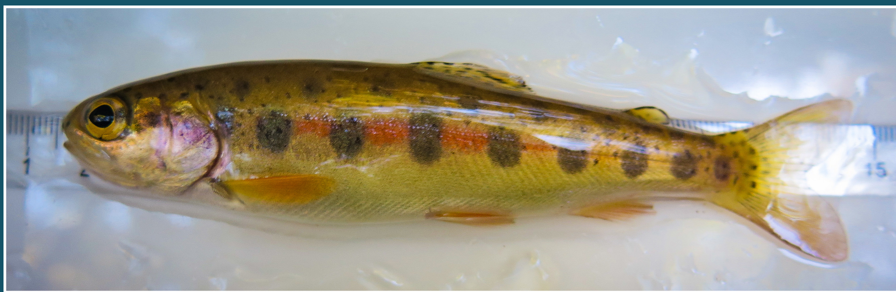
Prairie Creek Watershed Juvenile Steelhead Trout

The Proposed Action involves placement of large wood in streams, planting trees in the riparian corridor and around wetlands, and treatment of a planted alder forest (Davison Riparian Mitigation Site) along mainstem Prairie, Strelow, and May creeks.