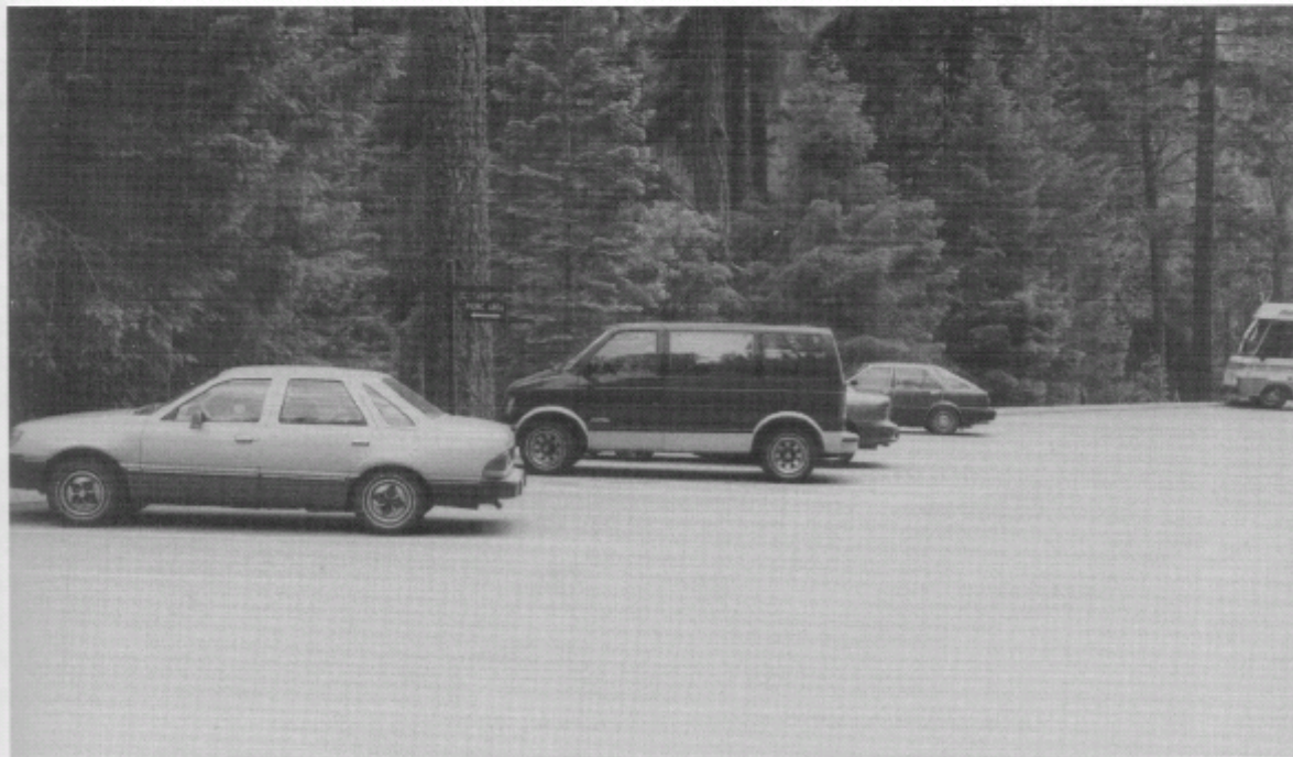
Pedestrian access for picnic area and No Name Trail will be improved