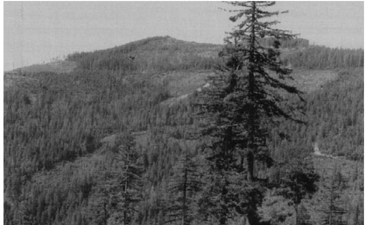
Public forest lands between Buck Peak summit and the Monument will be added

Lands to be added include managed LSR lands of the upper watersheds of Cave and Lake Creeks and portions of the lower watershed for Lake Creek adjacent to Oregon Caves National Monument. This includes Meadow Mountain Trail, and Lake Mountain Trail, portions of the Mt. Elijah, Limestone, and Cave Creek trails, the remaining sections of No Name, and Big Tree trails, and the Bigelow Lakes. There are also two small matrix sections included on Buck Peak, approximately