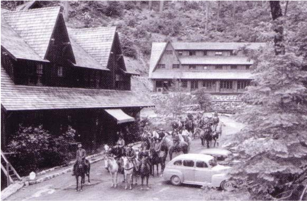
This historic photo shows the Oregon Caves Chateau pictured on the left and the Chalet at center.