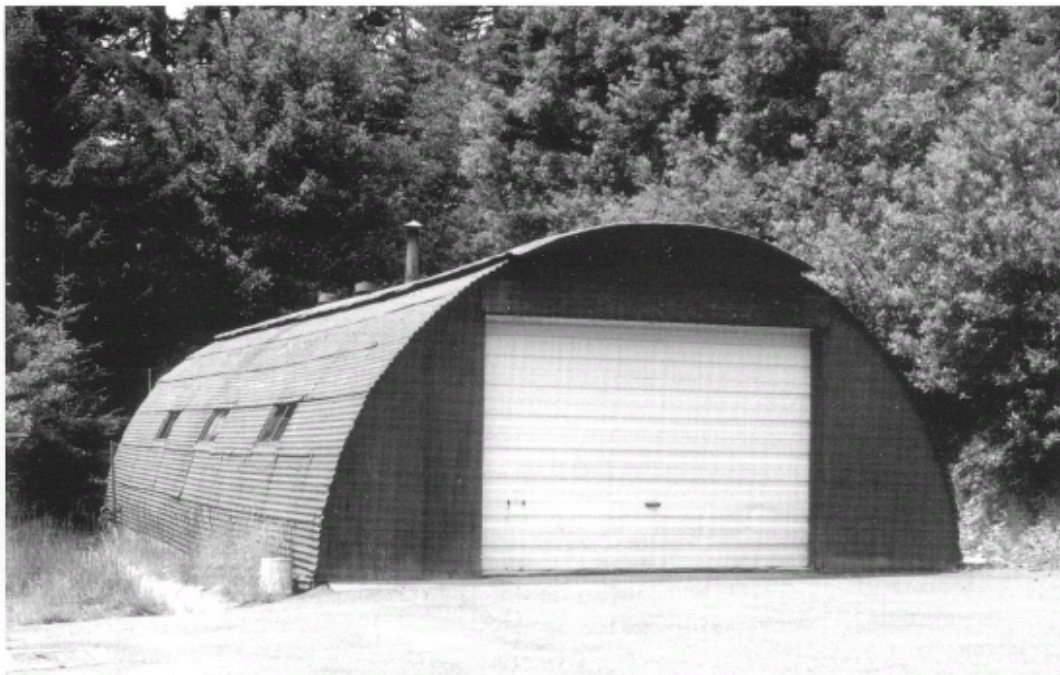
Collection storage in quonset hut will be replaced by a new structure at the administrative site