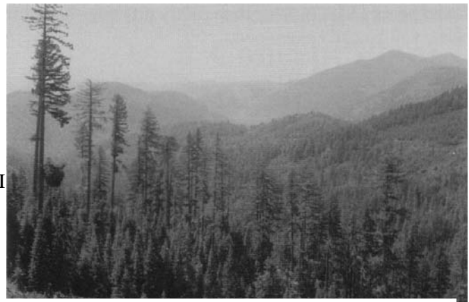
Foreground and much of the middleground views within the Lake Creek watershed will be added to the Monument

(extending up to four miles) into the forest canopy and ridgetops as seen from the Monument's most important viewpoints including the National Register historic district and adjacent trails.