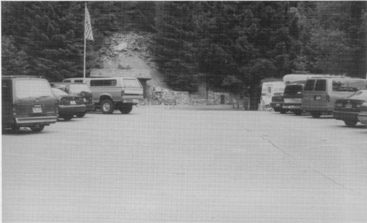
Main parking lot will be reconfigured