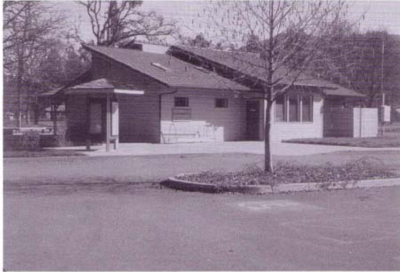
Expanded IVVC will allow for enhanced exhibit and information space

The Monument currently does not have a formal, designated interpretive program site in the historic plaza between the Chateau and the Chalet. Efforts will be made to select an adequate site or sites for these activities.