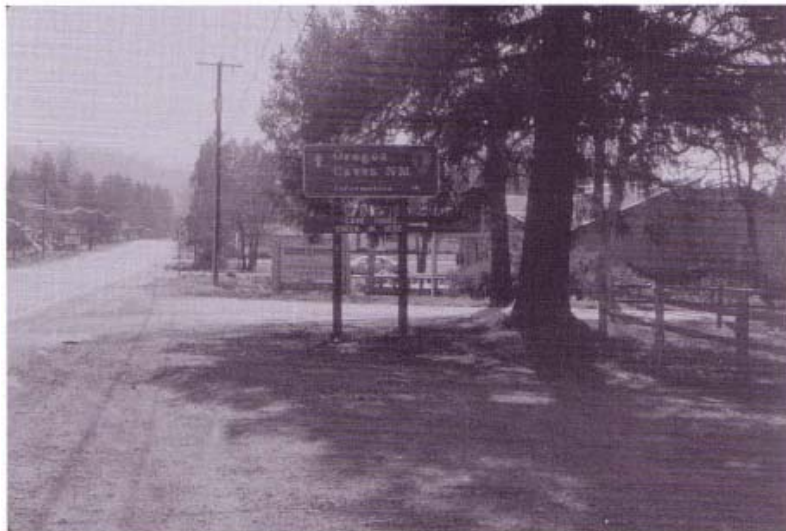
Improved signing will direct visitors to the IVVC for cave tour reservations and general information about the area