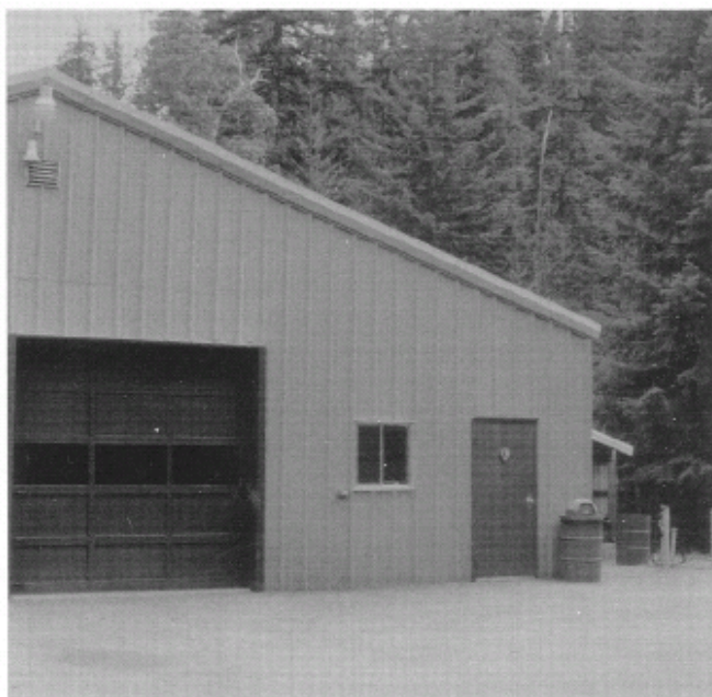
A bay will be added to the garage area to house the fire truck, and the maintenance yard area will be reconfigured