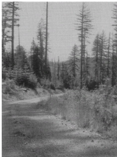
A portion of USFS Road 960 is within the proposed Monument expansion and will remain open to public use

The NPS will maintain roads within the expanded Monument. This will include current USFS Road 960 for fire access, as well as to allow public access to and from the Town of Williams and access to USFS Road 4611/070. Through an interagency agreement, the USFS will be requested to continue maintenance of a short section of USFS Road 4612/13 through the expanded Monument, which will remain open for public access and use. The USFS Road 070 spur into the upper watershed of Lake Creek will be closed at the intersection of USFS Road 079 and 070 to vehicular use to protect the upper Lake Creek drainage and Bigelow Lakes. Hiking and horse trails will allow for continued visitor access into this area.