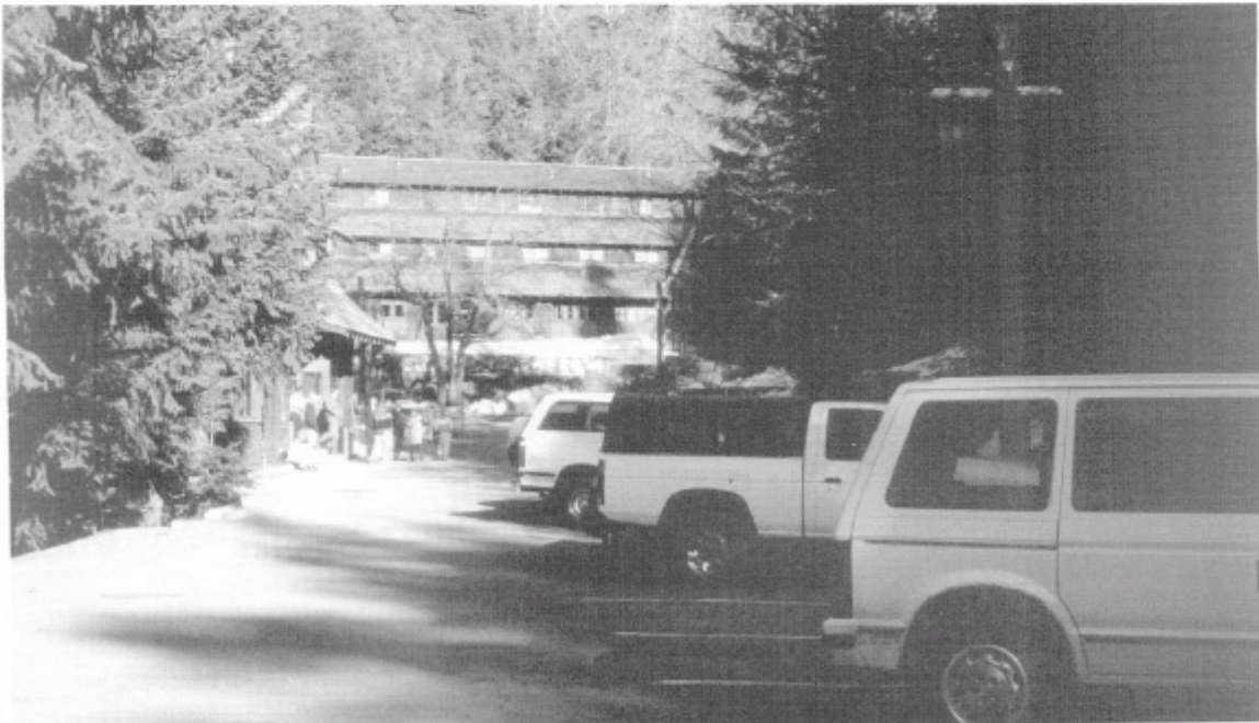
Upper parking lot will be reconfigured for lodge patrons and employees