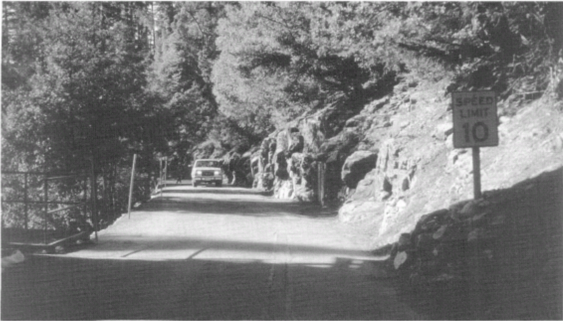
Traffic management techniques will be used to reduce pedestrian-vehicle conflicts