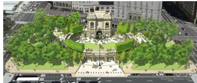
Figure 4: Grotto of Remembrance

The Grotto of Remembrance alternative would create a neoclassical commemorative ellipse at the center of the site ( Figure 4 ). Three entrance plazas would surround the east, west, and south edges of the ellipse. A granite tower with an arched grotto and reflecting pool with an eternal flame at its base would be located at the north edge of the ellipse. This alternative would alter the site in a way that would threaten Pershing Park's NRHP eligibility and would not provide the desired experience or program. Therefore, this alternative was dismissed from further consideration.