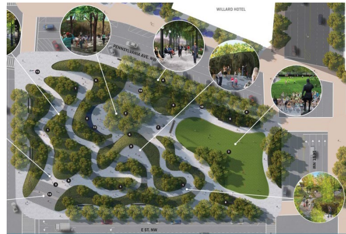
Figure 2: Heroes' Green

The Heroes' Green alternative would create meandering paths through landforms across the site creating several elevation changes, embed five surface walls with historic imagery in the landforms, add an open lawn and plaza, and create a memorial tree garden composed of 116 trees ( Figure 2 ). The alternative raised security and surveillance concerns, would alter the site in a way that would threaten Pershing Park's NRHP eligibility, and would not provide the desired experience or program. Therefore, this alternative was dismissed from further consideration.