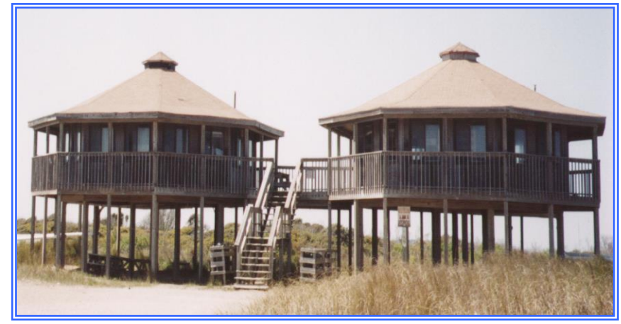
Long Point Octagon Cabins (2 units per building)

There are twenty (20) duplex units each with a sleeping capacity of six (6). Each unit has electricity, a water heater, individual propane heating system, light fixtures, a combination sleeping/eating area with ceiling fans, table, chairs, and kitchen with cabinets, oven/stove combination, and a private bath. Units three through eight have air conditioning units. Each unit is approximately 500 sq. ft. Ice and gasoline are available for purchase at the cabin office on the island. Credit cards are preferred.