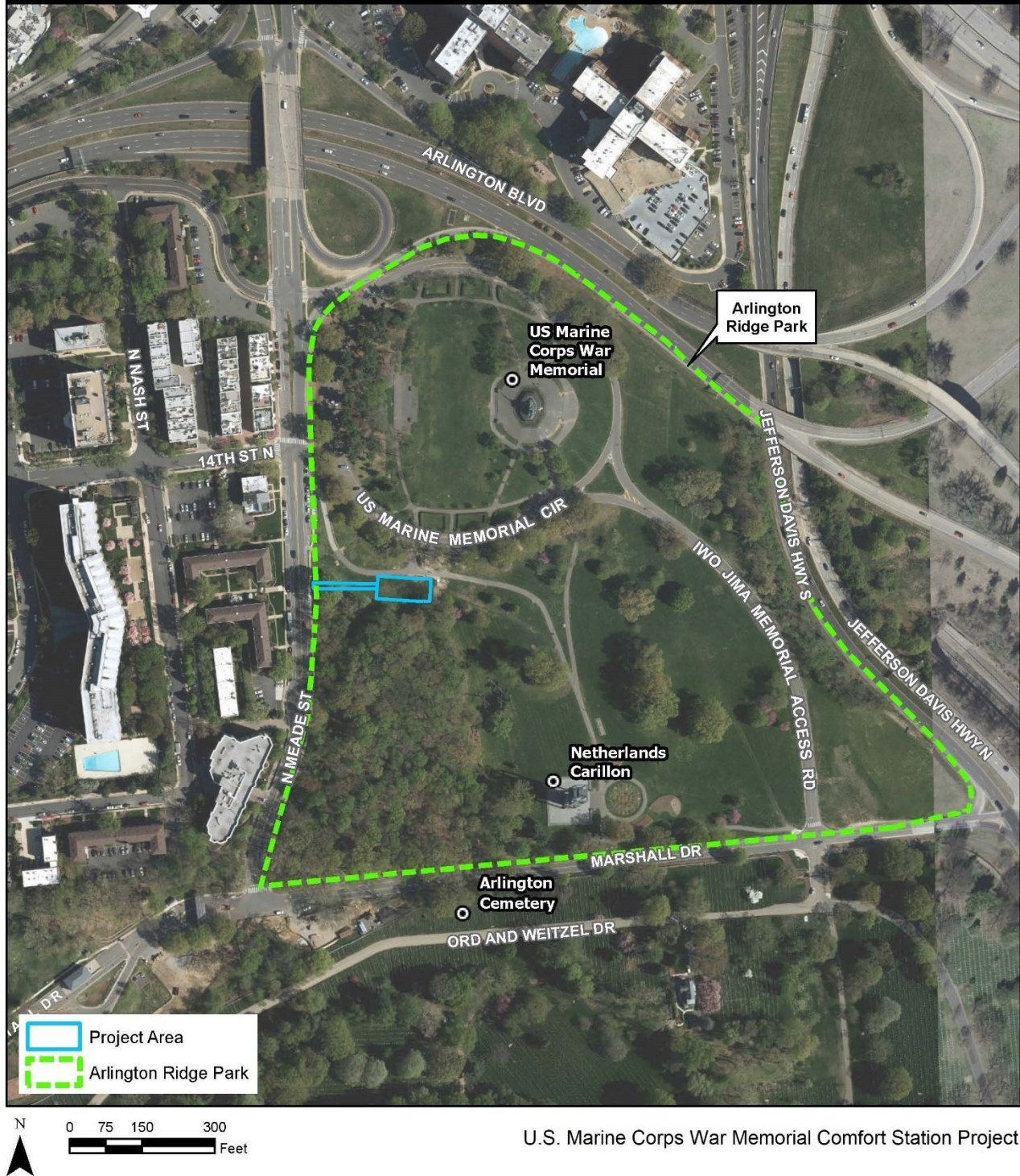
U.S. Marine Corps War Memorial Comfort Station Project