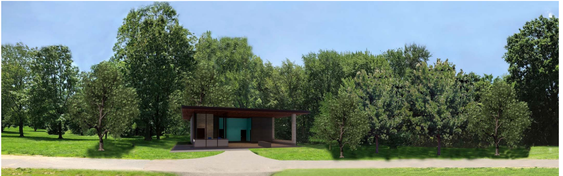
Figure 6a: Rendering of Design Concept 2 – Angled Axis