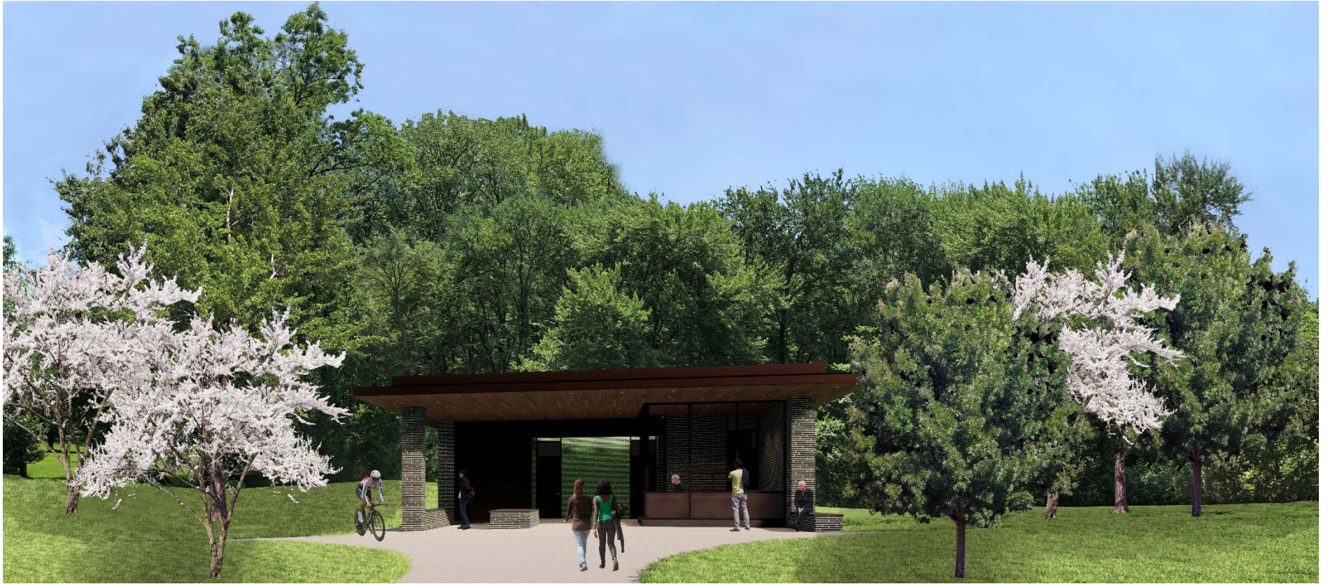
Figure 4a: Rendering of Preferred Design Concept – North-South Axis