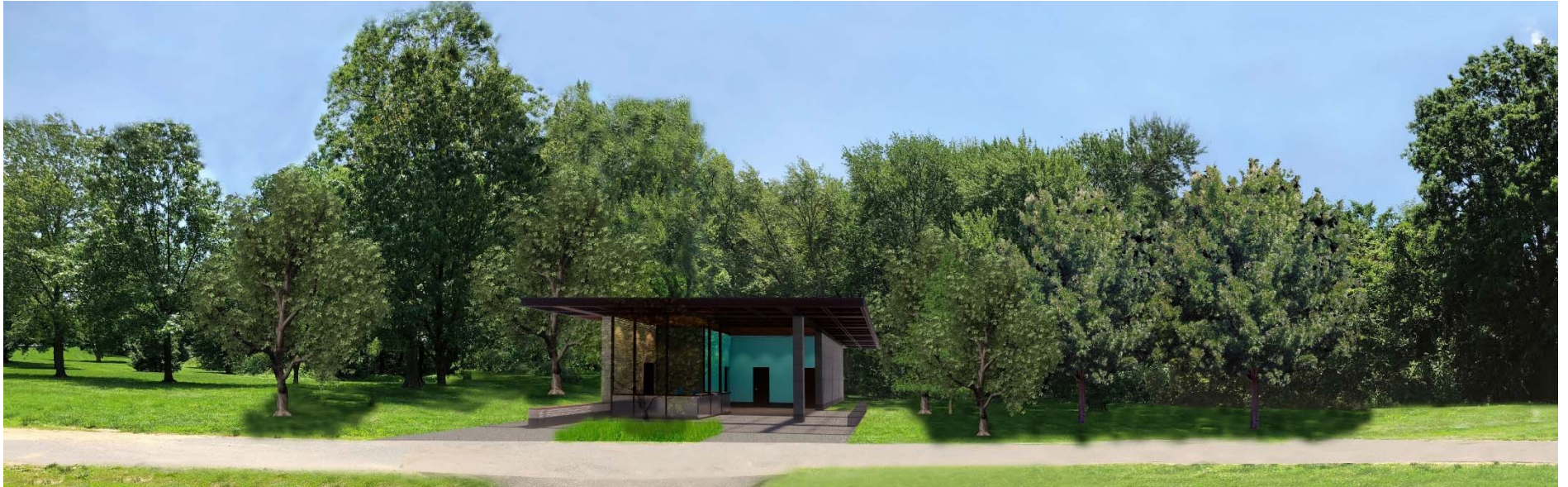
Figure 5a: Rendering of Design Concept 1 – North-South Axis