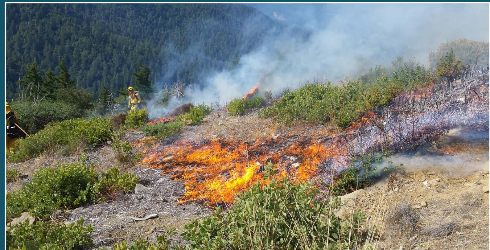
Prescribed fire being used to reduce fuel loads and slow encroachment

Operational method refers to the method by which trees are felled and how woody material is treated and/or removed from the treatment area.