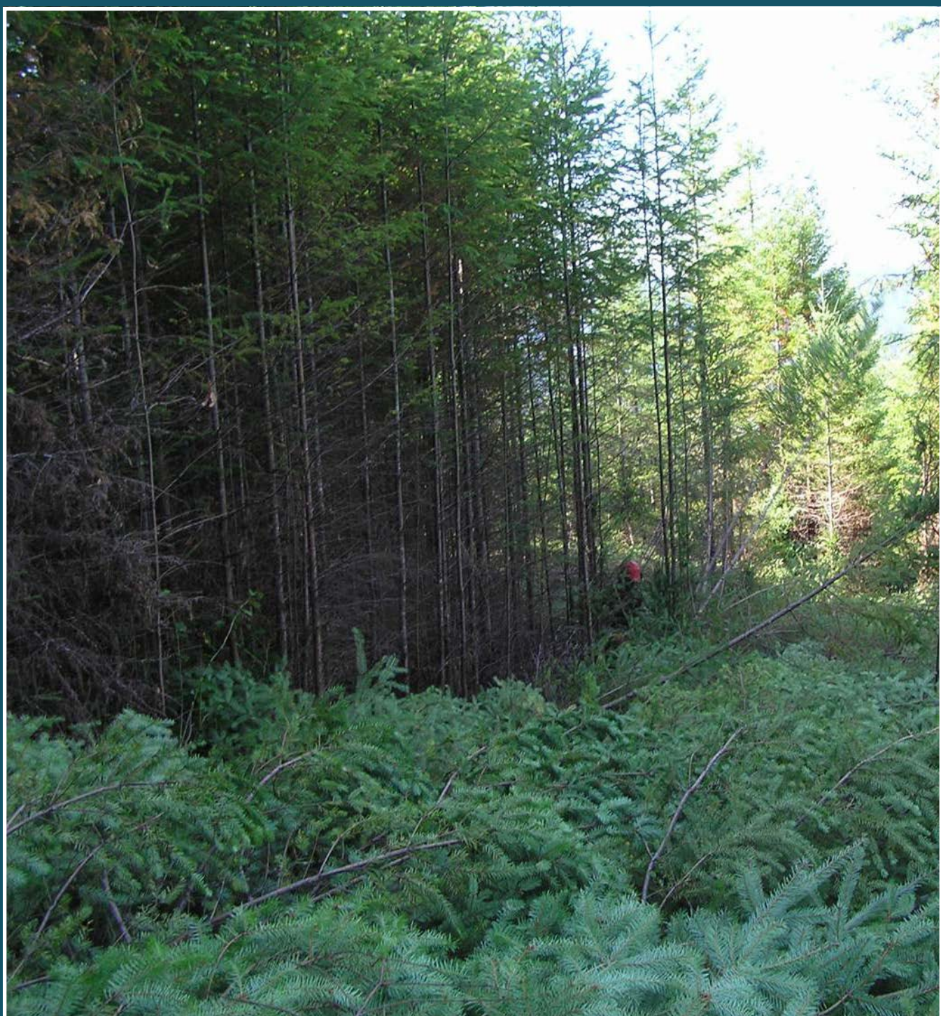
An example of a young, overly dense forest being thinned to improve growth and maintain forest health.

The main action is forest restoration through thinning, which would involve treatments to reduce stand density, redistribute growth among the remaining trees, and enhance forest conditions to expedite the development of late-seral structure.