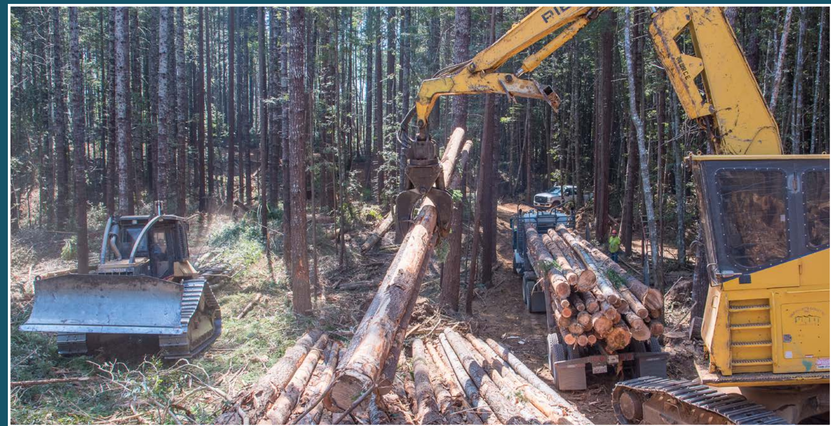
As part of ground-based operations, a skidder pulls cut trees to a small landing where they are processed and loaded onto a haul truck.