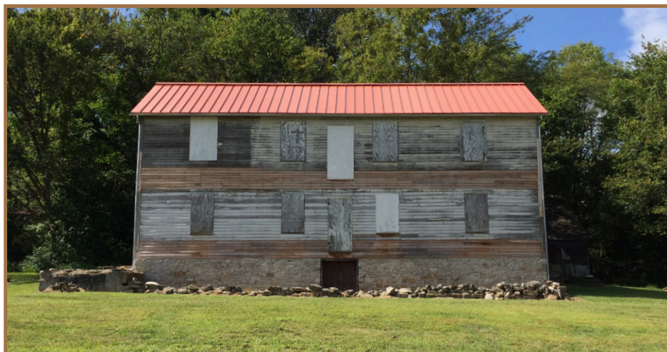
Left, Lasource-Durand House. Above, Delassus-Kern House