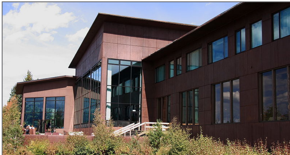
Jackson Lake Lodge is one of several facilities operated under contract GRTE001