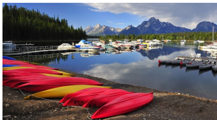
Boat rentals, tours, and summer slip rentals are available at Colter Bay Marina.

A prospectus is a public solicitation for offers to conduct business with the National Park Service through a concession contract. The development of a prospectus for a new concessions contract to provide commercial visitor services within Grand Teton National Park has been initiated. Under the existing contract (referred to as CC-GRTE001-07), Grand Teton Lodge Company provides lodging, food and beverage services, retail, marina operations, campgrounds, guided horseback rides, guided fishing trips, and guided float trips at several locations within the park. Other concession contracts provide visitor services at Signal Mountain, Leeks Marina, Climbers' Ranch, and Triangle X Ranch as well as recreation services provided by fishing and river guides, cross-country ski guides, and mountaineering guides.