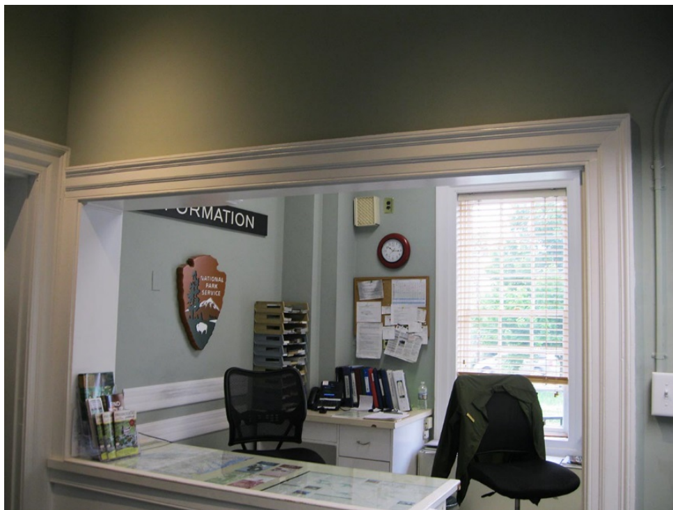
That portion of the original wall above the existing desk opening will be left, thereby allowing the original plan and space to be read.