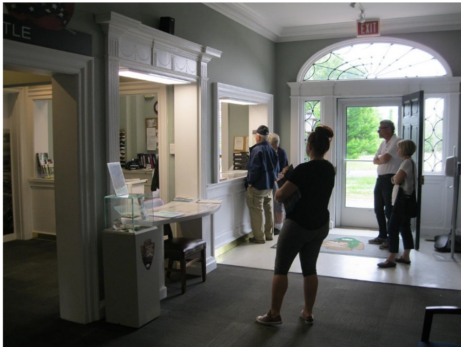
The information desk at the Fredericksburg Visitor Center, in its current configuration. The temporary desk addition is to the left. Behind it is the portion of the desk that the park proposes removing.