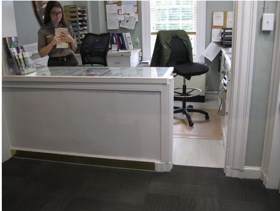
The portion of the desk that the park proposes removing, thus opening the area. Note the small door, through which a staff member in a wheelchair could not pass.