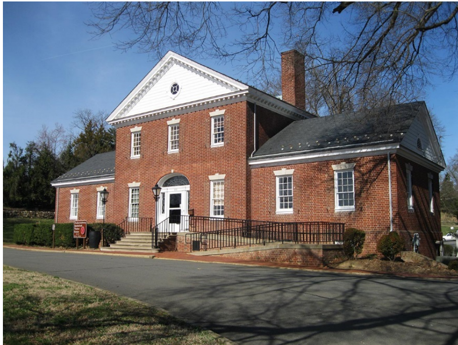
Fredericksburg Battlefield Visitor Center (former Fredericksburg Museum and Administration Building)