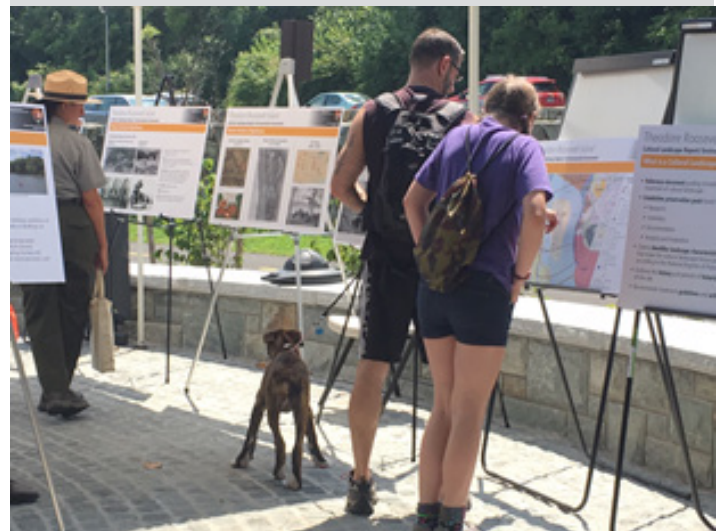
2017, TR Island Public Event (NPS)