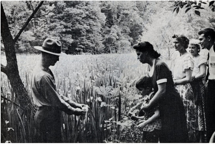
1955, Naturalist and Tour Group (Brochure, TR Center)