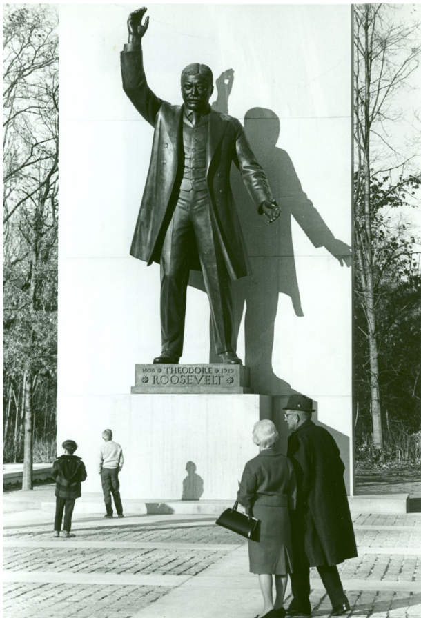
1967, Crowd viewing statue