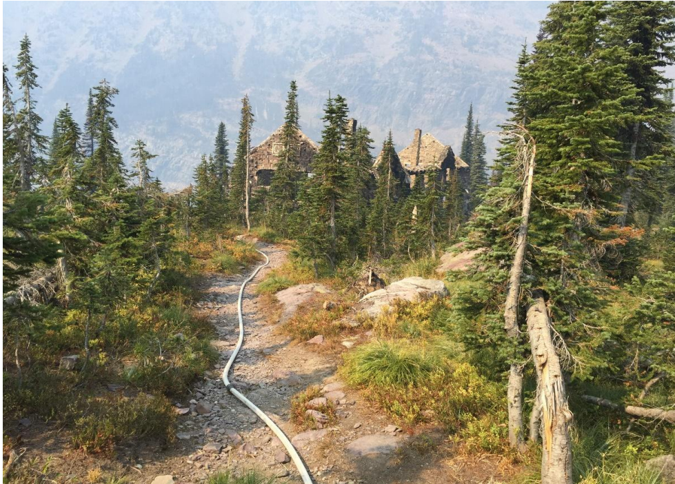
Figure 1. Unburned spruce hemlock forest around Sperry Chalet (2017).

Initial structural assessment of the Sperry Chalet Dormitory and Sperry Chalet Dining Hall was performed on September 12, 2017. Contract engineers found the dormitory's remaining four stone masonry walls to have retained their structural integrity after the fire on August 31. The Sperry Chalet Dining Hall sustained minimal damages to the roofing and decking. None of the other structures in the complex suffered damage. The forest around the complex is still green and intact despite the ember shower that was driven by winds from the valley below (Figure 1).