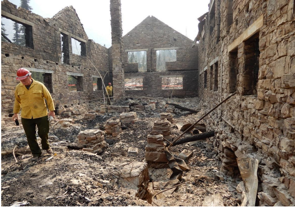
Figure 2. Remaining Sperry dormitory structure (2017).

In two out of the last three years (2015, 2017), the surface water system that has served the Sperry Chalet complex for over 100 years has gone dry due to the disappearance of the nearby snowfields. The system has been rehabilitated over the years to make more efficient use of the meltwater but never reengineered for a new source. Water conservation in operations and pumping from a small pond near the campground (1/4 mile away) have served as interim measures during these low water years.