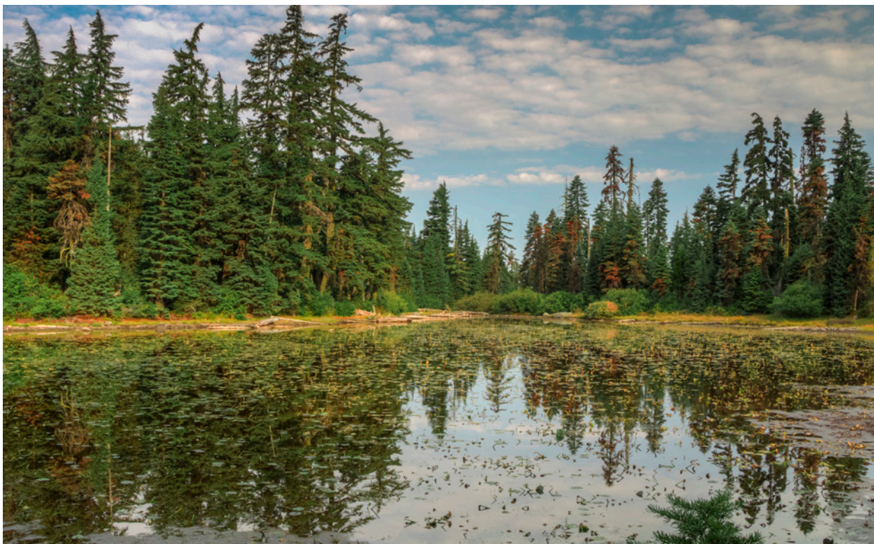
Upper Bigelow Lake.

Glacial features in the OCNMP include ice-carved lakes (tarns), subalpine ponds, glacially displaced boulders (erratics), windblown loess deposits, hanging valleys, faceted boulders, and residual rock piles known moraines. These