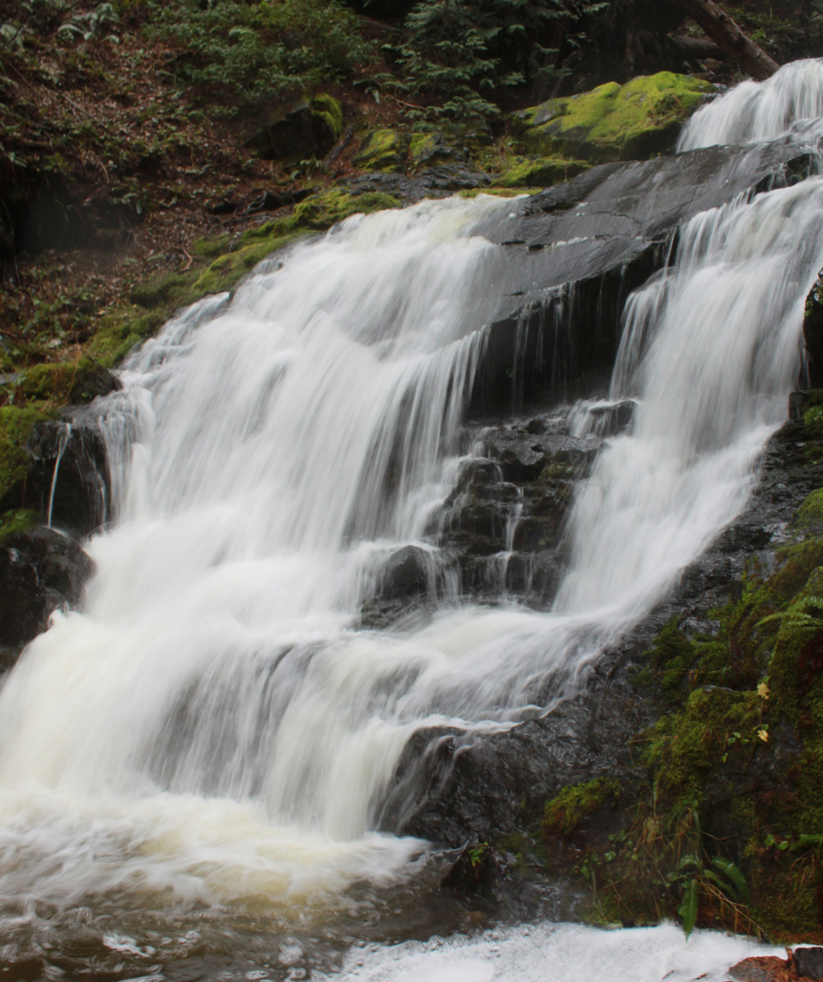
Waterfall on Lake Creek.