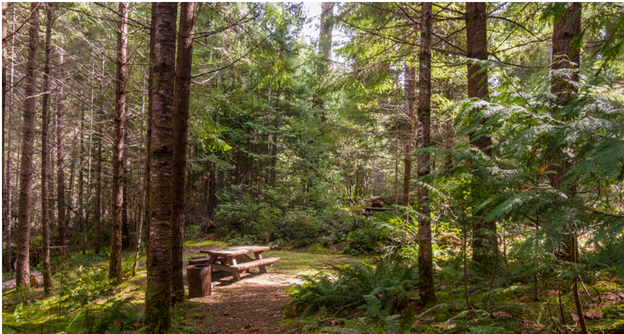
Campsite at Cave Creek Campground.

The candidate streams were found to not contain an aesthetics ORV. The streams and their surroundings are scenic, but these values are typical in the picturesque Klamath-Siskiyou region. The study team did not find any rare, unique, or exemplary scenic values.