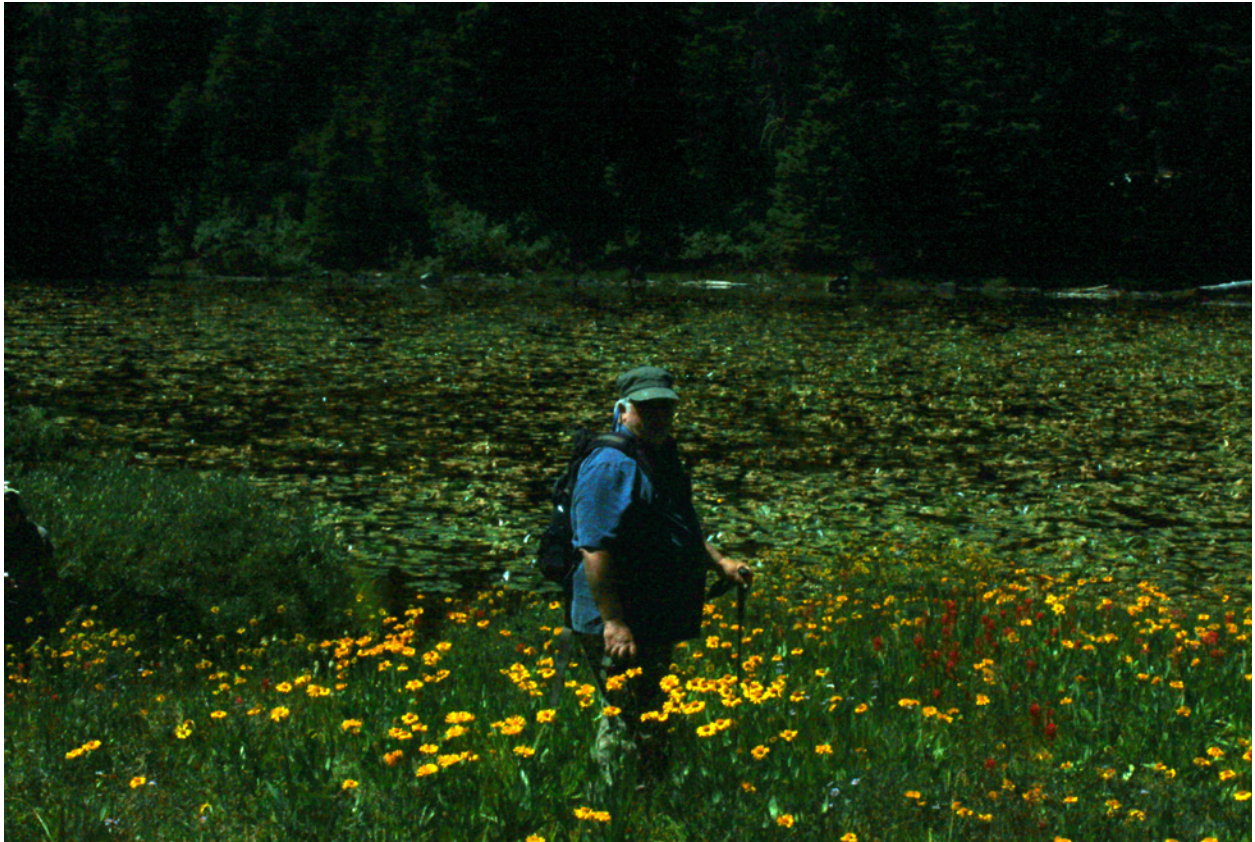
Bigelow Lakes Hiker.