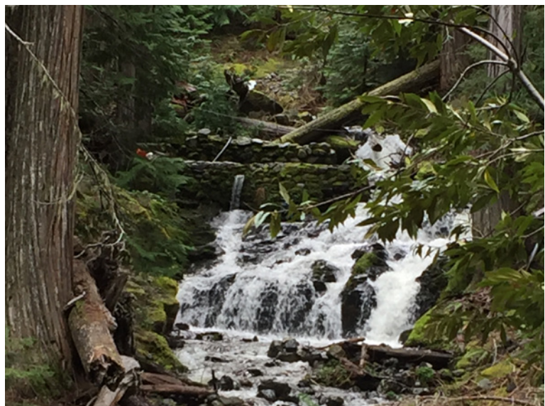
[Left to right] 1. Lake Creek water intake. 2. The water intake creates a diversion on Lake Creek that spans only part way across the creek.