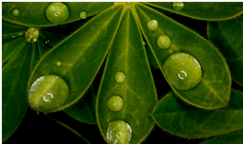
Lupine Waterdrops.

The NPS's draft findings conclude both Lake Creek and Upper Cave Creek are eligible and suitable for WSR designation.