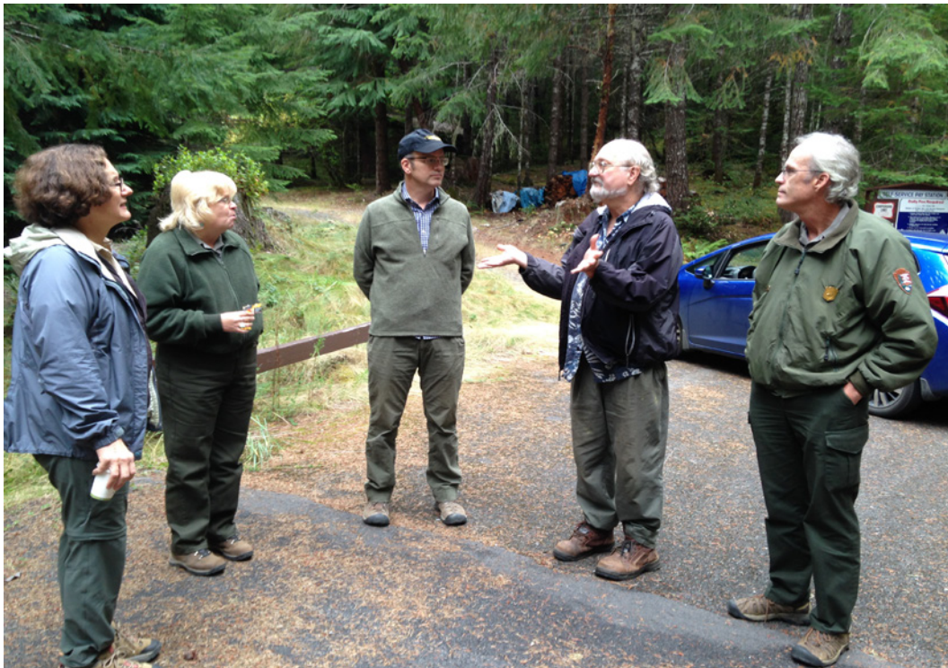
The study team discuss the creeks and their river values during the scoping workshop.

A categorical exclusion (CE) was selected as the most appropriate NEPA pathway for this study.