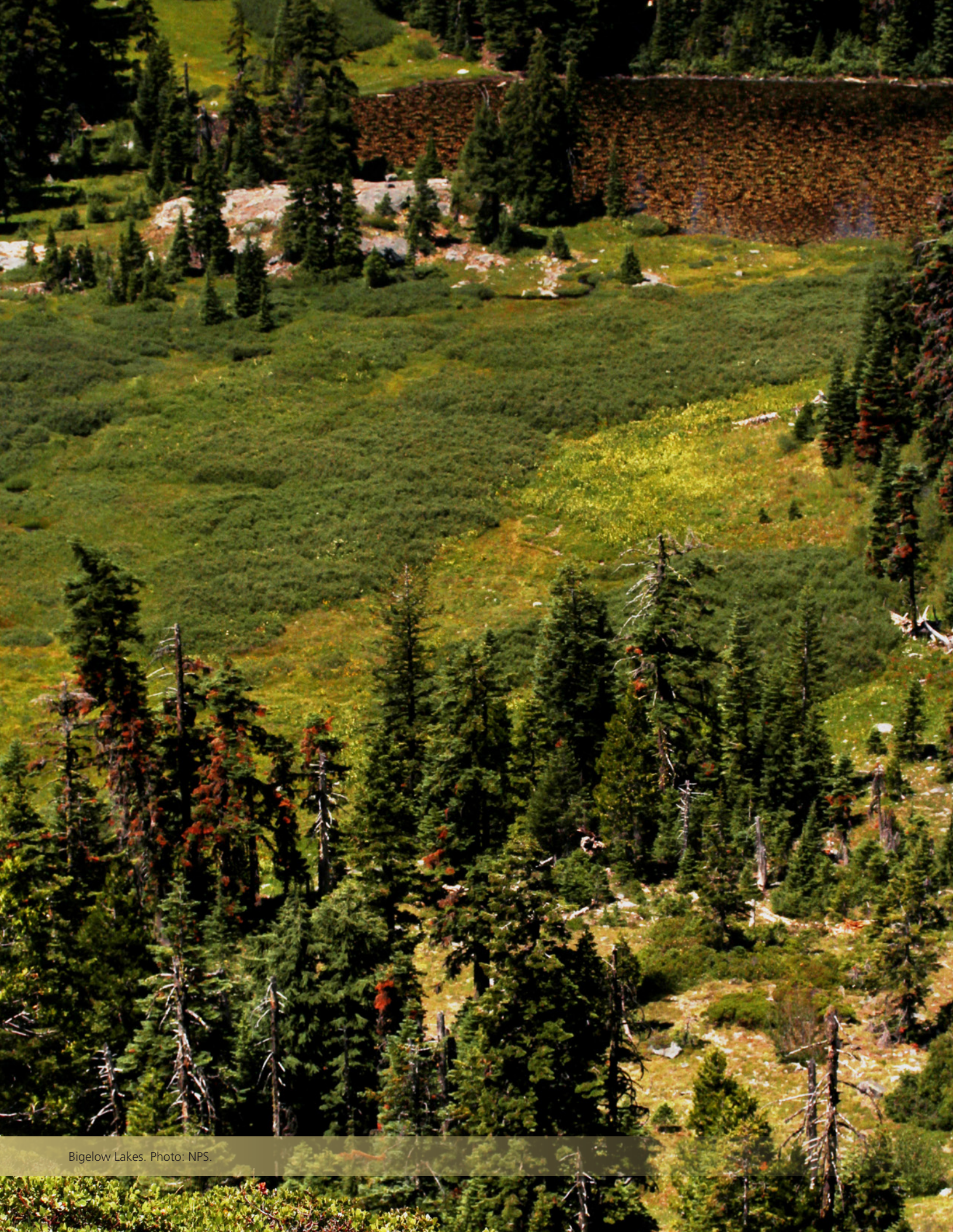
Bigelow Lakes.