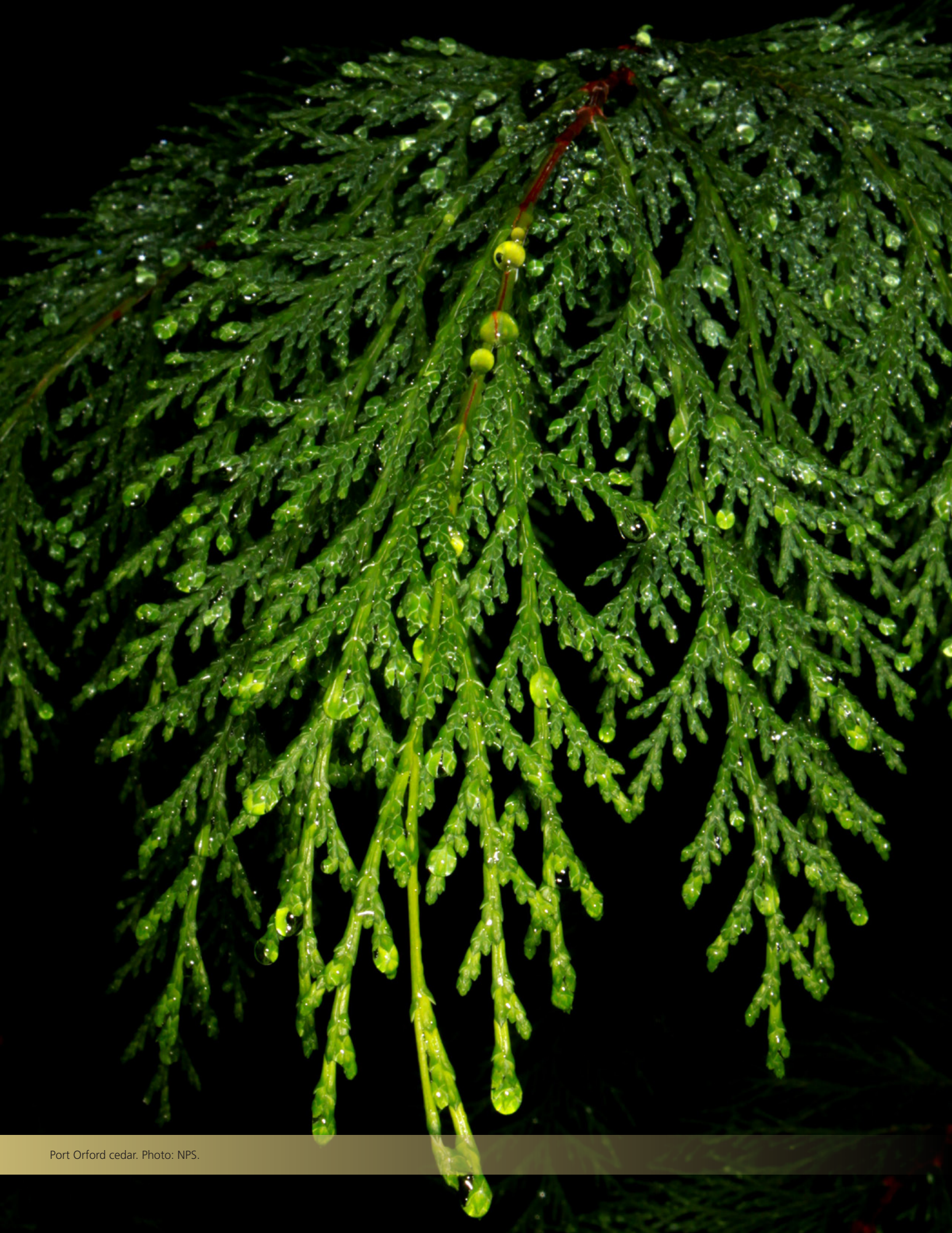
Port Orford cedar.