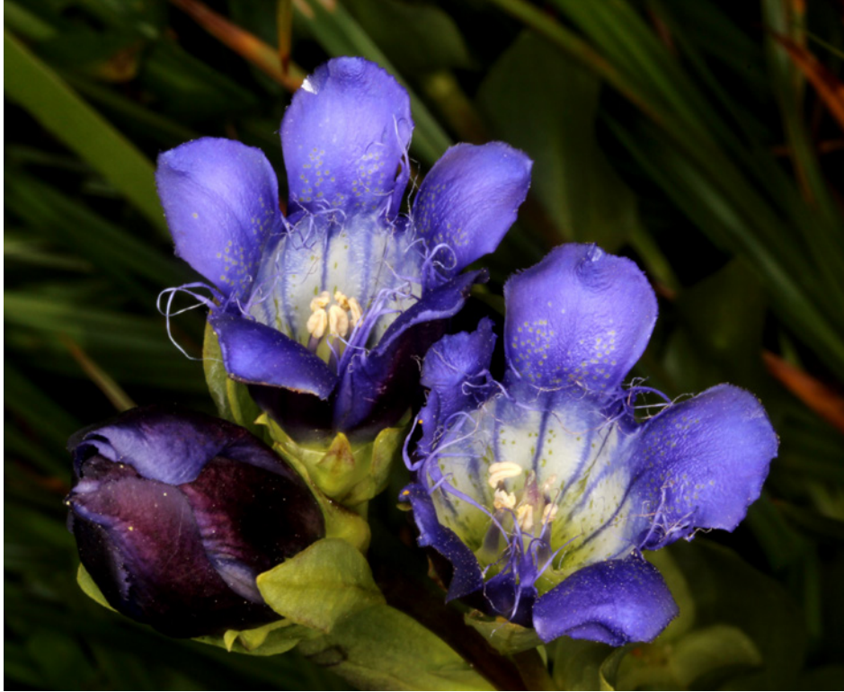
Mendocino gentian, a regionally endemic species.