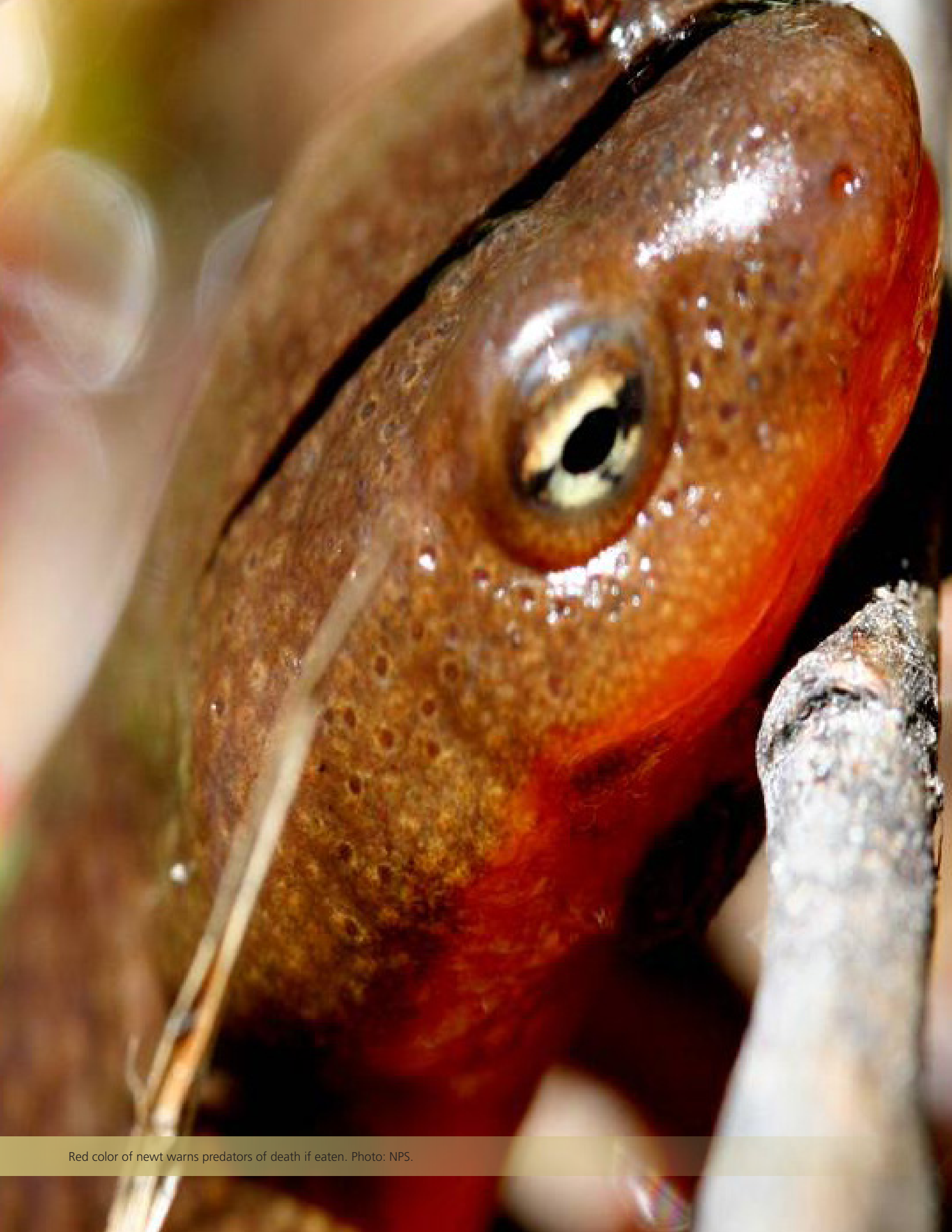
Red color of newt warns predators of death if eaten.