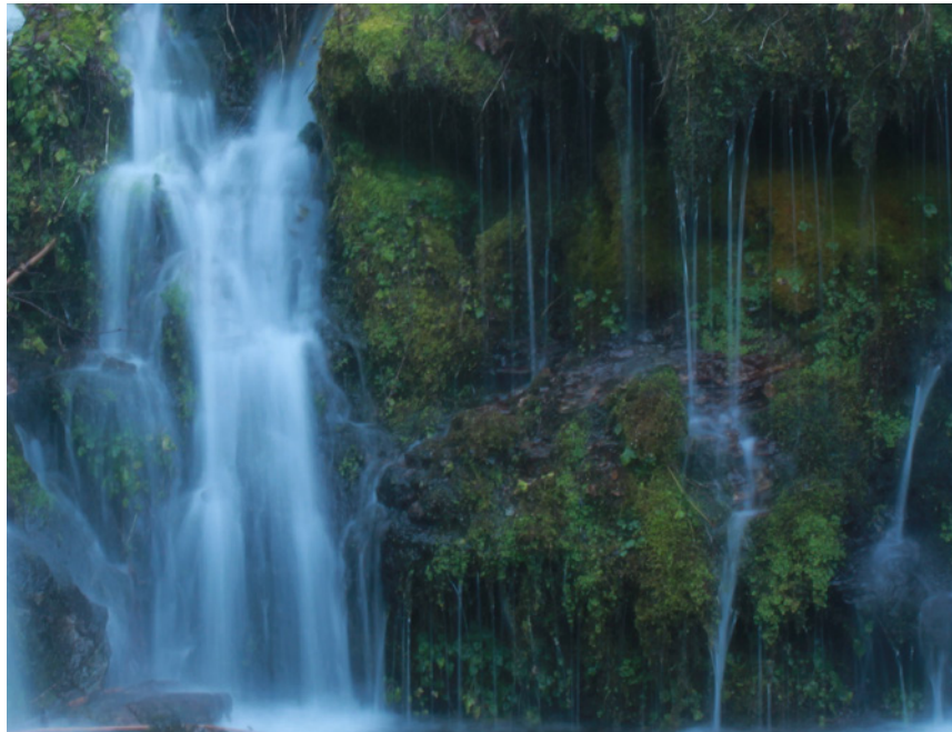
Falls at Upper Pond.

Before including your address, phone number, e-mail address, or other personal identifying information in your comment, you should be aware that your entire comment—including your personal identifying information—may be made publicly available at any time. While you can ask us in your comment to withhold your personal identifying information from public review, we cannot guarantee that we will be able to do so.