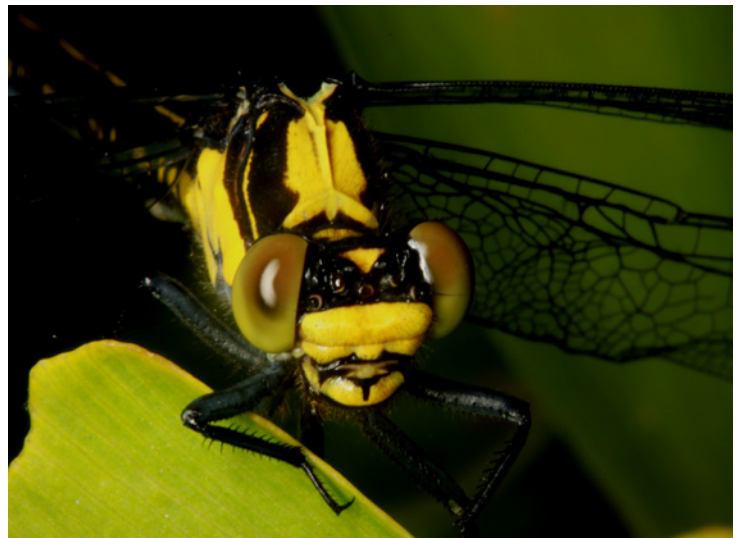
[Left to right] 1. Study team member, Eric Dinger, showing the macroinvertebrates in Lake Creek; the macroinvertebrate biodiversity in Lake Creek was one of the highest rates found in measured headwater streams in the northwest. 2. Dragonfly.

for its rare, endemic species only found here. The flow of the River Styx, along with water dripping through cracks in the marble, also supplies the humidity cave species need to survive the summer drought that otherwise would dry out much of the cave through which the River Styx flows.