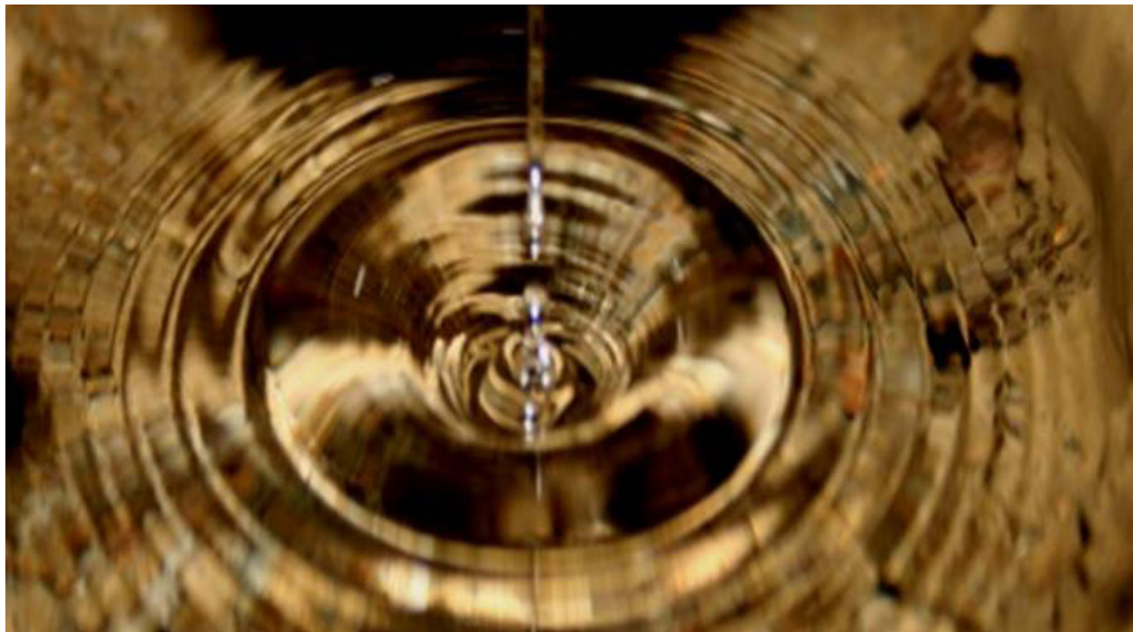
Water inside Oregon Caves.

WSR designation would elevate the Port Orford cedar, macroinvertebrate biodiversity, ecologic, geologic, and water quality values, thus furthering the purpose of the OCNMP. WSR protection is consistent with the way OCNMP manages its lands. WSR designation would offer some additional protections under Section 7 of the WSRA and provide another layer of protection. Designation would require the development of a comprehensive river management plan which would enable better stewardship of the river segments and their special resources.