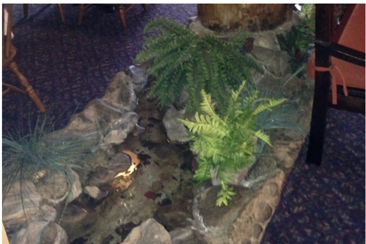
A portion of Lower Cave Creek downstream of the cave was diverted into a structured pond and then a stream that flows through a restaurant as shown above. NPS photos.