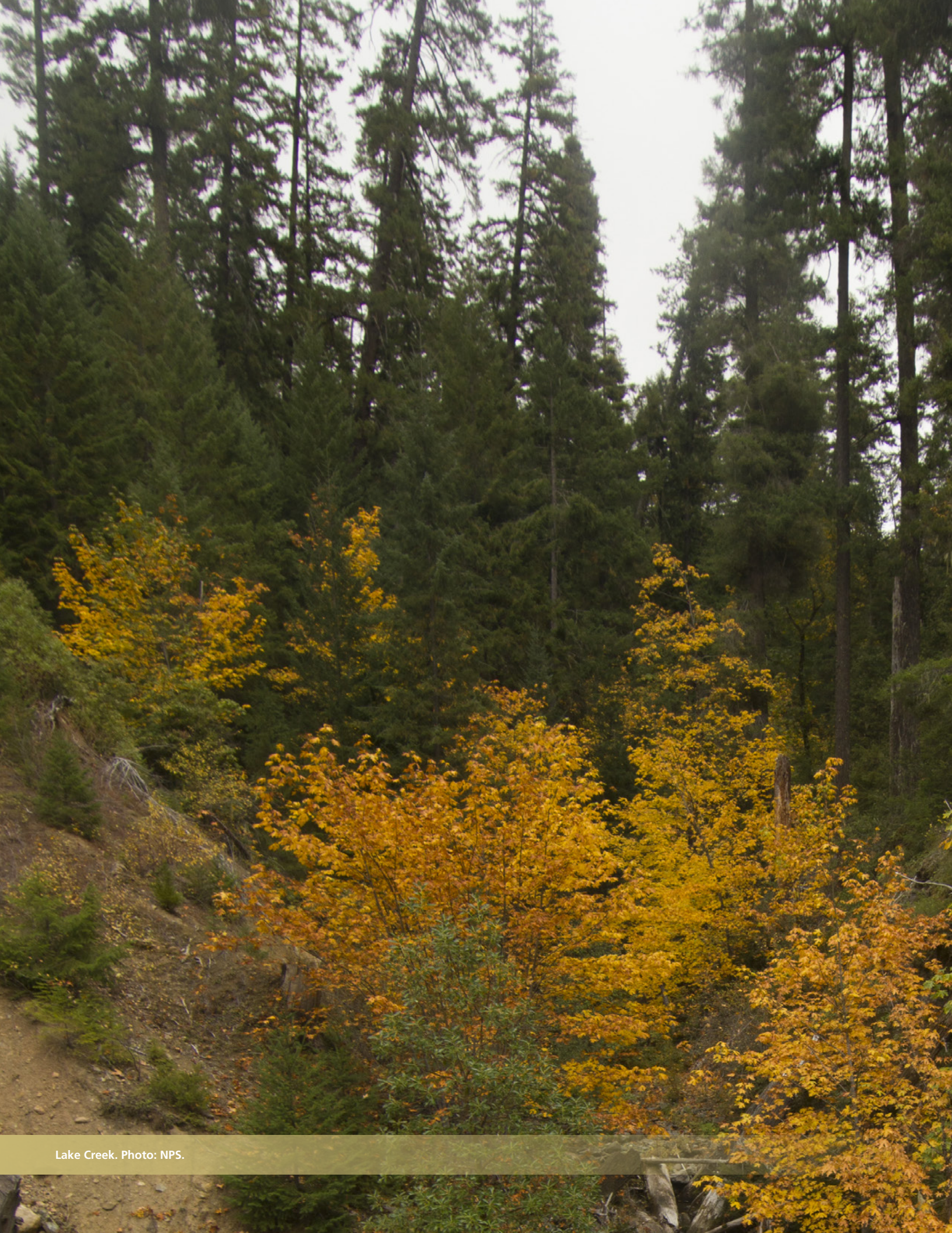
Lake Creek.