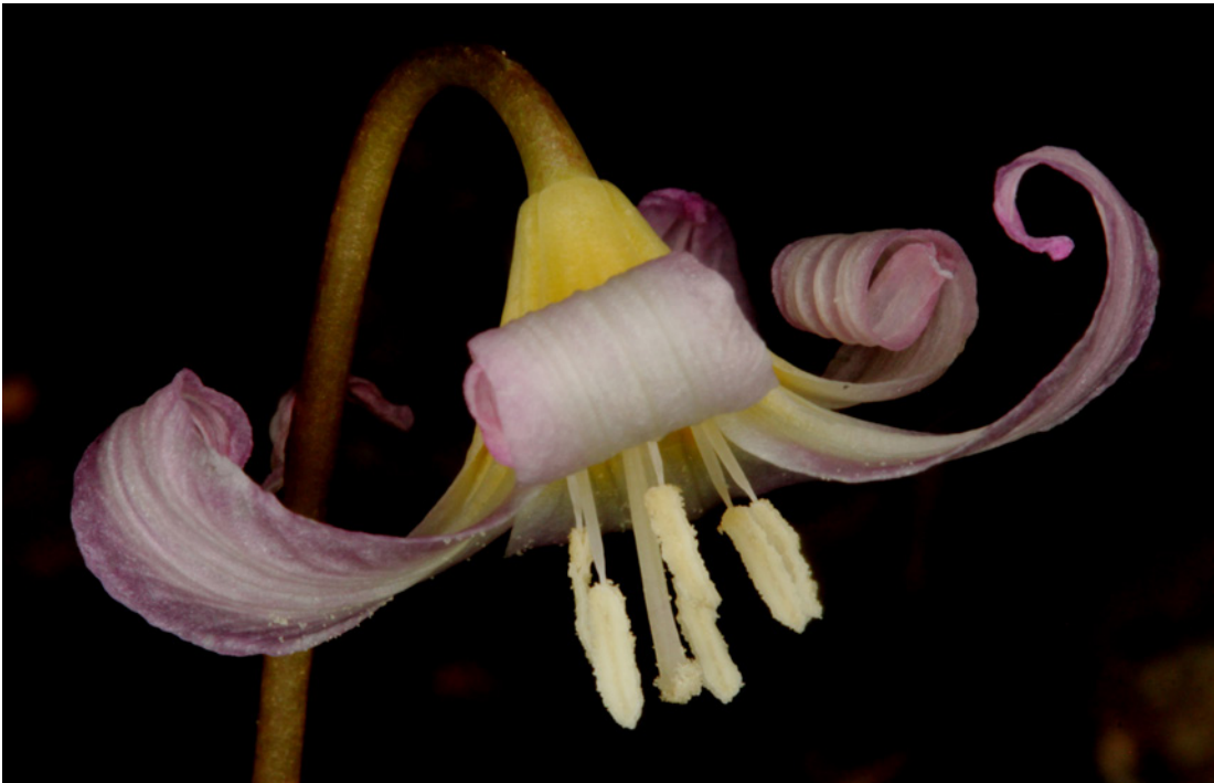
Trout Lily.