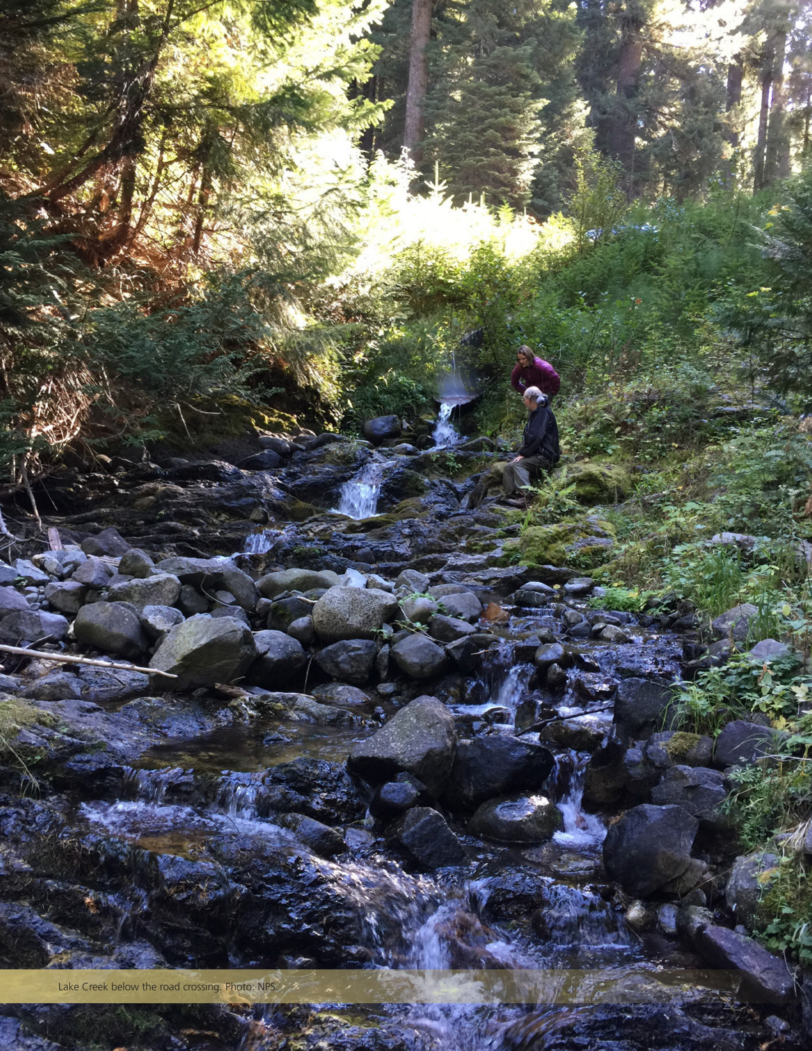
Lake Creek below the road crossing.