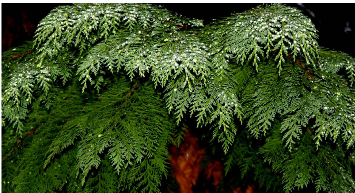
Port Orford Cedar.

The macroinvertebrate biodiversity in Lake Creek was very high, an indicator of an undisturbed, pristine stream system. The high biodiversity was measured as taxa