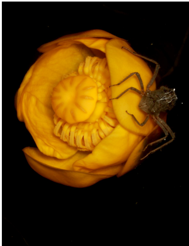
Shed Dragonfly Skin on Spatterdock.

All maps are placed within the text of the applicable chapters. The reader should rely on the text, maps, and tables taken together to fully understand the proposed findings described in this study.