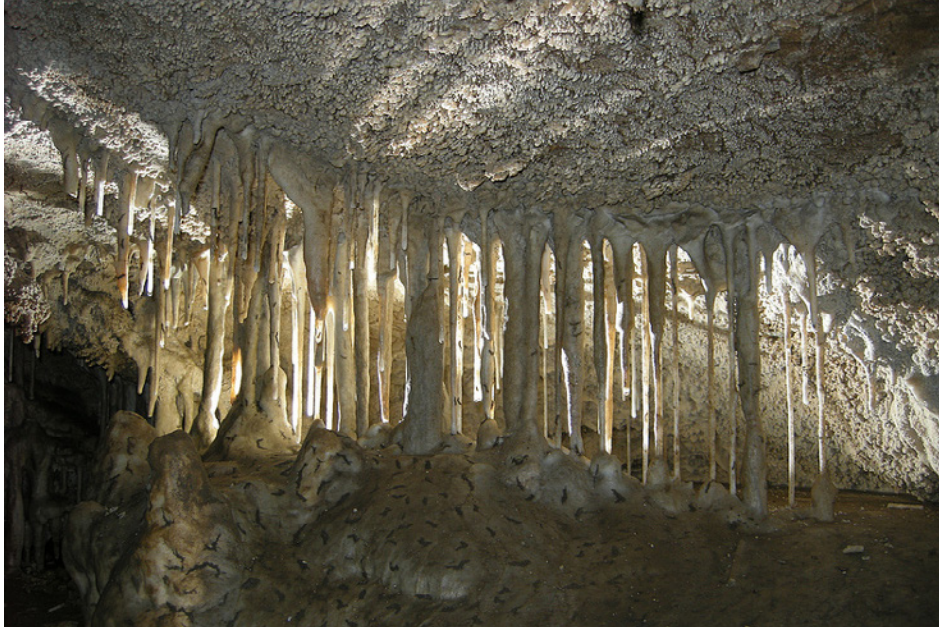
Soda straw columns in Oregon Caves.