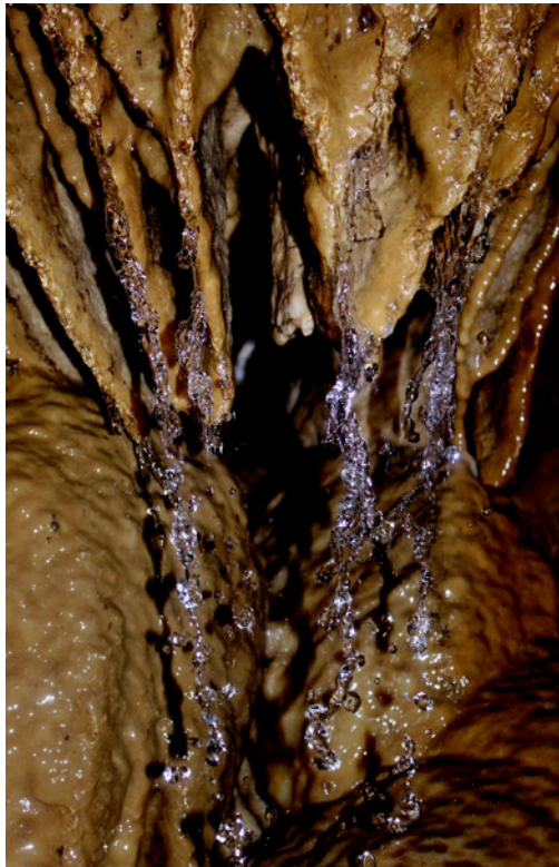
Temporary falls on cave formations.