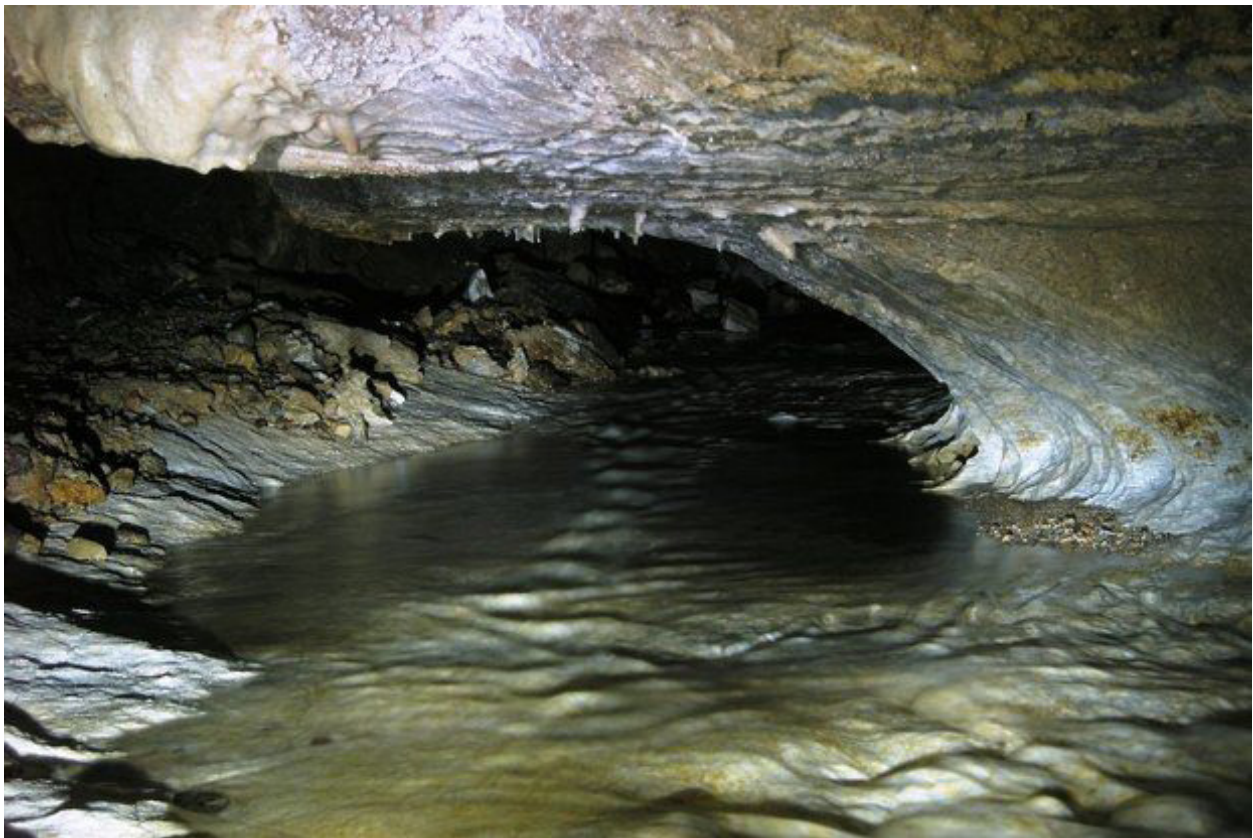
River Styx.

and turning cave routes provide visitors with a sense of discovery, immersion, adventure, and amazement. It's a memorable experience leaving visitors, often those entering an attractive cave for the first time, with a sense of accomplishment and a renewed interest in nature. The immersive nature of the experience engages most senses, allowing visitors to feel water dripping in the cave, hear the echoing sounds of River Styx, and see the scenic splendor of the river and cave formations. The small group tours, led by NPS interpretive rangers, offer exemplary interpretive experiences and ample opportunities for personal challenge and memorable achievement, as well as learning about the complex rocks and hydrology of the cave environment and the mountain watershed.