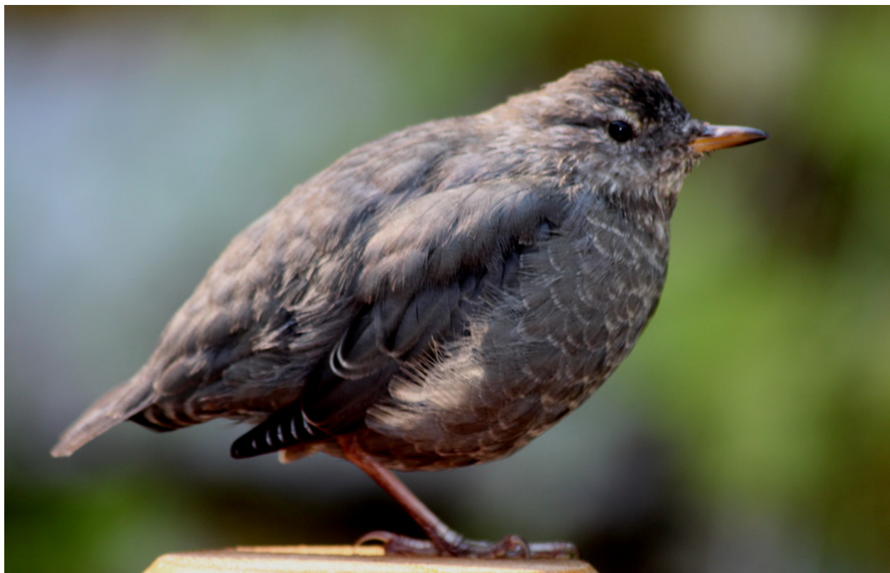
Ouzel near Cave Creek.

Figure 3 shows the preliminary classifications for Lake Creek and Upper Cave Creek.