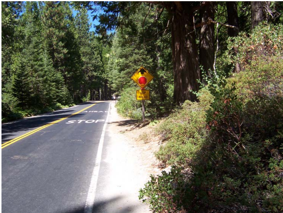
Photo 2 - Western Approach