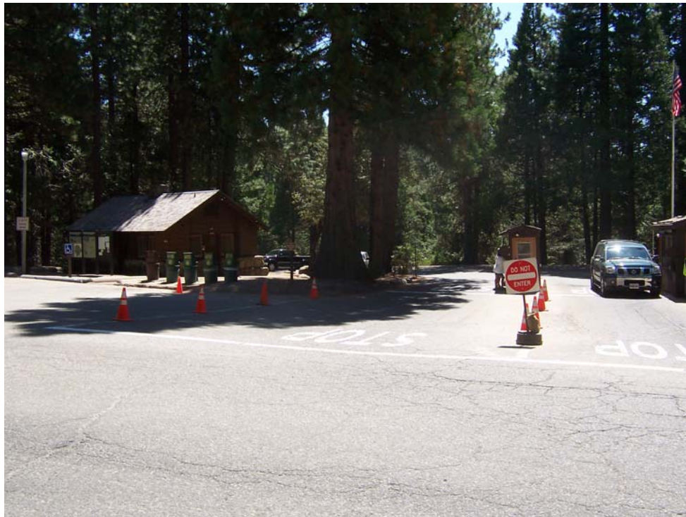
Photo 1 - South Entrance Intersection