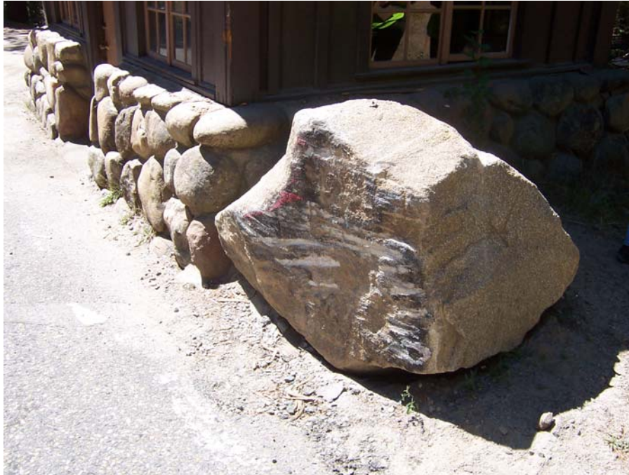
Photo 5 - Damaged Rock