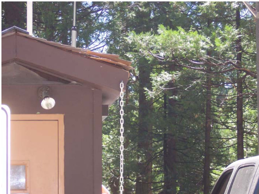
Photo 6 - Damaged Kiosk