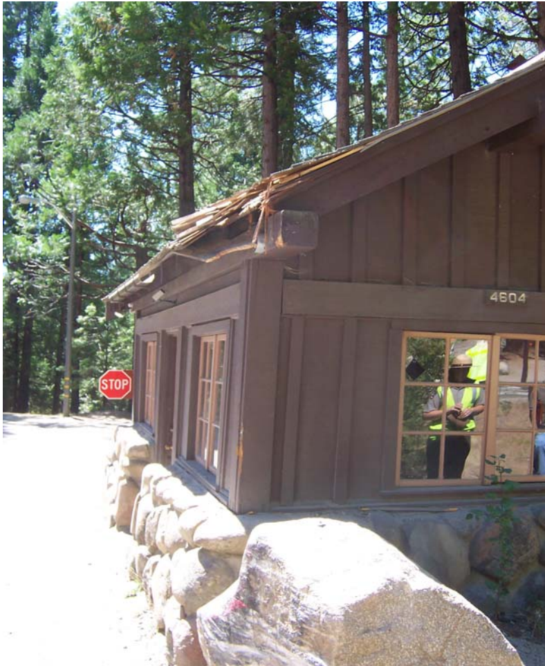
Photo 3 - Damage to Entrance Station Office