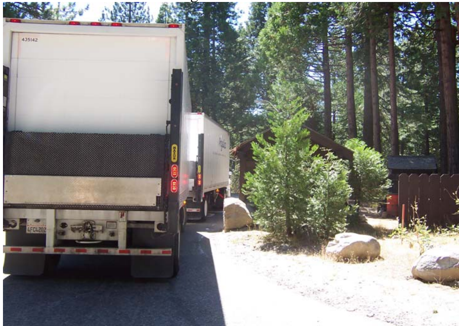
Photo 4 - Traffic through the Station