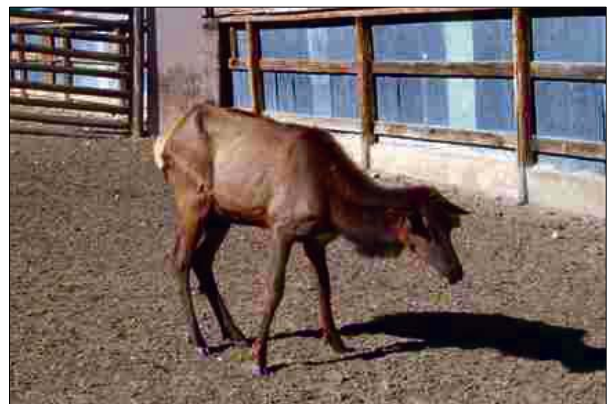
Elk with chronic wasting disease.