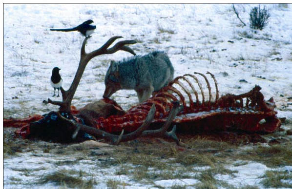
Coyote and magpies scavenging on an elk carcass.

protect aspen habitat from browsing. Adverse impacts would be less under Alternative 5 because supplemental feeding would continue in most winters. Alternative 4 impacts could be reduced after the initial phase due to adaptive changes in exclosure design.