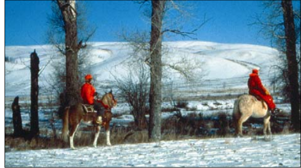
Hunters on the National Elk Refuge.

Visitation to Grand Teton National Park from May through October would continue to generate an estimated $306.5 million in personal income and 14,265 jobs annually in the Jackson Hole economy under Alternatives 1 and 5. If reductions in elk numbers under Alternatives 2, 3, and 6 caused park visitation during this period to decline by as much as 7%, annual personal income in Jackson Hole would decrease by an estimated $20.1 million