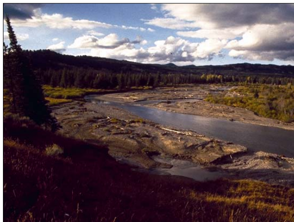
Riparian habitat along Pilgrim Creek in Grand Teton National Park.

Grand Teton National Park / John D. Rockefeller, Jr., Memorial Parkway — Perpetuate to the greatest extent possible natural processes and the interactions of bison and elk with natural environmental fluctuations that are influenced by fire, vegetation succession, weather, predation, and competition. At the same time support public