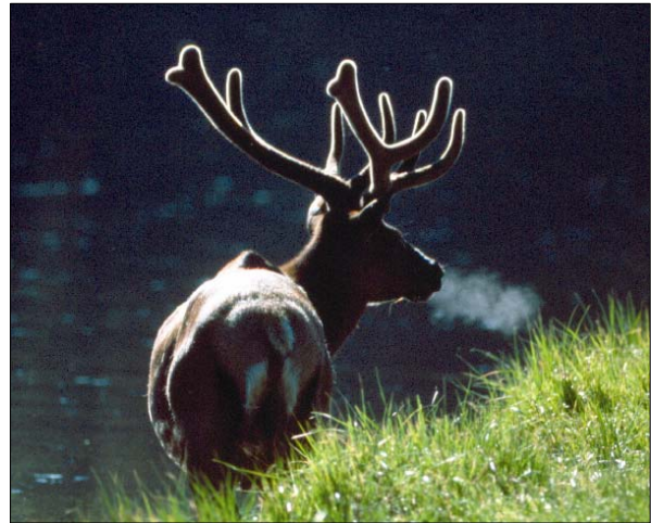
Elk in Grand Teton National Park.

Under Alternative 5 there would be at least 11,000 elk in the Jackson elk herd in the long term, similar to Alternative 1. The number of elk wintering on the refuge (5,000–7,500) would also be similar to baseline conditions and Alternative