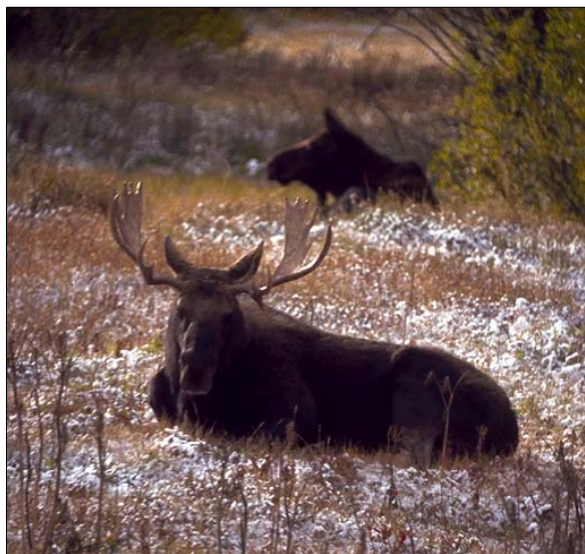
Moose in Grand Teton National Park.

Over time efforts to actively manage the elk and bison herds and their habitat would be greatly