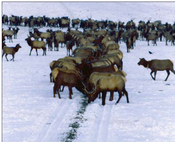
Elk feedline on the refuge.