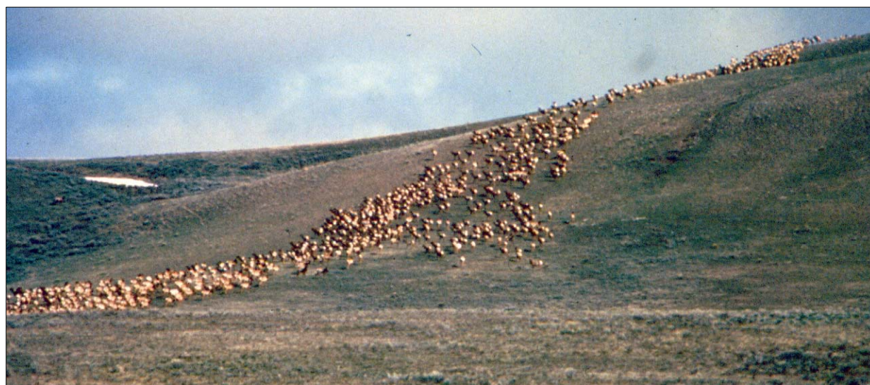
Elk migration on the National Elk Refuge.

Park Service and the U.S. Fish and Wildlife Service, with the Wyoming Game and Fish Department and the U.S. Forest Service participating as cooperating agencies. The selected alternative called for public hunting on the refuge and in Bridger-Teton National Forest to control the rapidly growing bison population and the artificial concentration of bison during the winter. Both of these factors were contributing to the increased