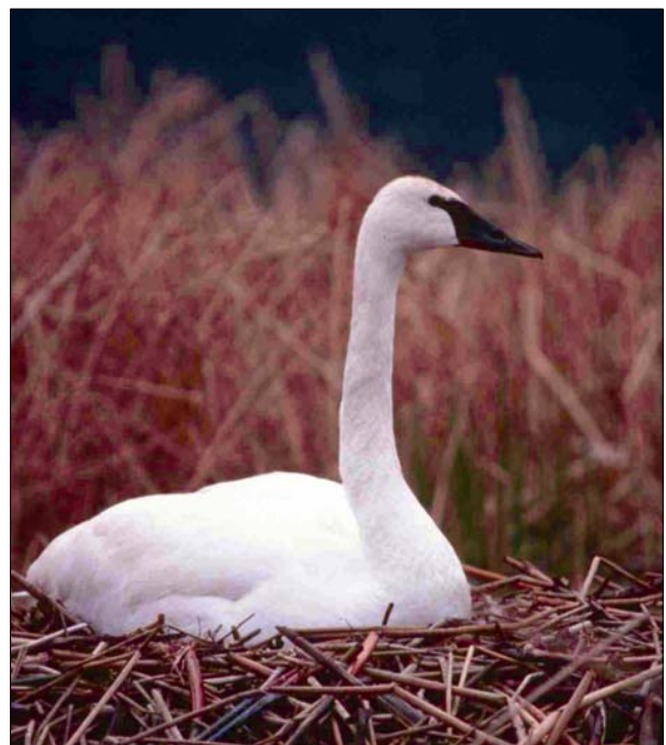
Trumpeter swan nesting on the National Elk Refuge.

Ethnographic Resources. Hunting was a tradition practiced by American Indian tribes, who are believed to have traditionally used the lands within