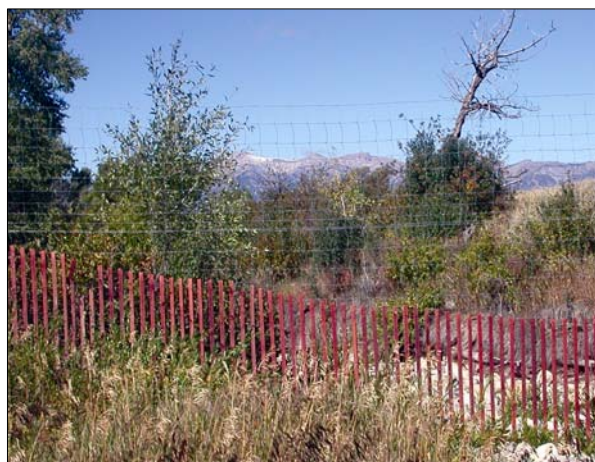
An enclosure on the refuge used to prevent browsing by elk and bison.

Aspen habitat would continue to decline under all alternatives except Alternative 6 due to elk and bison grazing, and it could be permanently lost