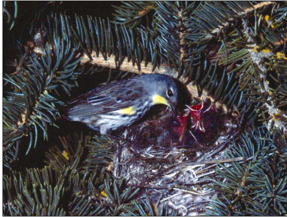
Neotropical migratory birds nest on the refuge and in the park.

risk of disease transmission, competition with elk and other wildlife, property damage, erosion, and overgrazing.