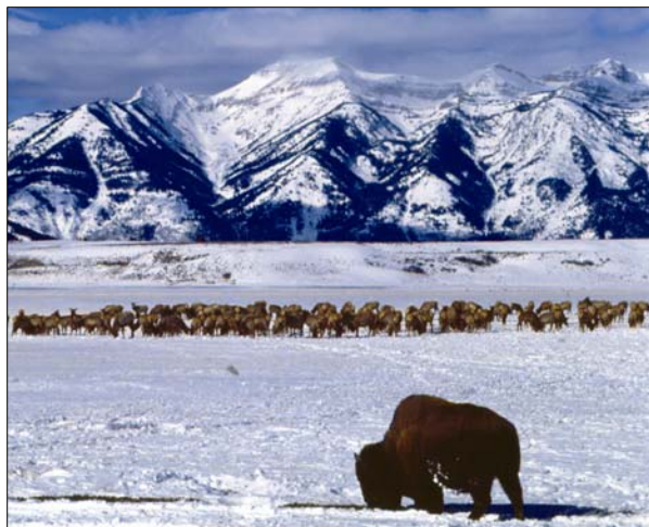
Bison and elk on the National Elk Refuge.

Extensive opportunities for input were also provided to local governmental agencies, tribal governments and organizations, nongovernmental organizations, and private citizens.