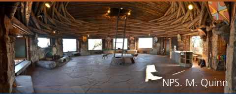
NPS: M. Quinn

Scoping meetings will follow an open house format with a presentation and an opportunity to speak with NPS staff before and after the presentation.