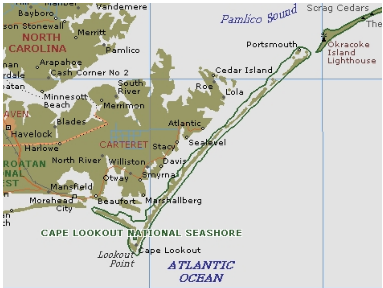
Figure 1. Map of CALO, inclusive of the action areas as defined for the species evaluated in this biological opinion.