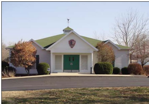
Civil War Museum