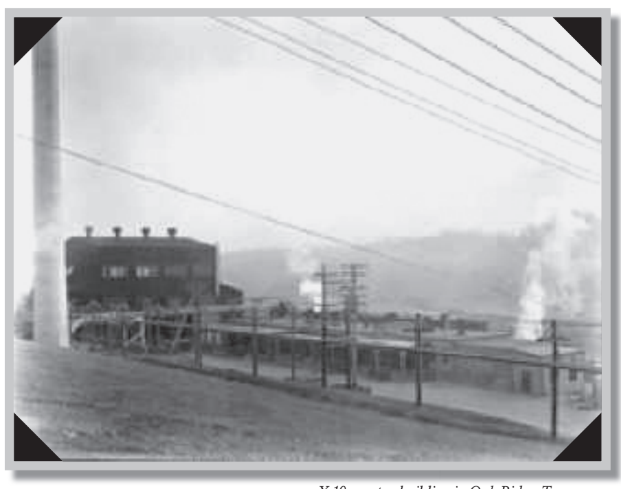
X-10 reactor building in Oak Ridge, Tennessee

examine various means of ensuring long term preservation and public appreciation of theses sites. The study will result in final recommendations to Congress concerning the future preservation of the sites and opportunities for public understanding.