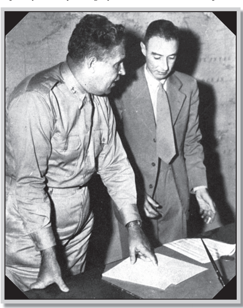
General Groves and Robert Oppenheimer

The National Park Service has been directed by Congress to conduct a special resource study for four of the Manhattan Project sites. The study will include evaluation of the significance of the sites as well as evaluations of the suitability and feasibility of designating one or more sites as units of the National Park System. As part of the study a range of alternatives will be developed which