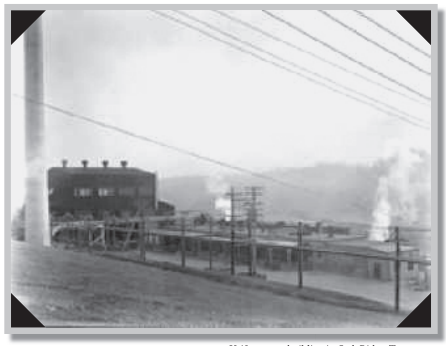
X-10 reactor building in Oak Ridge, Tennessee

examine various means of ensuring long term preservation and public appreciation of theses sites. The study will result in final recommendations to Congress concerning the future preservation of the sites and opportunities for public understanding.