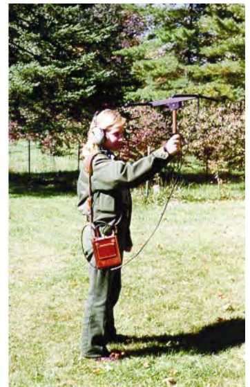
Deer movements were monitored by telemetry from 1988 through 1989 and again from 1994 through 1995 in order to measure several characteristics of the deer population.

In 1985 NPS staff initiated deer population density surveys to estimate the size of the herd within park boundaries. Between 1983 and 2000 aerial surveys were