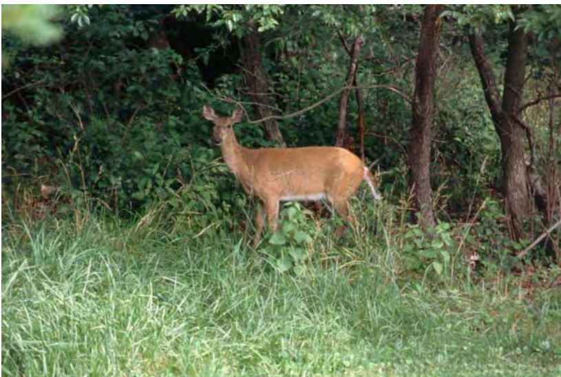
White-tailed deer at Catoctin Mountain Park.

When Catoctin Mountain Park was established in 1936, it is likely that no white-tailed deer existed within its boundaries. By the 1970s problems related to an overabundance of deer were suspected. The park's natural resource management staff first raised the issue of adverse impacts from deer browsing in the early 1980s, voicing concerns that the deer population might cause a long-term decline in both the abundance and diversity of native plant species (see appendix A ). Park staff researched information on the interactions between deer and plant communities, and park vegetation was inventoried in a preliminary assessment of the existing status. Catoctin Mountain Park's 1988 Resource Management Plan mentions concerns about the potential loss of long-term forest regeneration, changes in water quality that might arise from the loss of vegetation, and the potential transmission of disease and parasites from deer to humans (NPS 2000f).