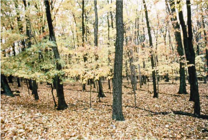
A browse line, a visible delineation at approximately six feet above the ground below which most or all vegetation has been uniformly browsed, is caused by excessive deer browsing.