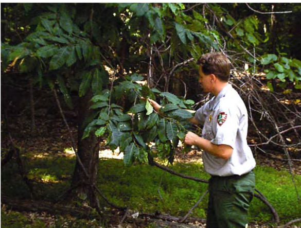
American chestnut was once a dominant tree in the park.

In addition to exotic plants, the health of Catoctin's forests is adversely affected by pests, such as insects, and disease, as described below.