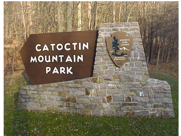
Catoctin Mountain Park is an example of a “Recreational Demonstration Area” and was designated as such in 1935.

The purpose of Recreational Demonstration Areas was stated in Public Law 594 of June 6, 1942. This law provides authority to the Secretary of the Interior to convey or lease to states or their political subdivisions “recreational demonstration projects and lands, improvements, and equipment.” The act stipulates, “the grantee or lessee shall use the property exclusively for public park, recreational, and conservation purposes.” During World War II, Catoctin Mountain Park served as a training area for the Office of Strategic Services, as well as a retreat for President Franklin Roosevelt, who called it Shangri-La (NPS 1998b).