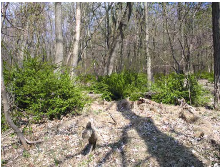
Japanese stilt grass, in the foreground, is an invasive exotic grass that spreads in areas that have been disturbed by natural or manmade events. Barberry, in the background, is another invasive exotic plant.

Invasive exotic plant species pose a serious threat to the natural environment of Catoctin Mountain Park. With no natural conditions to keep them in check, these plant species are able to outcompete native vegetation for sunlight, nutrients, and moisture. Exotic species tend to have relatively rapid growth rates and often survive in disturbed areas or drought conditions. However, not all exotic plant species are necessarily invasive. At Catoctin Mountain Park there are over 100 known exotic plants; 15 of these are designated as invasive species that require management (NPS 2005d).