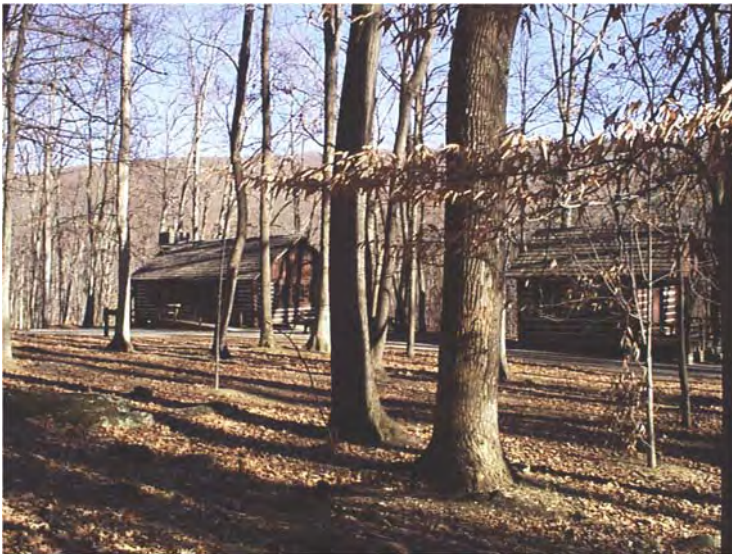
Camp Misty Mount and Camp Greentop are cultural landscapes and are available for public use.

Catoctin’s properties were acquired with stipulations for the conservation of natural resources, specifically reforestation and forestation. Therefore, the park is required by this original legislation to protect reforestation processes.