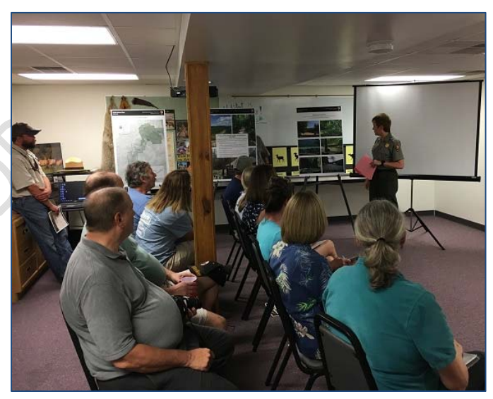
Figure 1. Public Open House Meeting at the Ponca Elk Education Center

To inform the public of the planning process and public scoping meetings, the planning team distributed a newsletter containing the purpose and need for the plan, key planning objectives, a preliminary proposed action, contact information for how to comment, the location of public open houses, and a general project schedule. The newsletter and information about public scoping were shared with the public in a variety of ways. Electronic versions of the newsletter were sent out to all contacts on the park's mailing list. Press releases, website posts, and social media notifications were also used to inform the public and stakeholders about the planning process and the opportunity to comment.