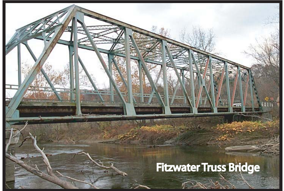
Fitzwater Truss Bridge

We cordially invite you to comment on the impact topics and the scope of this EA. Your participation ensures that we fully understand the interests and needs of our friends and neighbors as part of our national heritage, cultural traditions, and community surroundings.