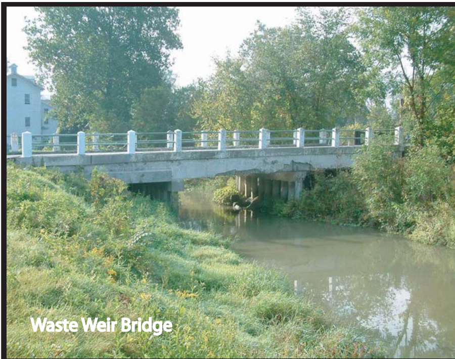
Waste Weir Bridge