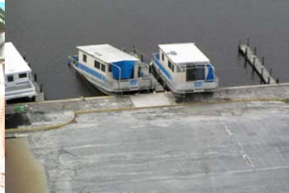
Houseboats lifted out of the marina