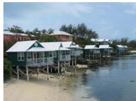
Eco-tent village (Bermuda)

Some of these structures could be permanent, while others could be taken down and stored during hurricane season. Examples around the world show success in using innovative design, materials and energy sources to support sustainable facilities, able to withstand hurricane force winds and storm surge.