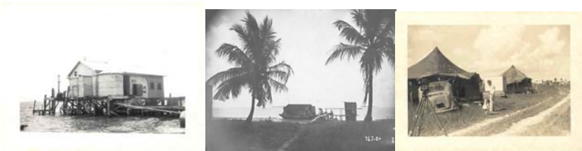
Images of historic Flamingo circa 1948