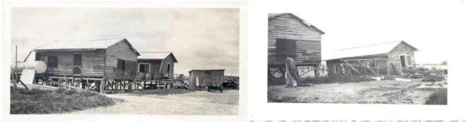
Historic Flamingo – before and after a hurricane hit in 1948