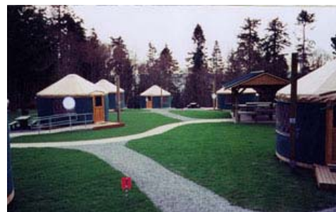
Yurts (dwellings originally of ancient Central Asia; now popular for eco-tourism lodging world-wide)