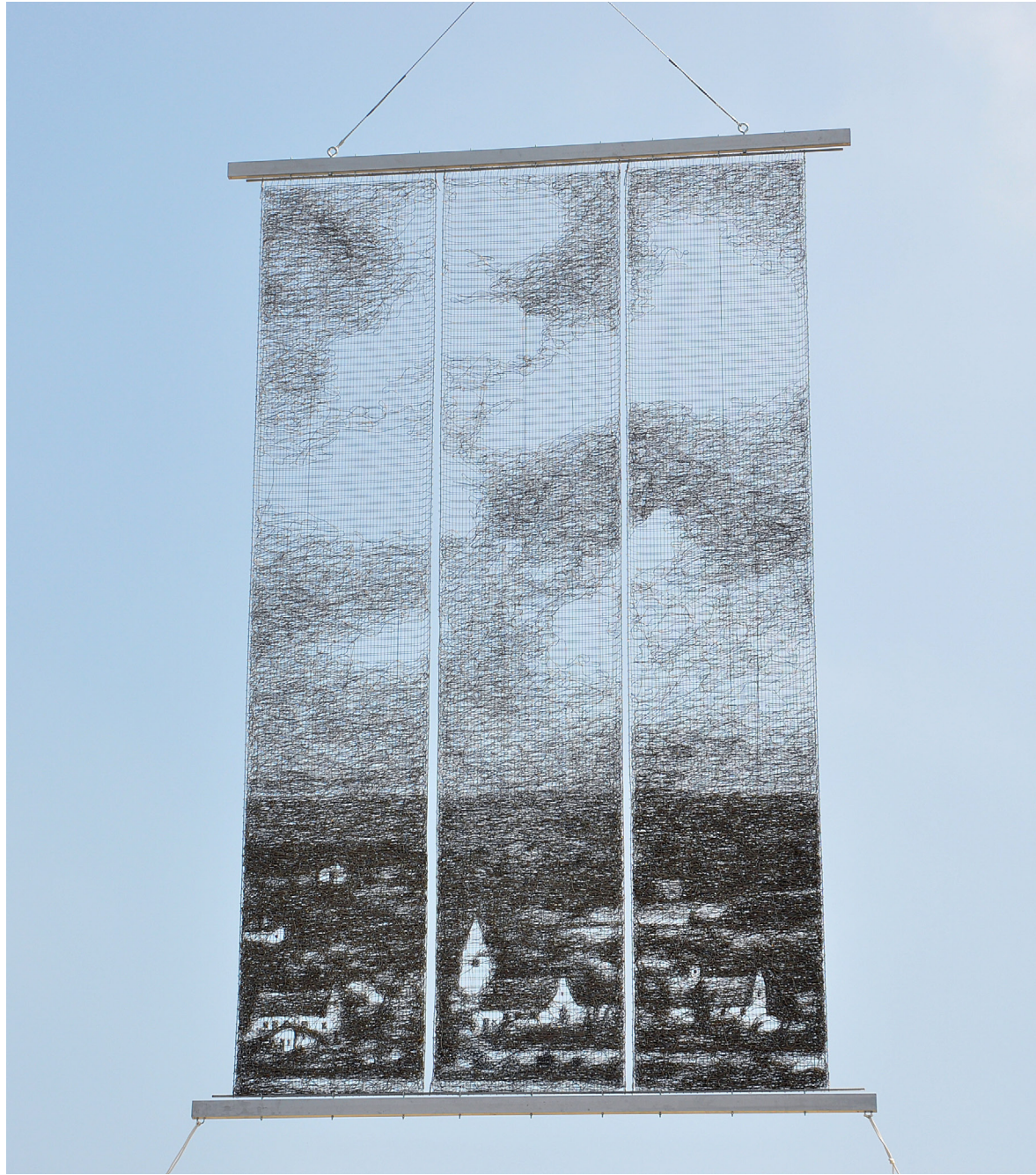
3 PANEL TAPESTRY MOCK UP