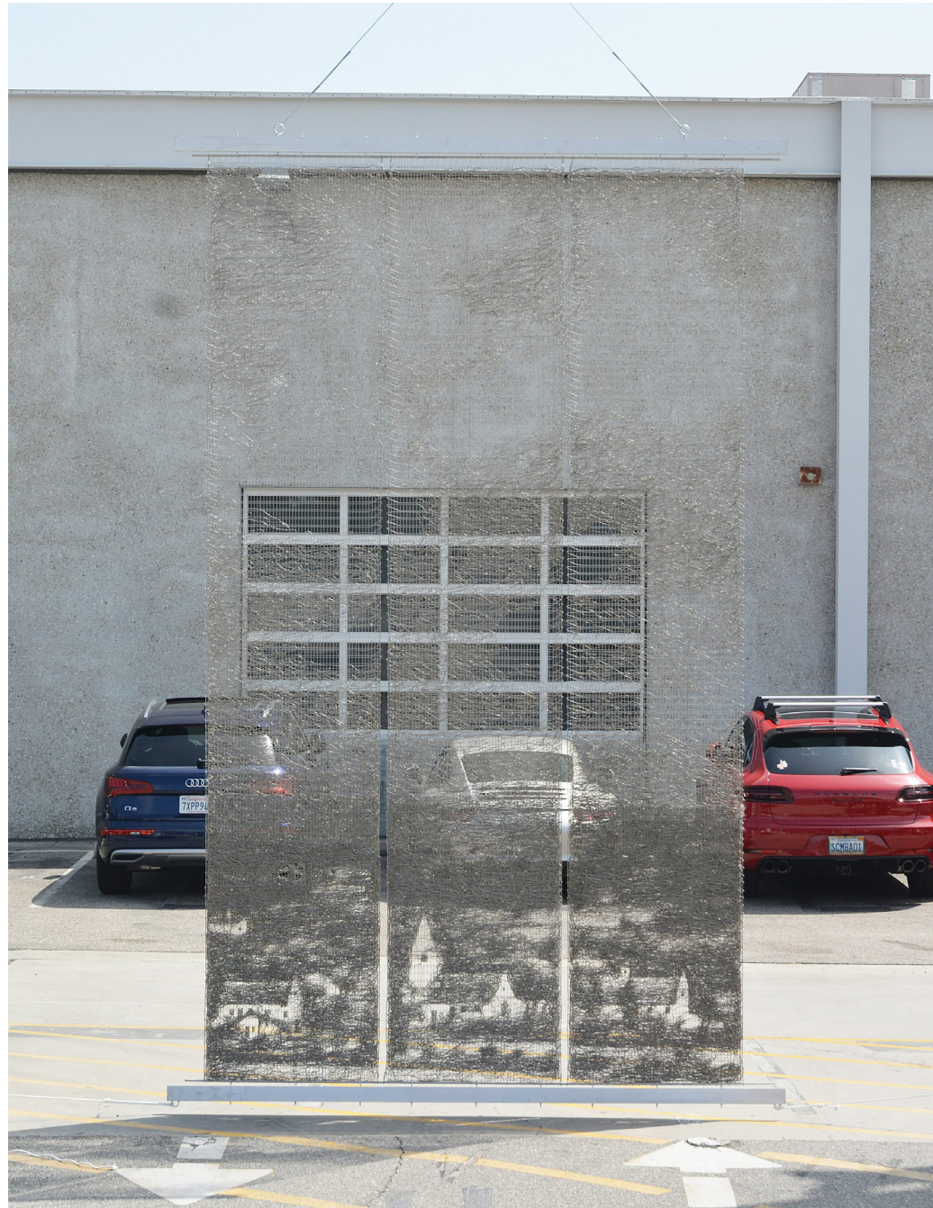
TAPESTRY MOCK UP ORIENTED TO MATCH VIEW FROM MEMORIAL TOWARDS LBJ BUILDING. BACKGROUND BUILDING IS AT DISTANCE OF 70' AWAY