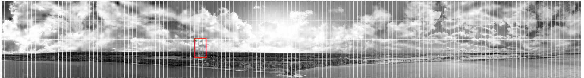
PANELIZED TAPESTRY SHOWING THE PANEL MOCK UP LOCATION IN CONTEXT