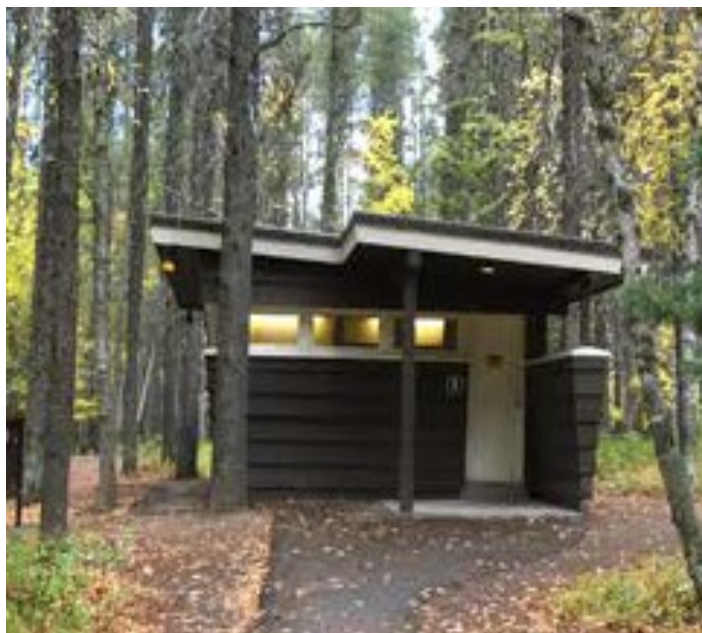
Comfort Station Bldg. #234

pre-Mission 66 Comfort Stations #228 and #234 and Mission 66 Comfort Stations #238 and #240 that contain National Register qualities, making it eligible for listing on the NRHP. These Comfort Stations are considered distinguished examples of rustic and modern architecture from two different periods of Park Service architectural development.