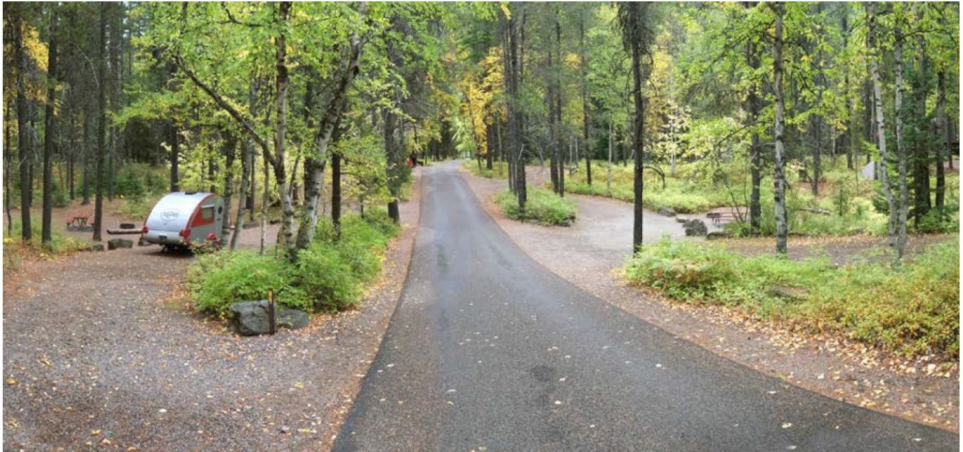
Apgar Campground