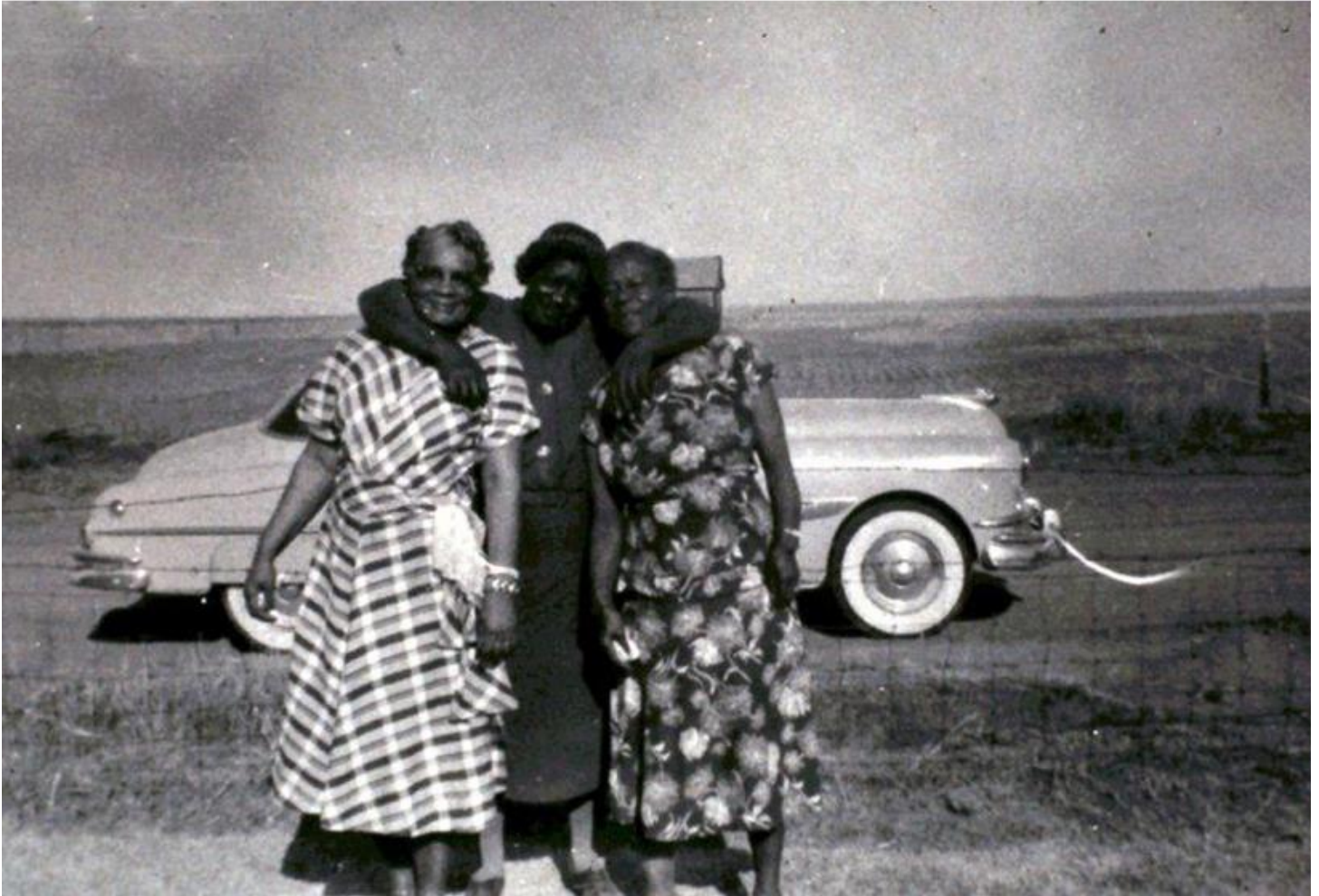
Three ladies from Nicodemus.

National Register of Historic Places Registration Form