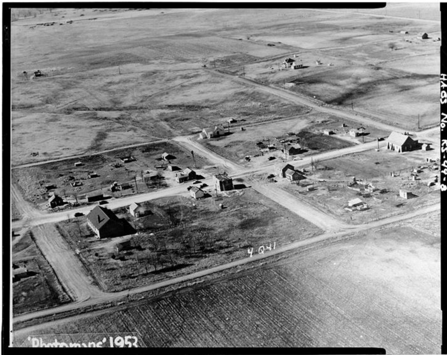
1953 aerial view of Nicodemus townsite. Library of Congress image, HABS KANS, 33-NICO, 1—8.

National Register of Historic Places Registration Form