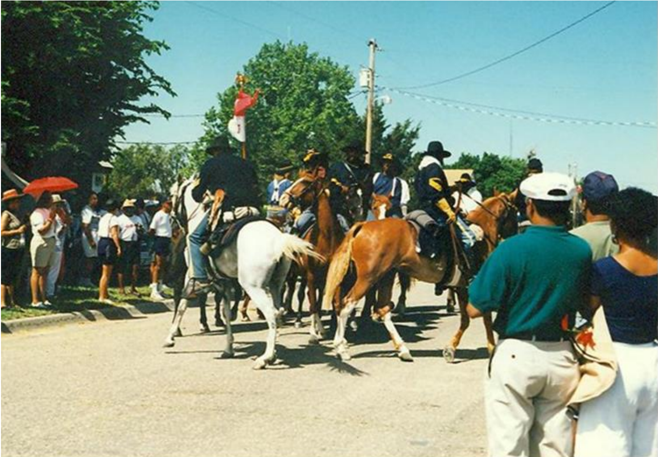
Nicodemus Homecoming Parade, 1997.

National Register of Historic Places Registration Form