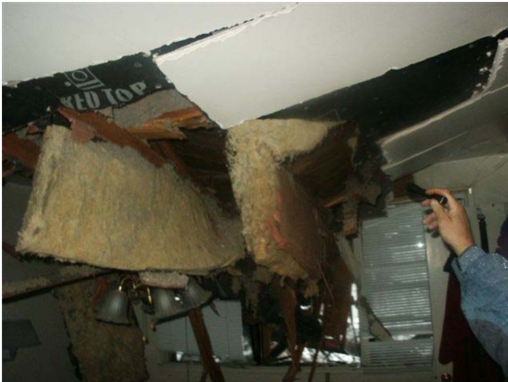
Photo 2 Ceiling Damage, Building H-56