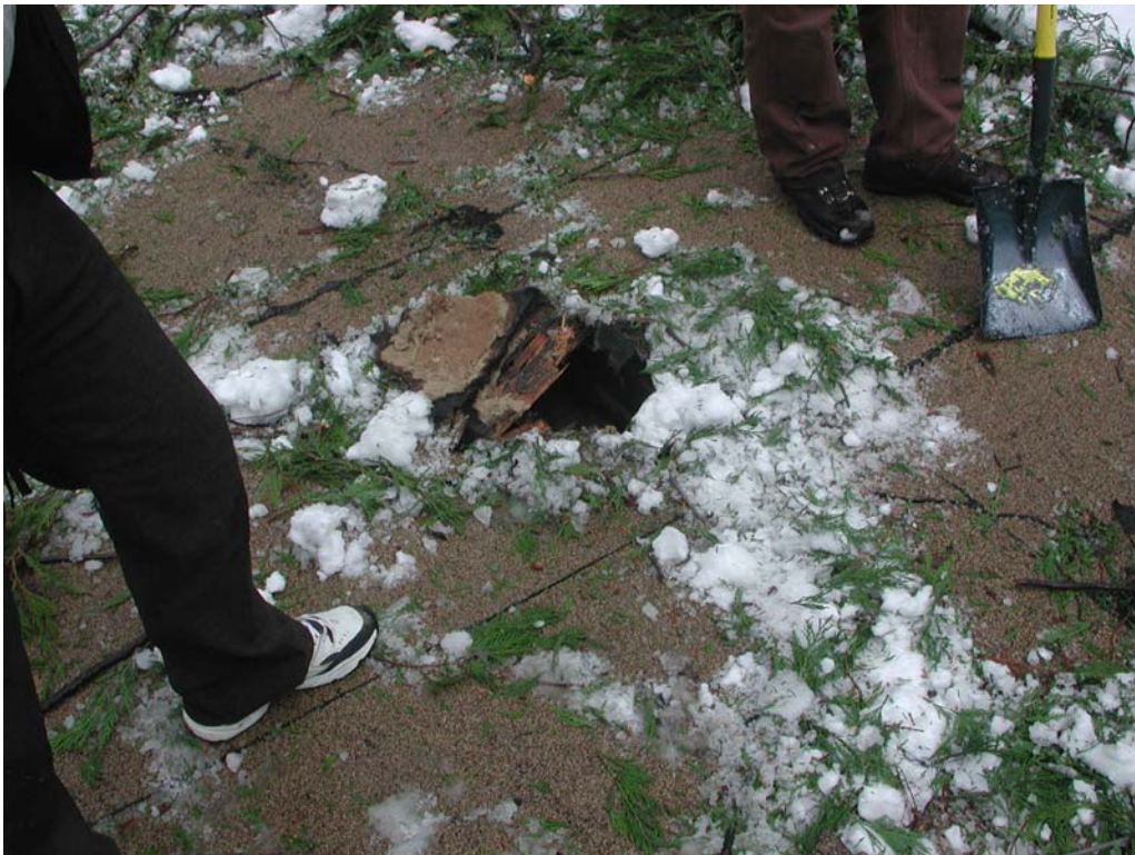
Photo 3 Hole in Roof , Building H-62