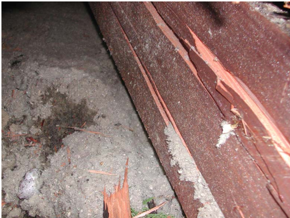
Photo 4 Cracked Roof Beam, Unit H-62