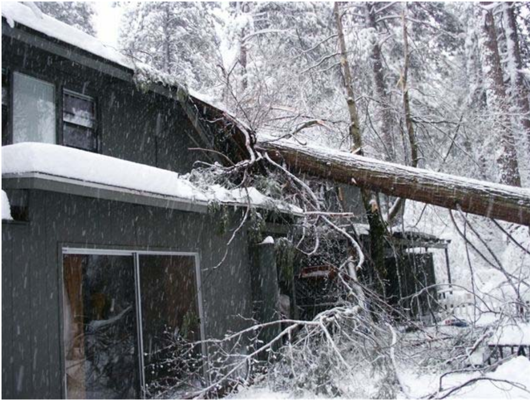
Photo 1 Building H-56 exterior, showing fallen tree