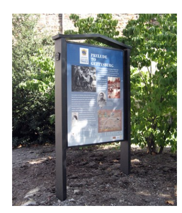
Trailhead wayside (4' x 6' under a roof. Wooden or metal posts.)