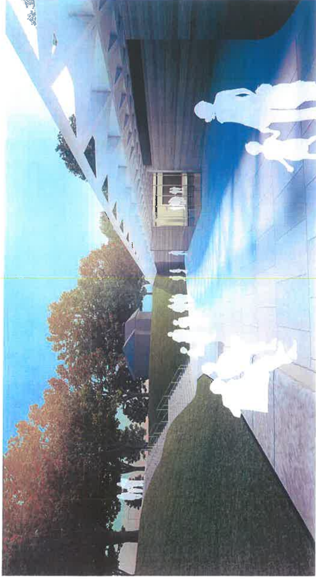
Education Center at The Walt Disney World © 2014