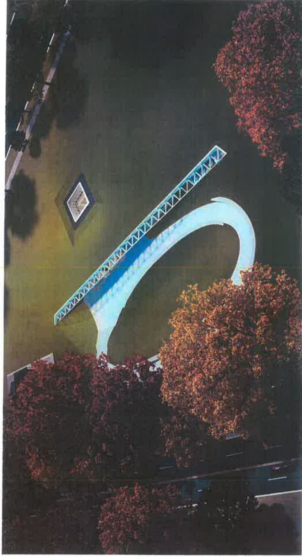
Education Center at The Wall ENNEAD ARCHITECTS 08.08.14